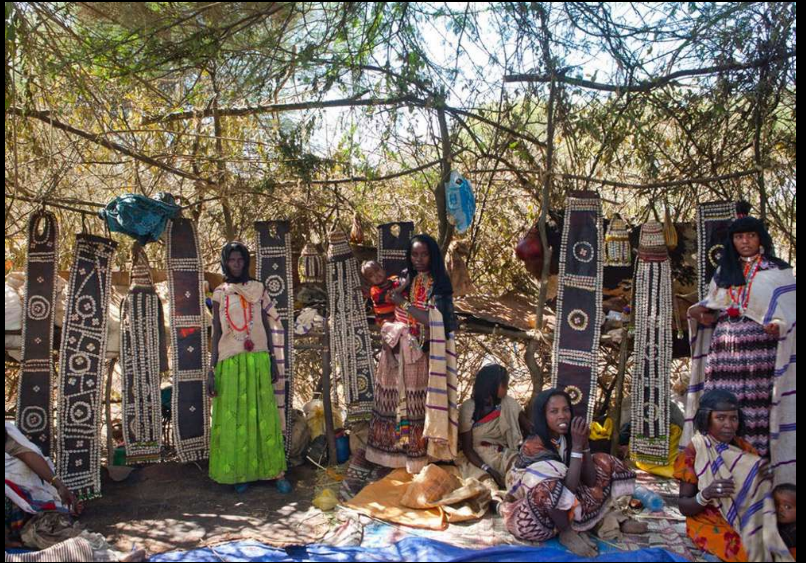
Some temporary housing is built to accommodate thousands of Karrayyu. Each member of the current ruling party owns a different house where they host family and friends in their final moments in power. Here, people will eat, sleep, and socialize under the same roof. The festive decorations along the walls represent good luck and an auspicious future.