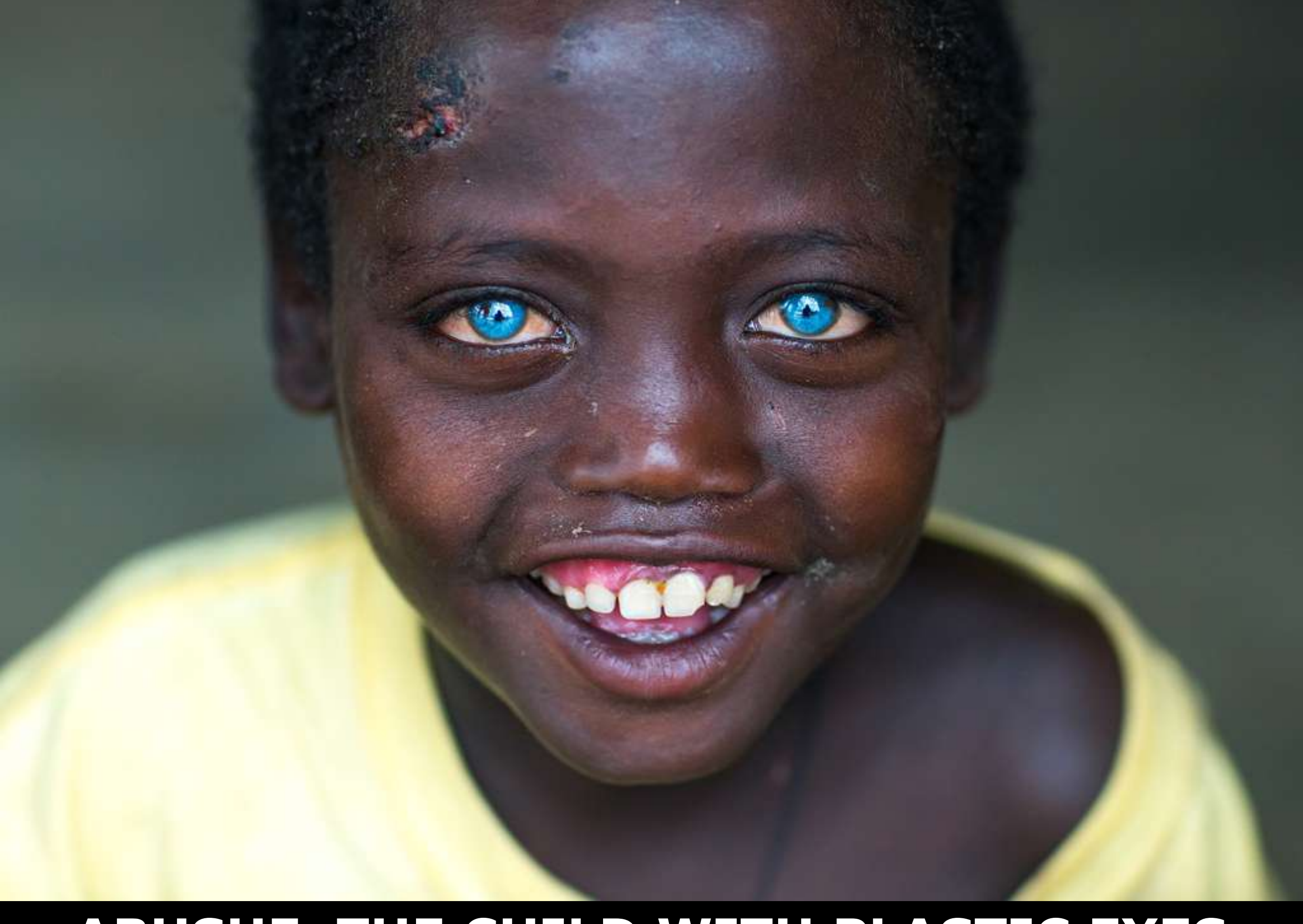
ABUSHE, THE CHILD WITH PLASTIC EYES