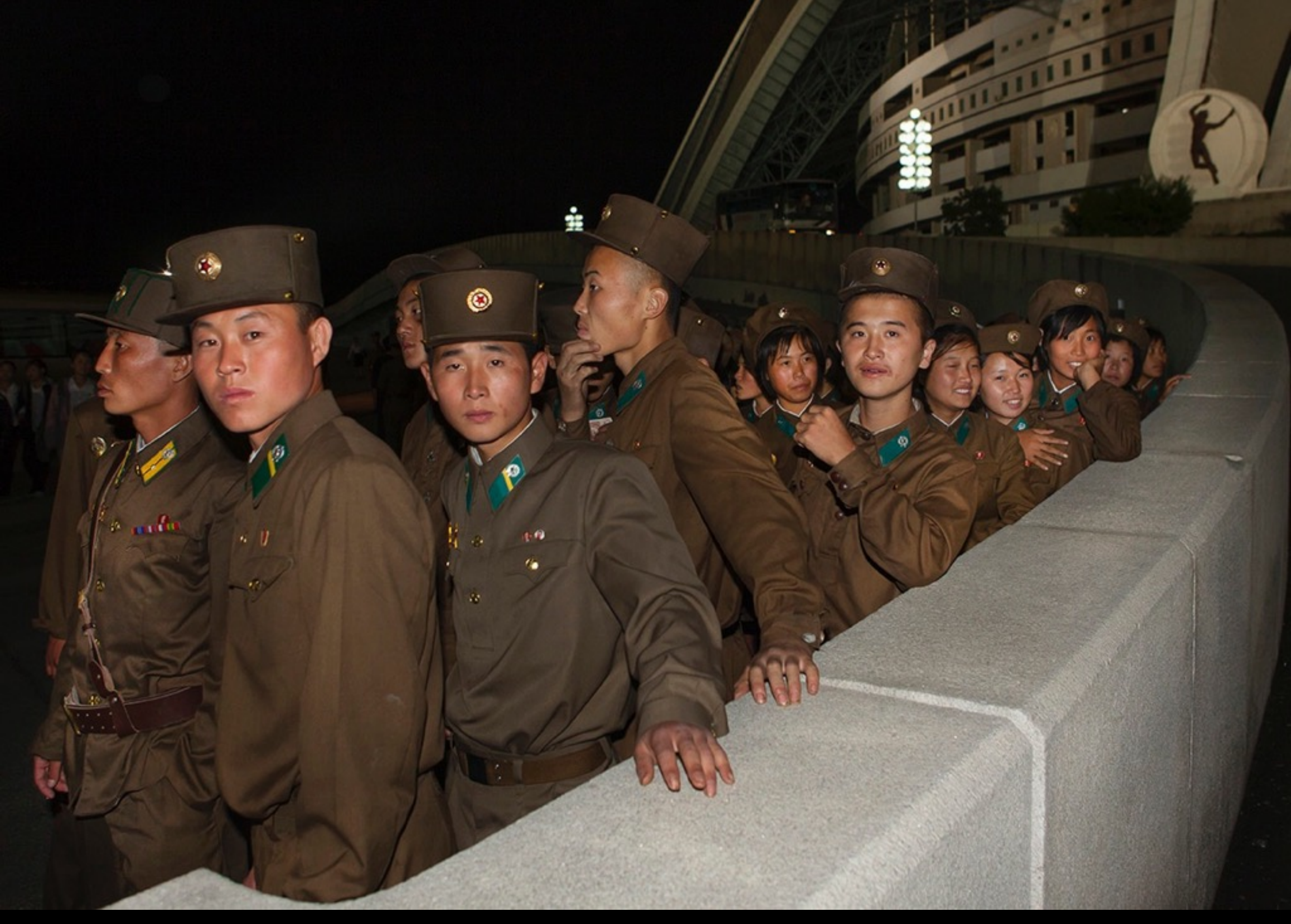
After years of serving their country, some soldiers are rewarded with access to the spectacle.