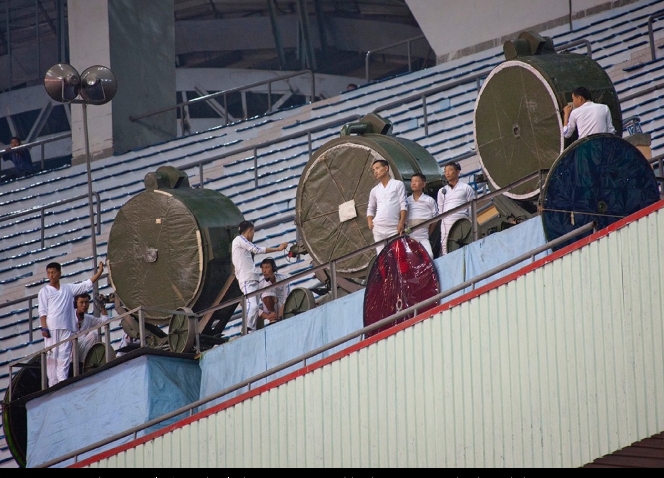
Everything, including the lights, is operated by humans. No high tech here.