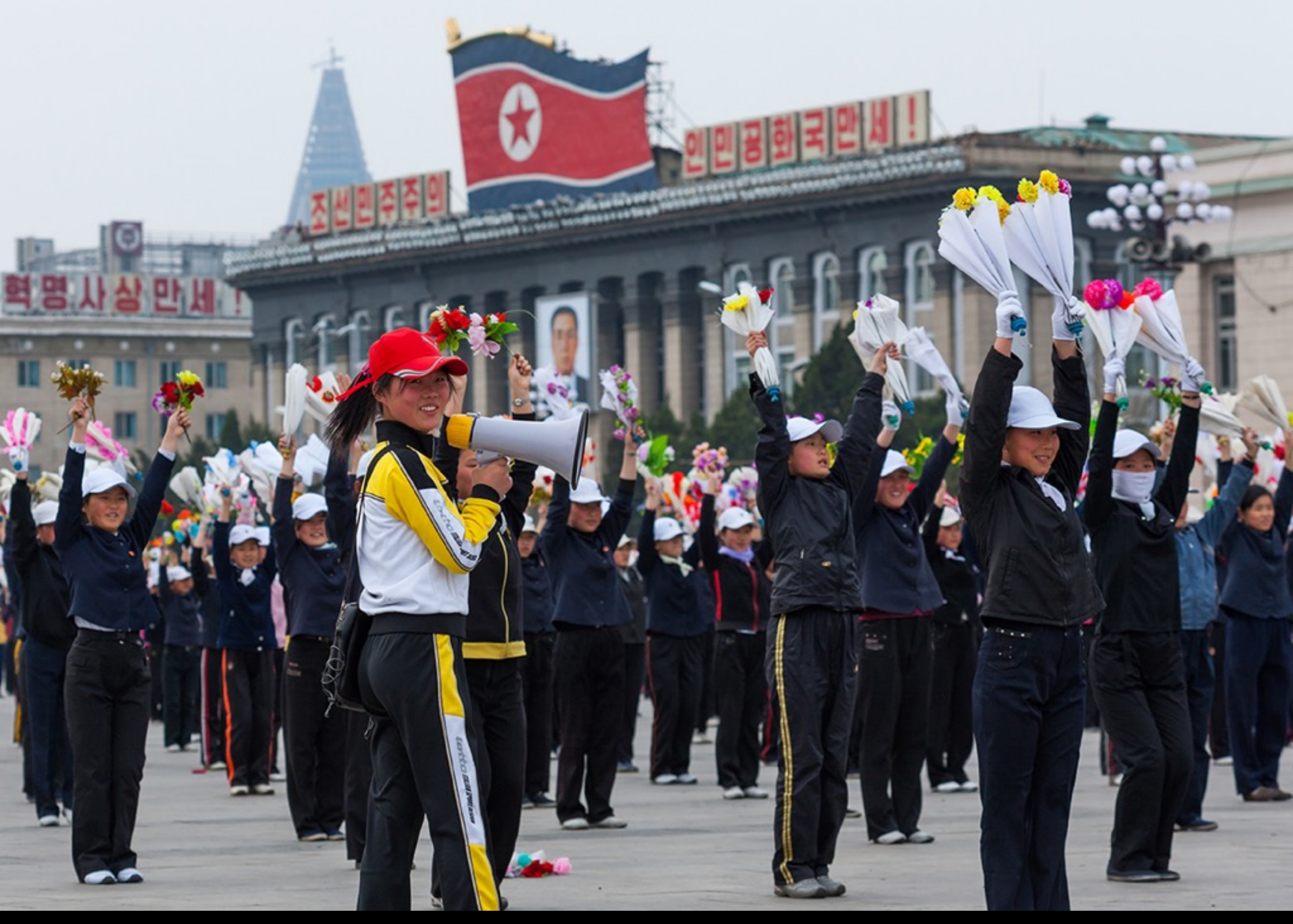
Over 100,000 performers prepare the show. The youngest participants join the others after school.