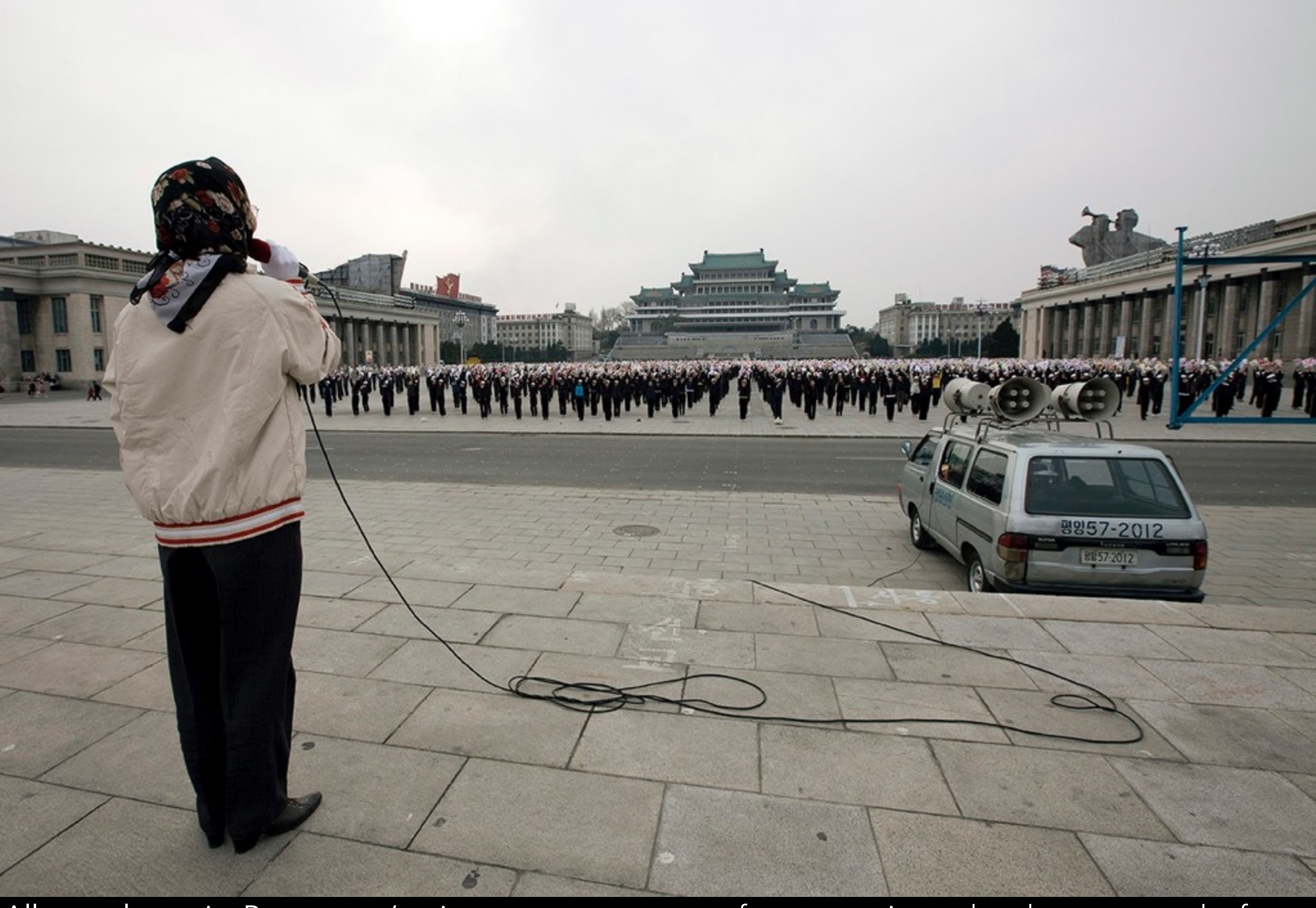
All year long, in Pyongyang's giant town square, performers train under the command of one megaphone-wielding woman in preparation for the Arirang.