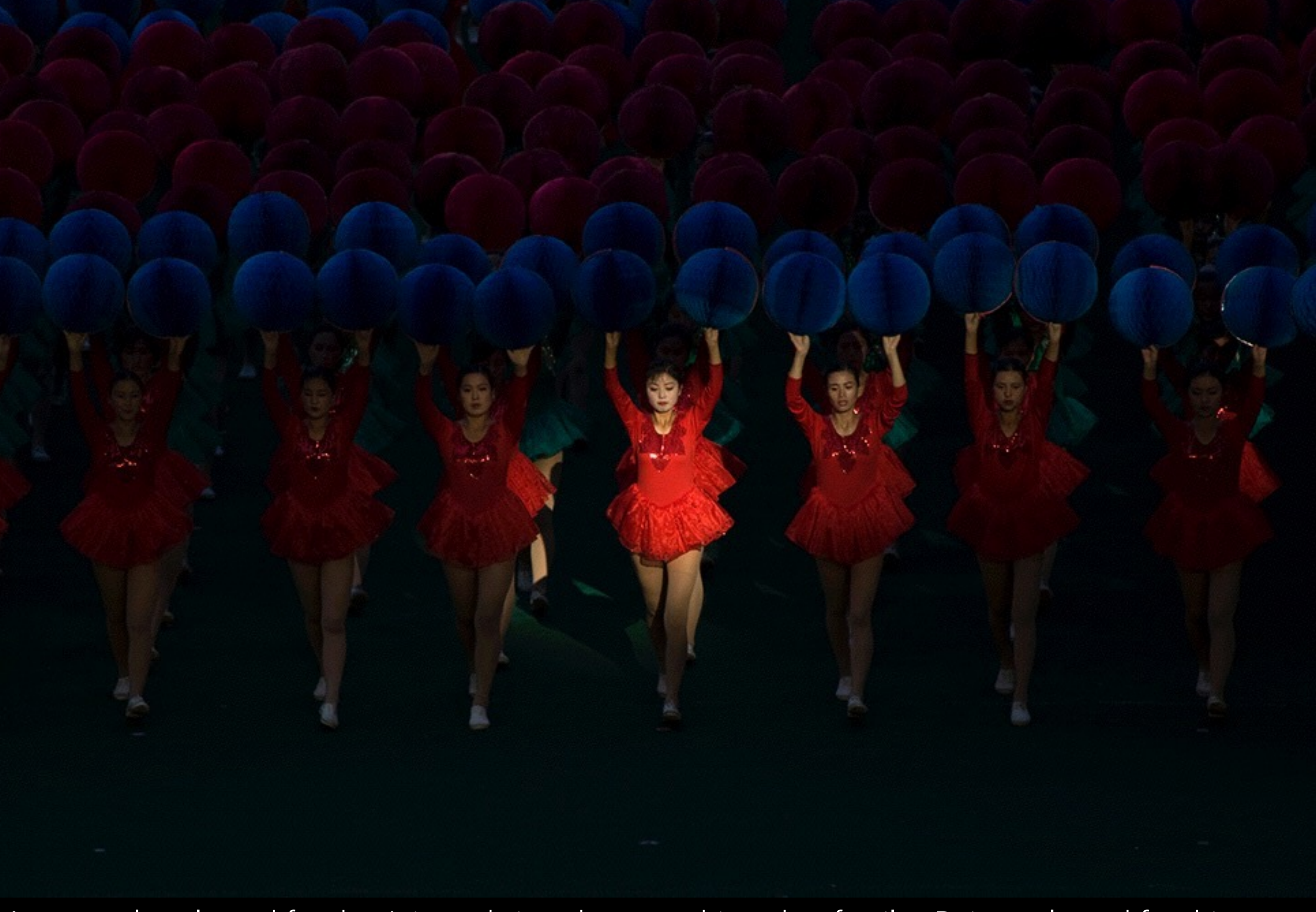
Any people selected for the Arirang brings honor to his or her family. Being selected for this event is very difficult.