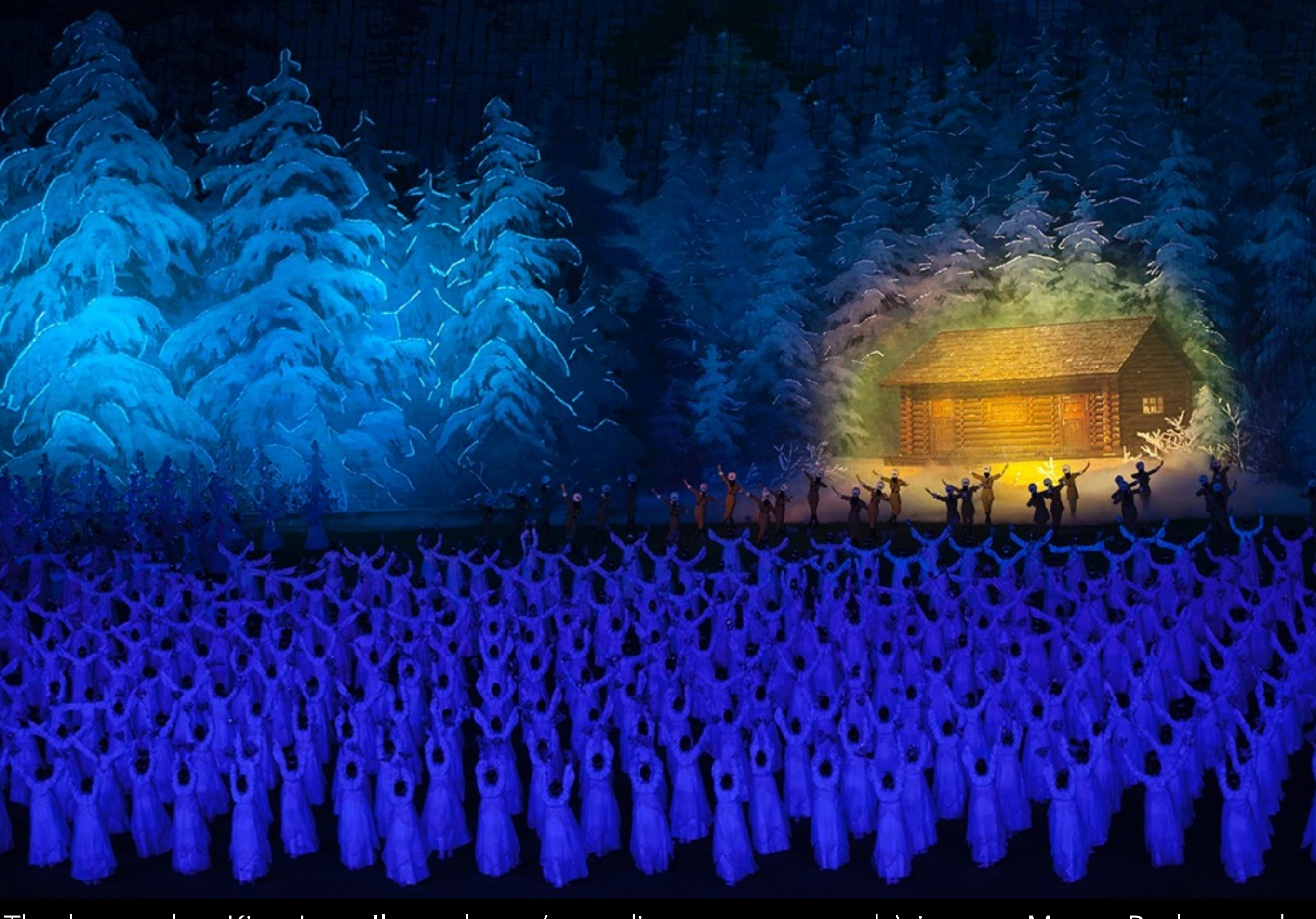
The house that Kim Jong II was born (according to propaganda) in near Mount Paektu at the chinese border..