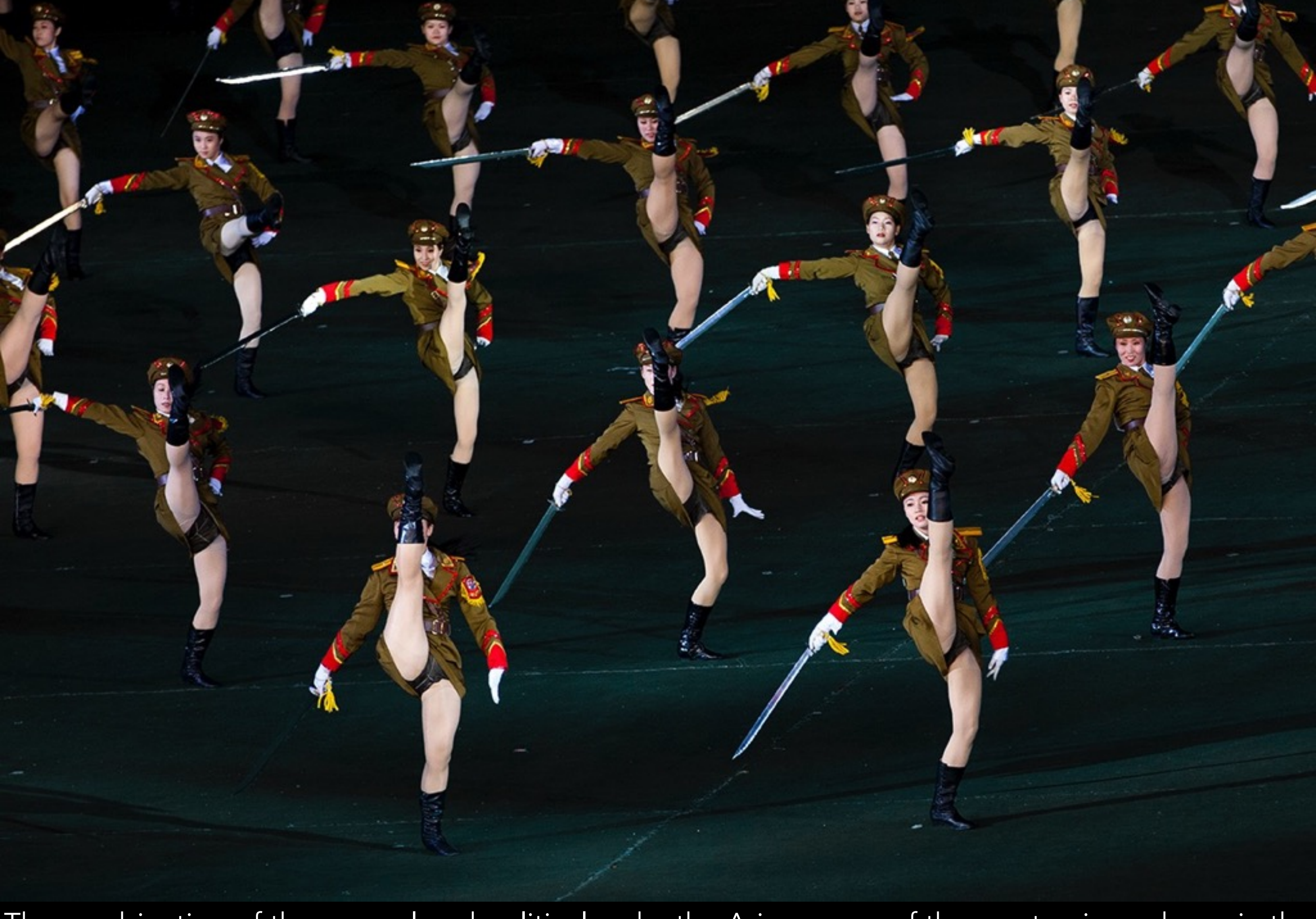
The combination of the sensual and political make the Arirang one of the most unique shows in the world!