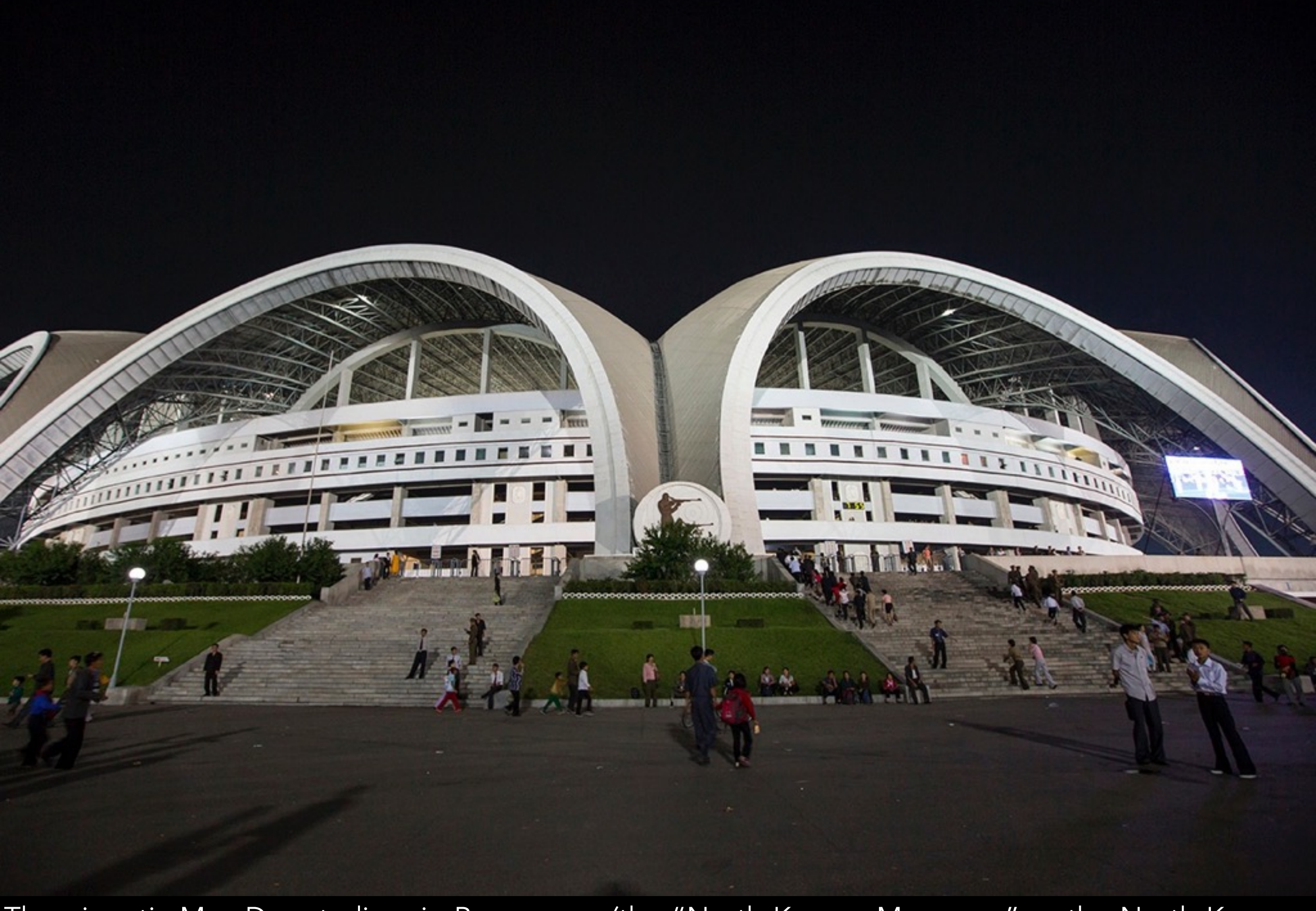
The gigantic May Day stadium in Pyongyang (the "North Korean Maracana" as the North Koreans affectionately call it) is home to these mass games.