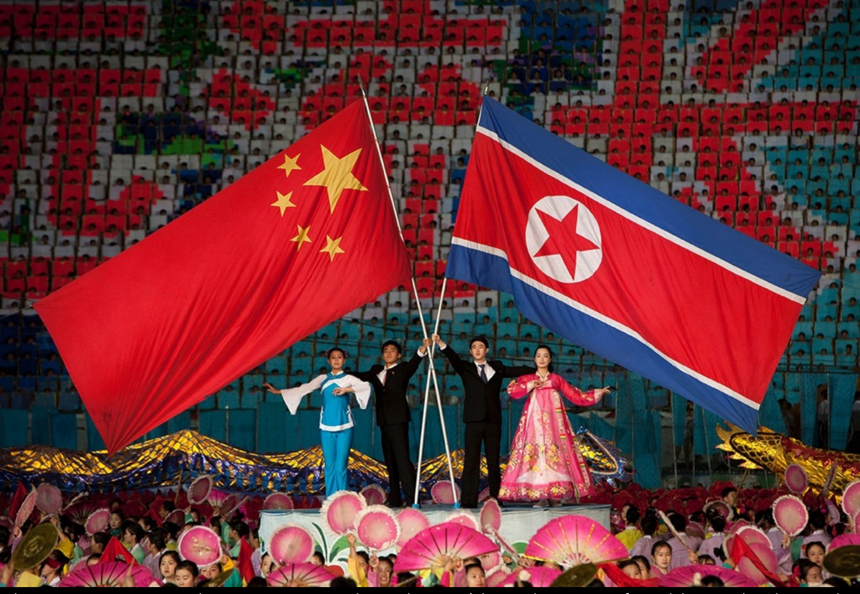
The Arirang is a good opportunity to show the world North Korea's friendship with China. The spectacle ends with the waving of the two countries' flags.