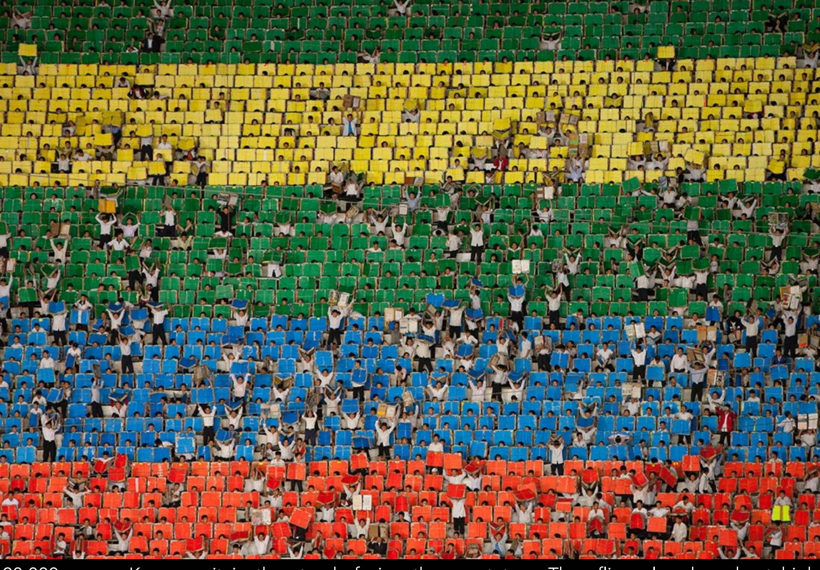
20,000 young Koreans sit in the stands facing the spectators. They flip colored cards at high speeds, forming mosaics of nationalist imagery.