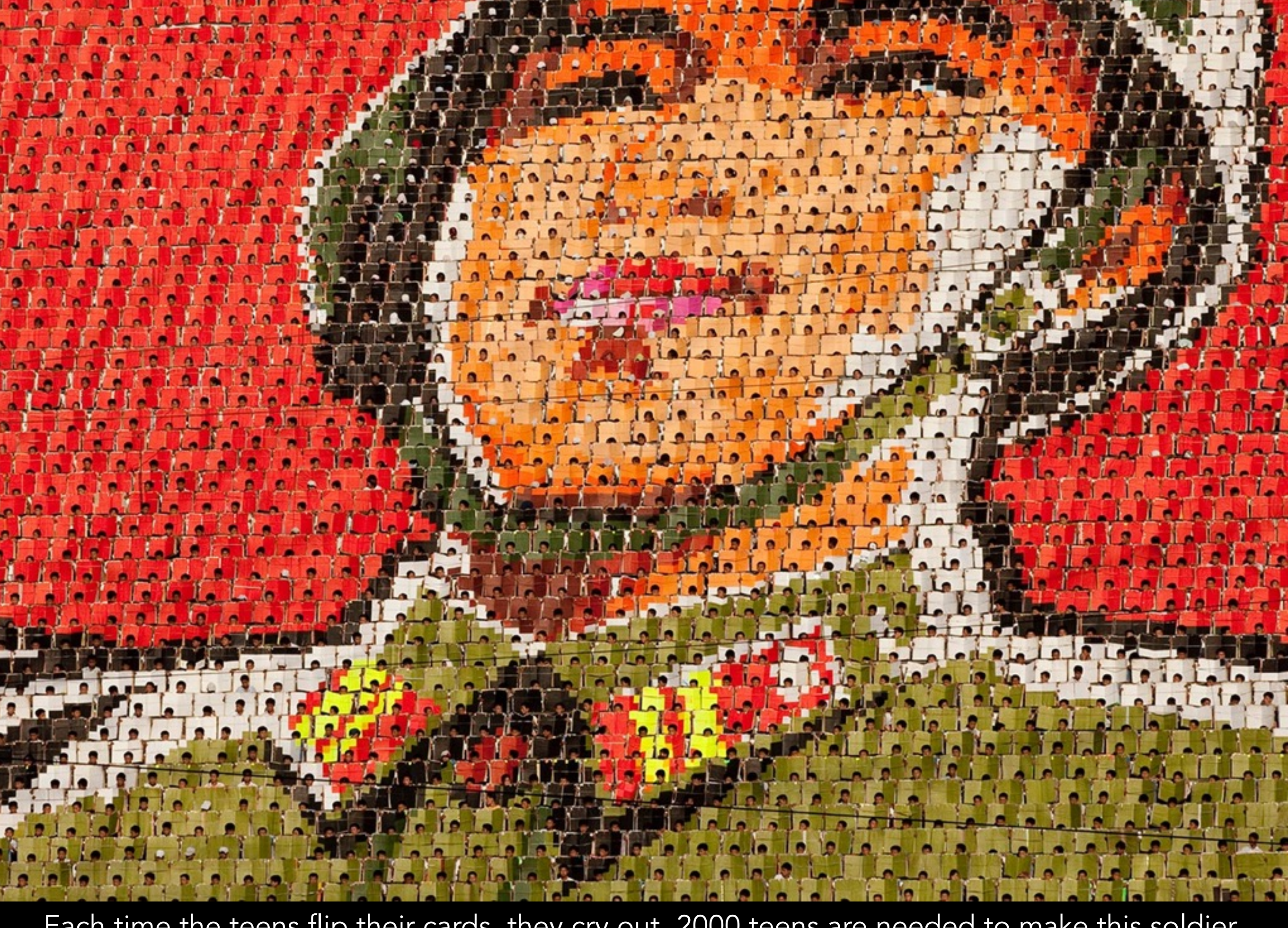
Each time the teens flip their cards, they cry out. 2000 teens are needed to make this soldier