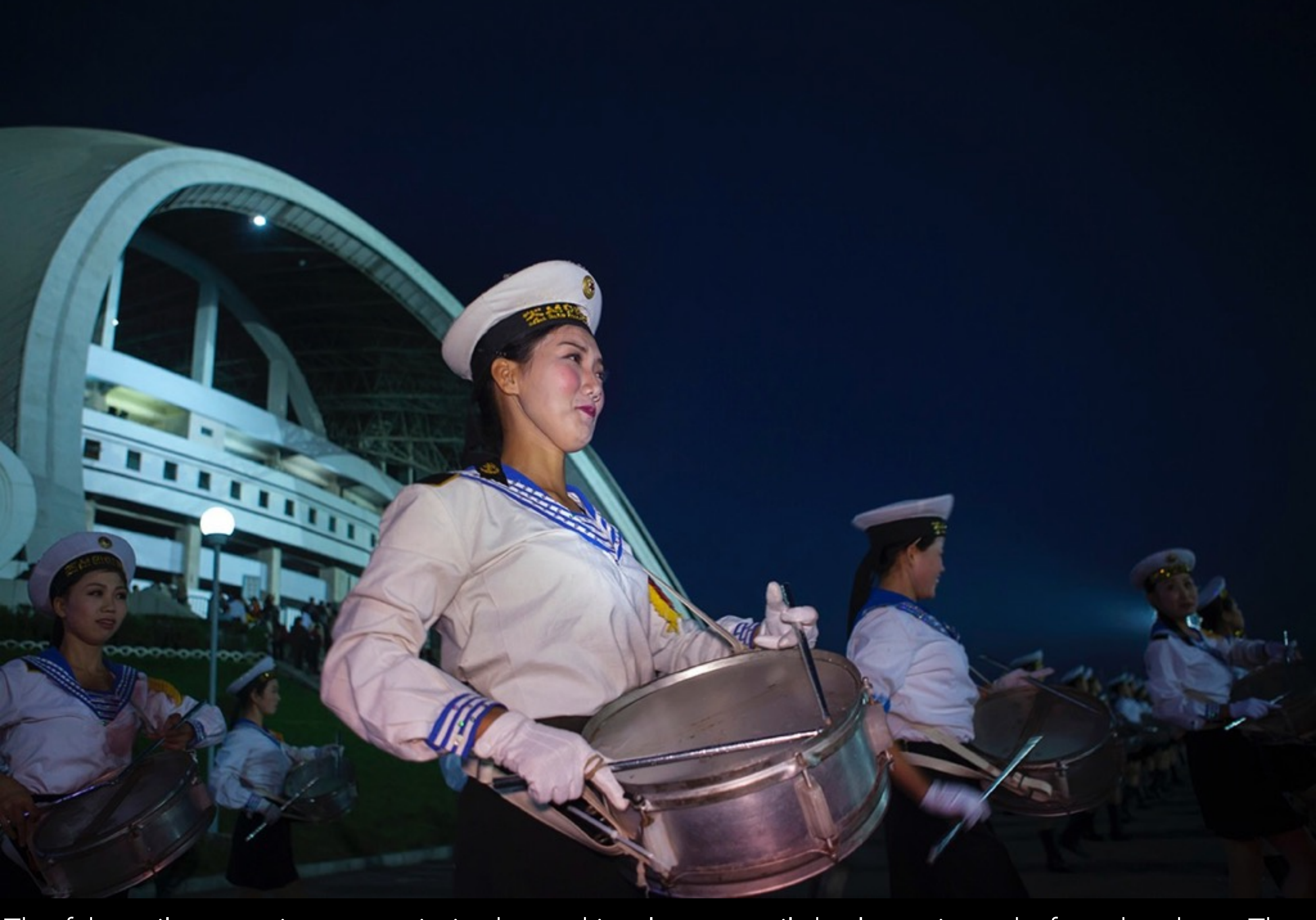
The fake sailors continue to train in the parking lot up until the last minute before the show. They strive for nothing less than perfection.