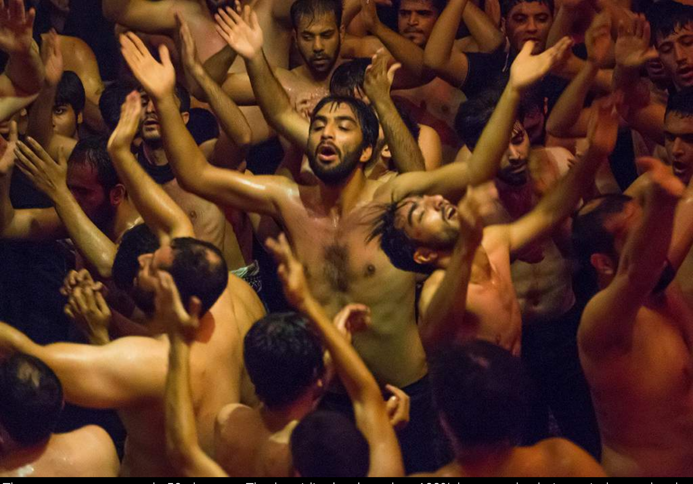
The temperature exceeds 50 degrees. The humidity level reaches 100% but everybody is carried away by the trance. Bodies jump to the hypnotic rhythm of the "Hussein, Hussein" chants on a techno-like beat.