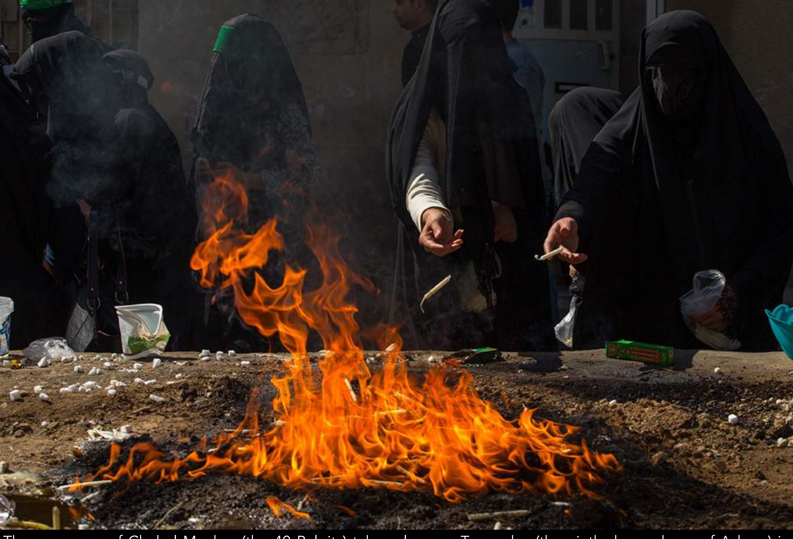
The ceremony of Chehel Manbar (the 40 Pulpits) takes place on Tasua day (the ninth day and eve of Ashura) in Khorramabad only. Women and some men light 40 candles and throw 40 pieces of sugar in 40 different locations to make a wish.