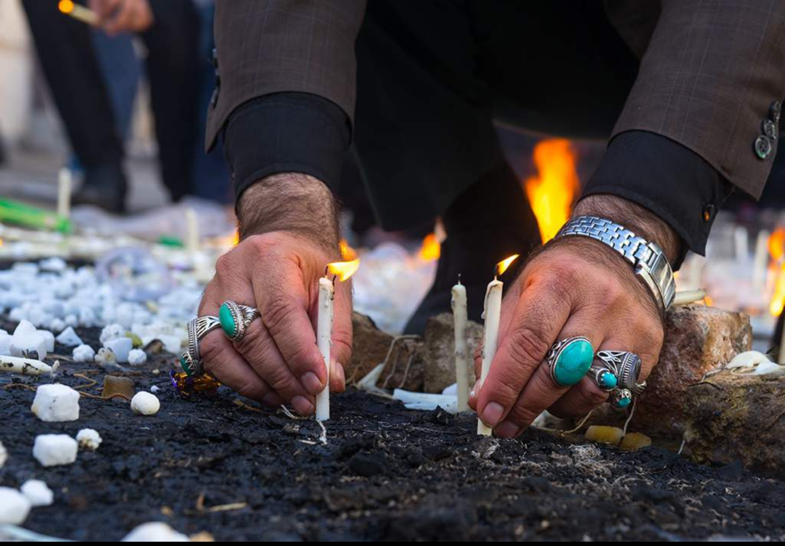
At the 40th stop, after making a wish, people take a candle that was already put there by someone else to make sure that their wish will be granted. They call this the insurance.