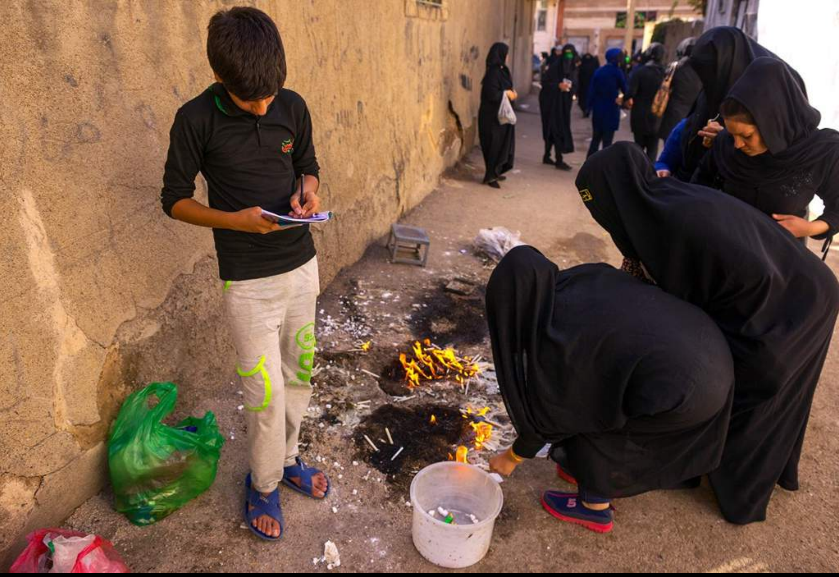
A boy is giving out the address of one of the 40 houses where women go to light candles. If the wish is granted, the person will return there next year to bring what she promised in exchange for her wish.