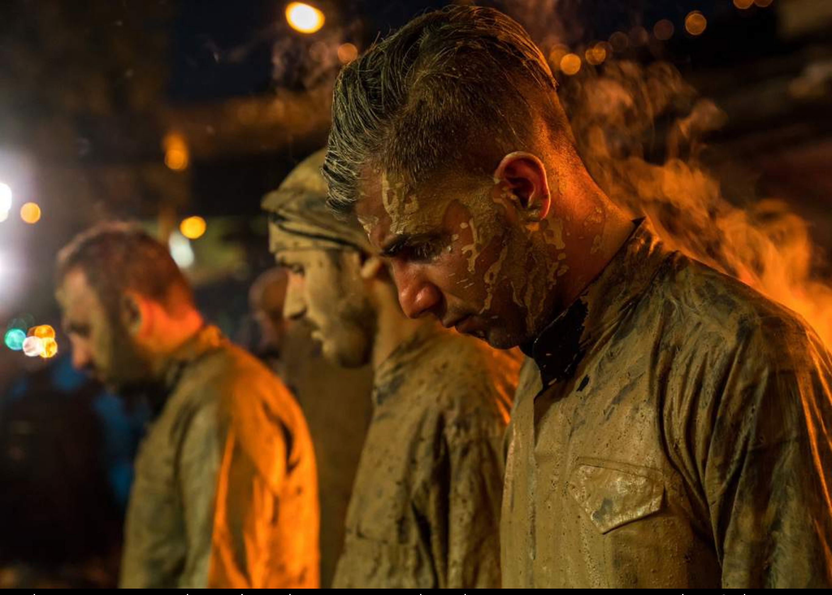
The ceremony is taking place during winter, when the temperature stays under 10 degrees.