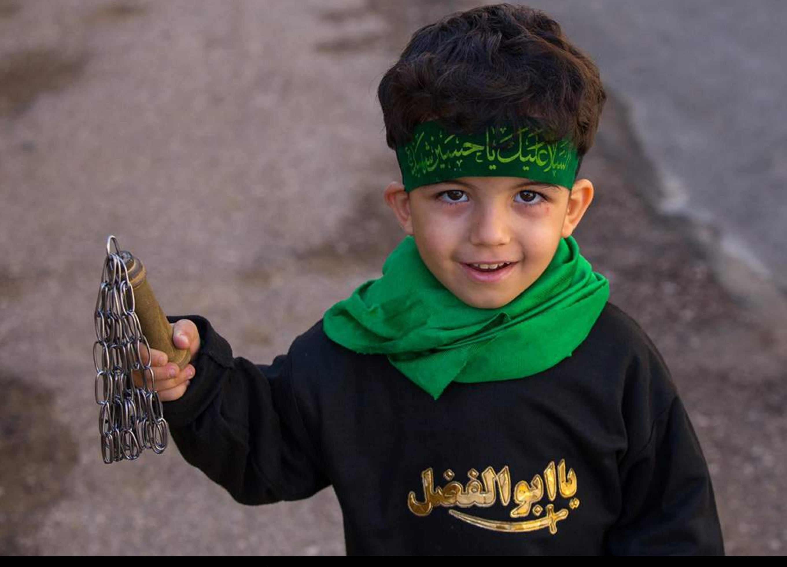
On this occasion, small safe zanjirs are sold so children may mimic the adults.