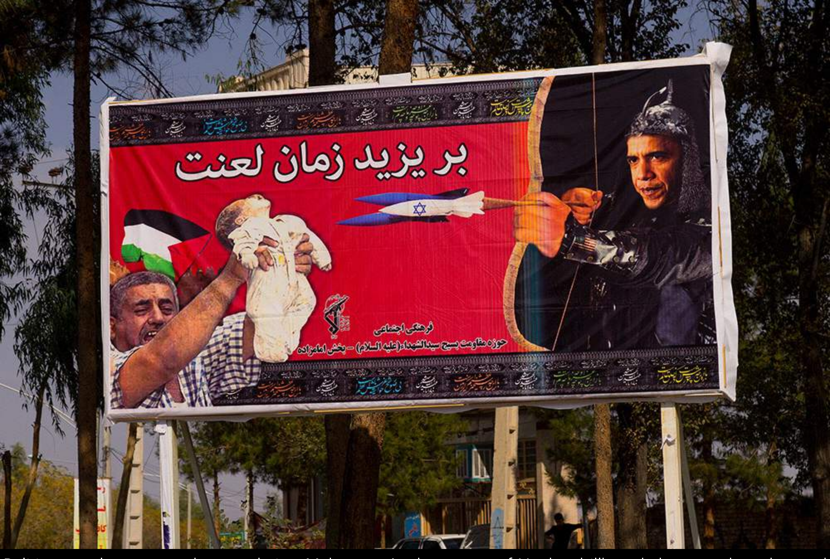
Politics are always around, even during Muharram. In the streets of Yazd, a billboard shows a photoshopped Obama as the traitor Hurmala, who killed Hussein's son, the young Ali Asghar, with an arrow – bearing the colours of Israel on the poster.