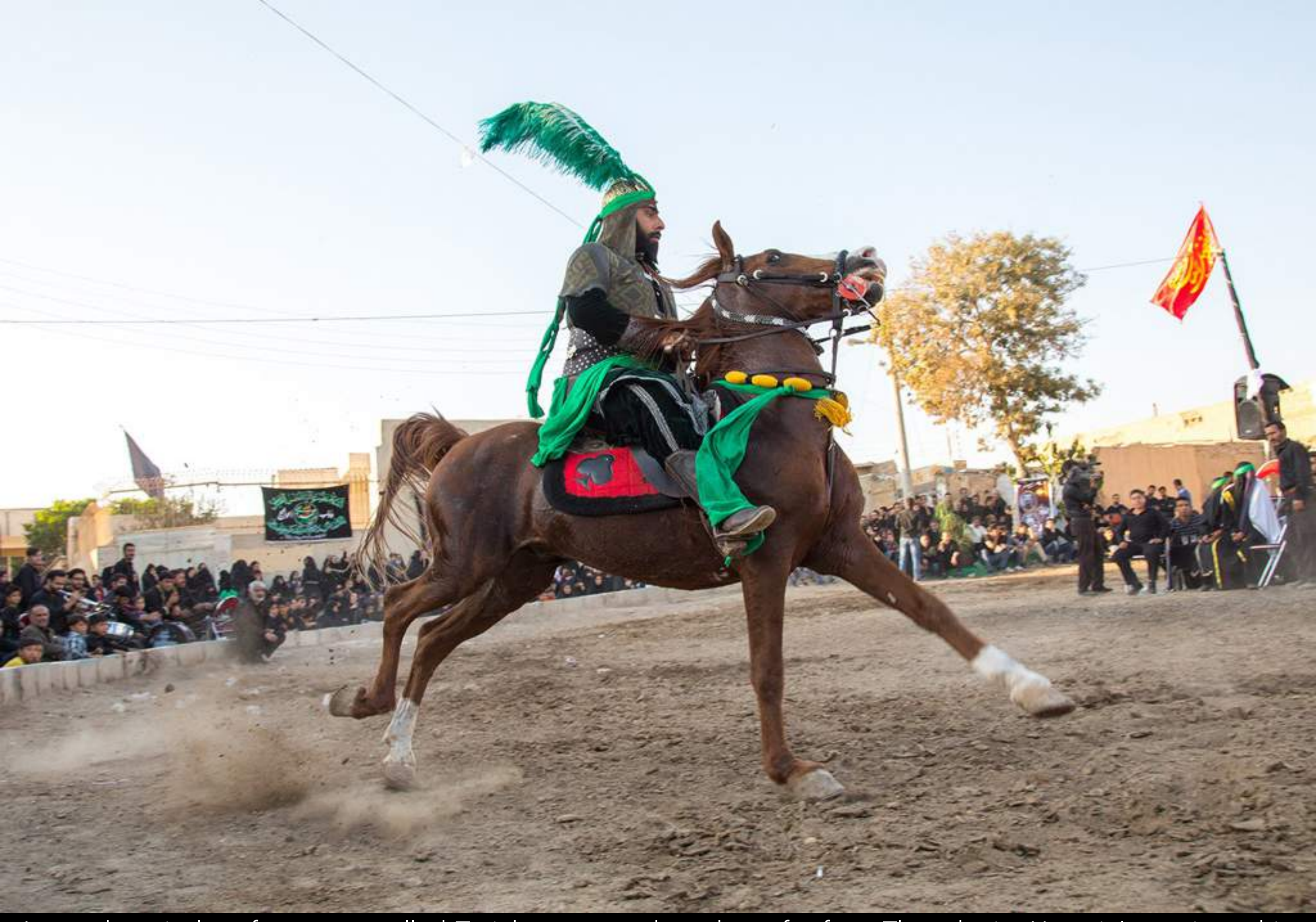
Large theatrical performances called Tazieh are staged outdoors for free. They depict Hussein's tragic end in front of a stunned audience.