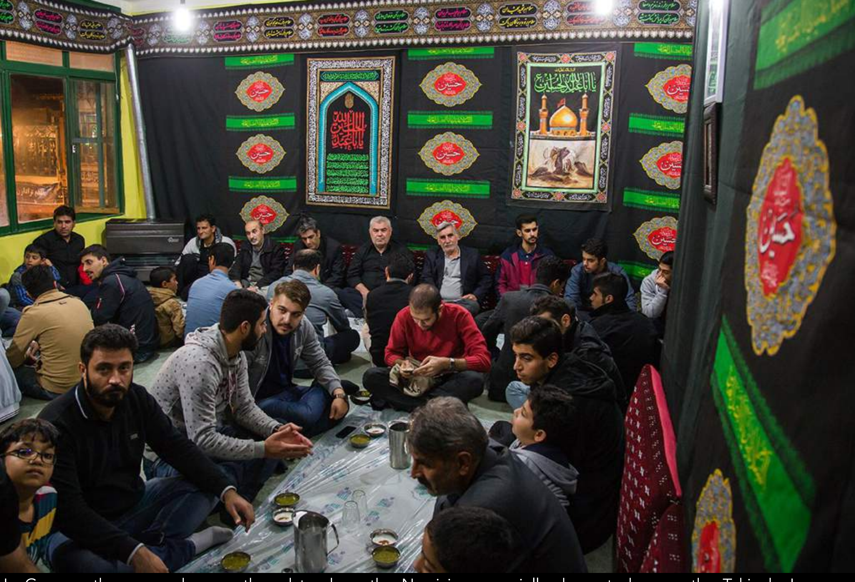
In Gorgan, these men have gathered to share the Narzi in a specially decorated room, the Takiyeh. In some places, women also have their separate private room. Clerics are invited to deliver sermons. The elderly believe that the Narzi also has healing powers.