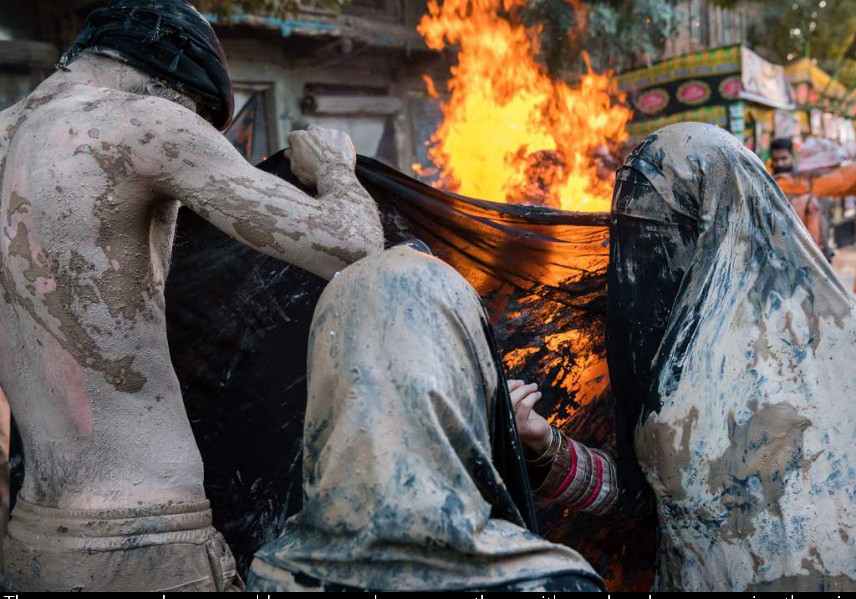
The women are chaperoned by a man who smears them with mud and accompanies them in front of the fire.