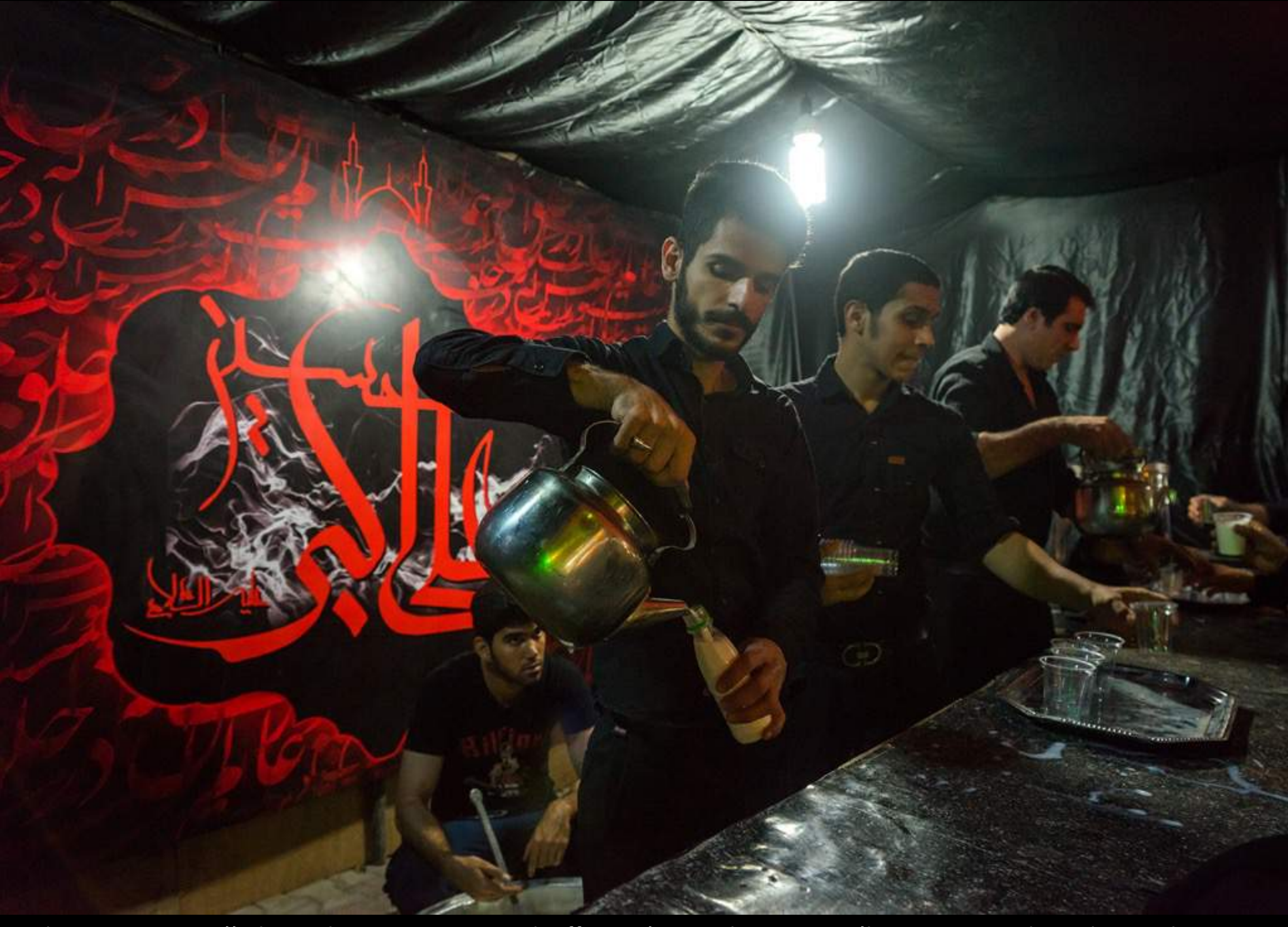
In the streets, stalls have been set up and offer unlimited tea or milk to passers-by. This is the Nazr.