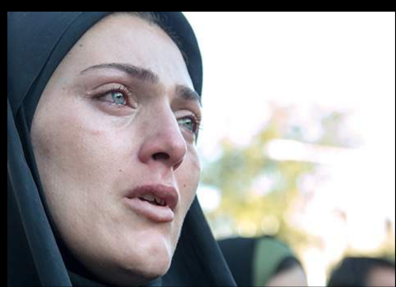
A man must be strong and not cry in the Iranian culture. But during Muharram, no one holds their tears back.