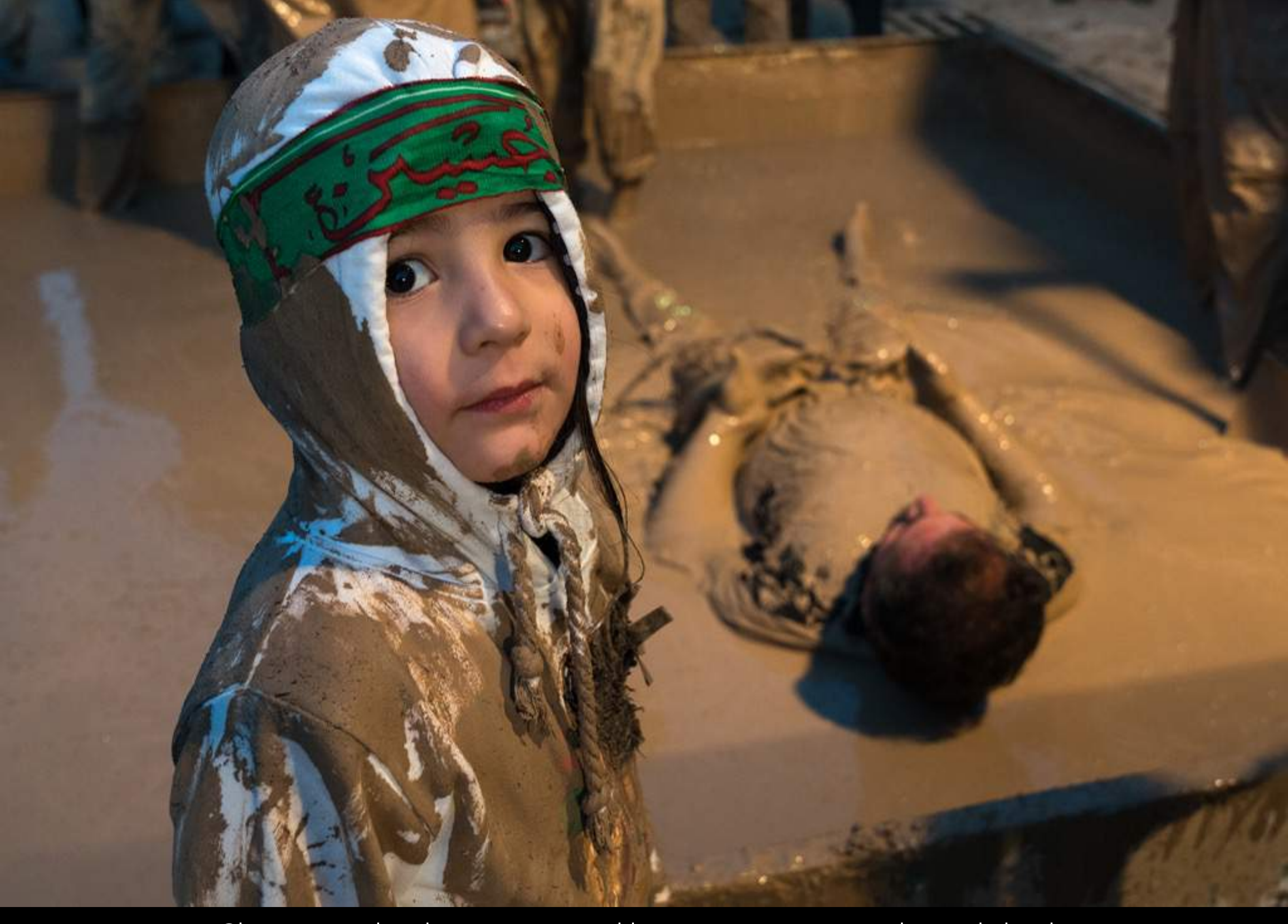
Clay is mixed with rosewater and hot water to prevent thermal shock.