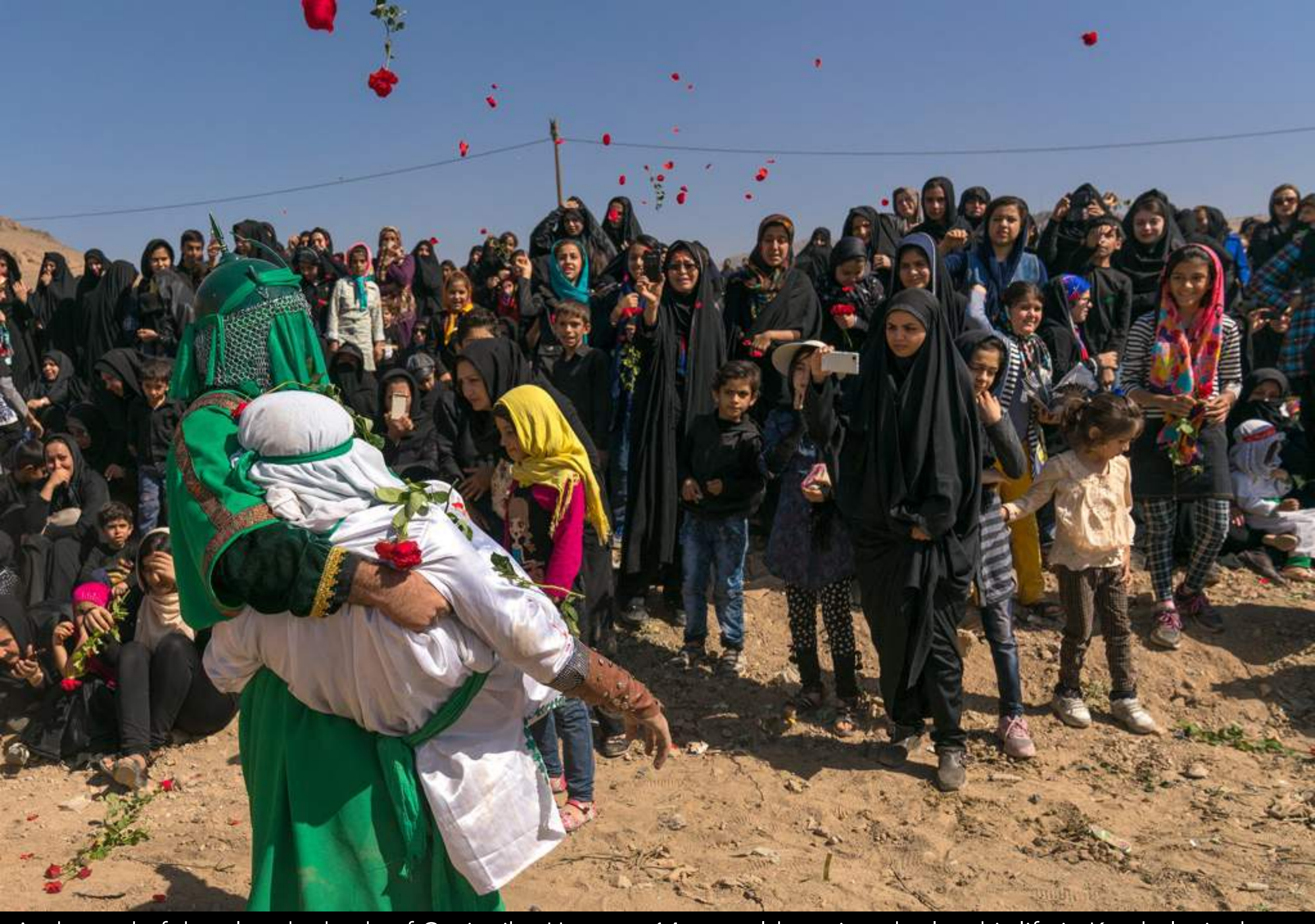
At the end of the play, the body of Qasim ibn Hasan, a 14-year-old warrior who lost his life in Kearbala, is shown to the crowd, who covers him with roses.