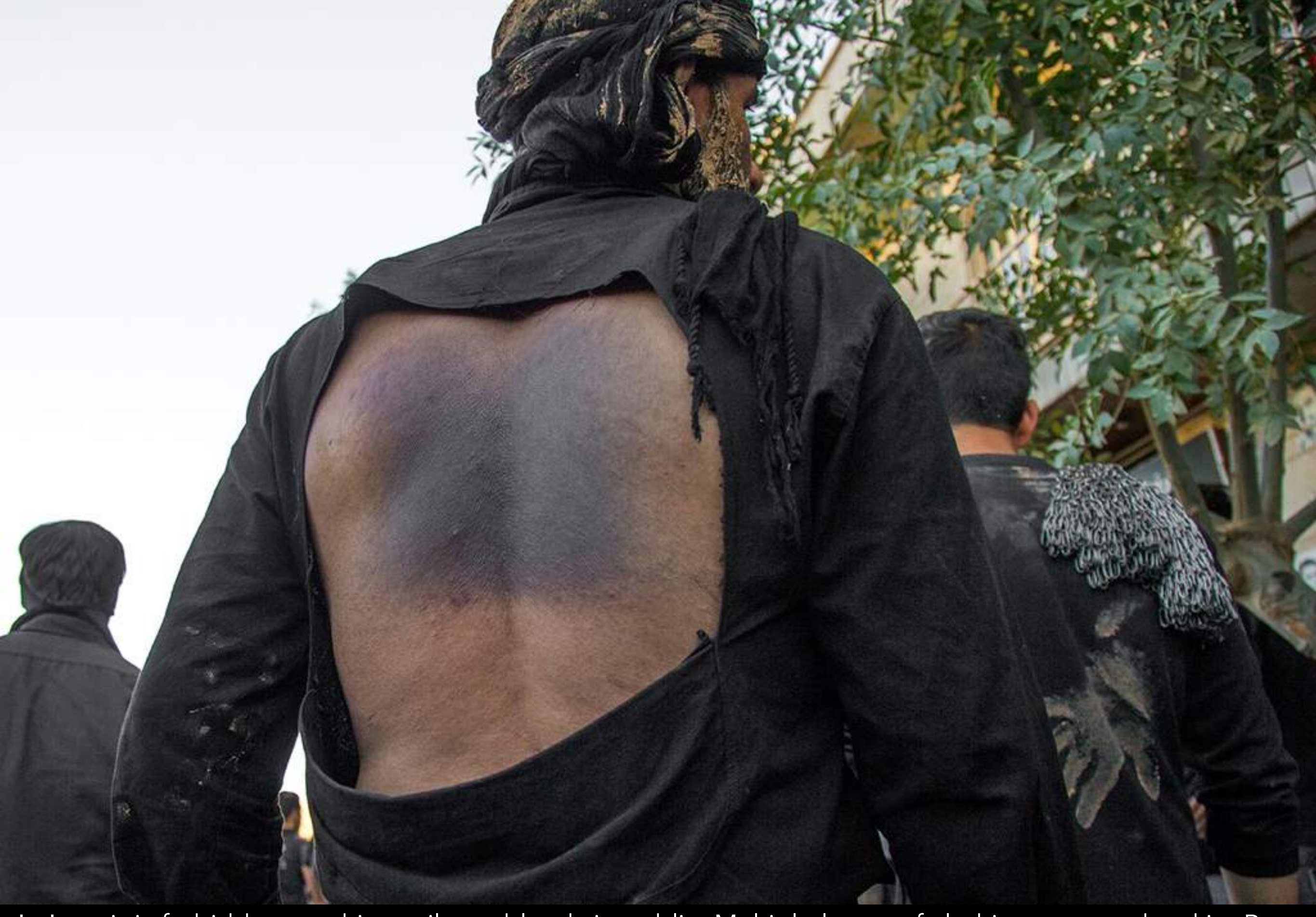
In Iran, it is forbidden to whip until one bleeds in public. Multiple layers of clothing protect the skin. Rare are those with wounds on their back, like this man.