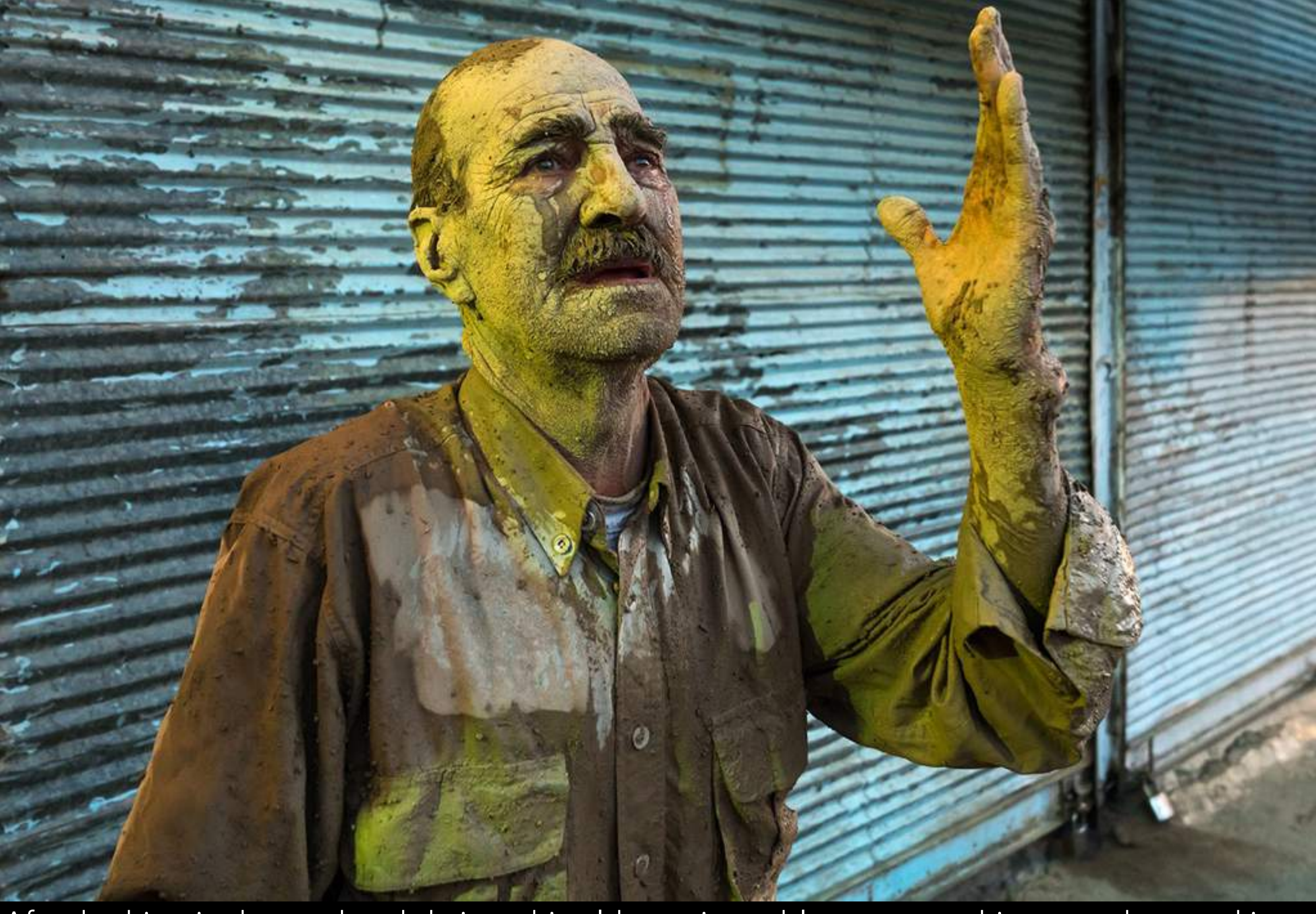
After bathing in the mud and drying, this old man is unable to repress his tears when evoking Hussein. Passers-by will stop to console him.