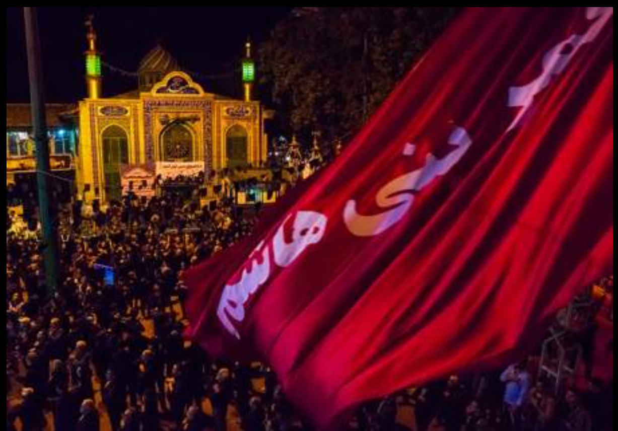
Red symbolises the blood shed by Hussein and the martyrs. During Muharram, the water at the Shah-e-Cheragh mausoleum basin in Shiraz is dyed red.