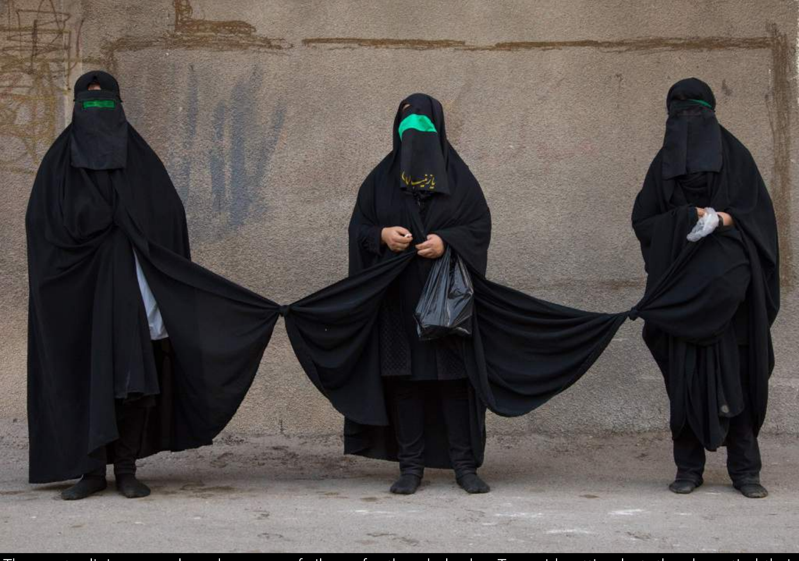
The most religious people make a vow of silence for the whole day. To avoid getting lost, they have tied their chadors together. They also walk without wearing any shoes.