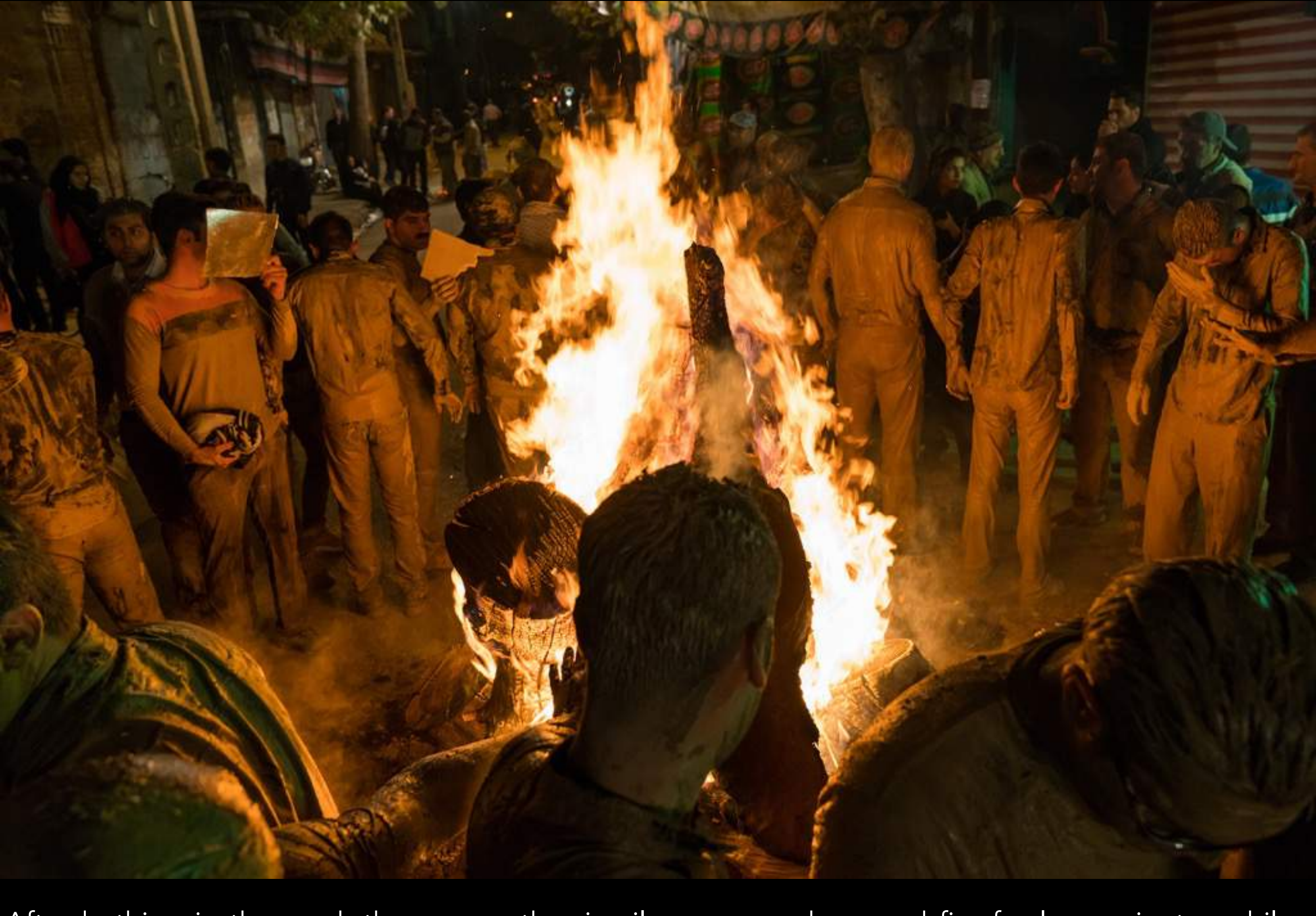
After bathing in the mud, the men gather in silence around a wood fire for long minutes while they dry.