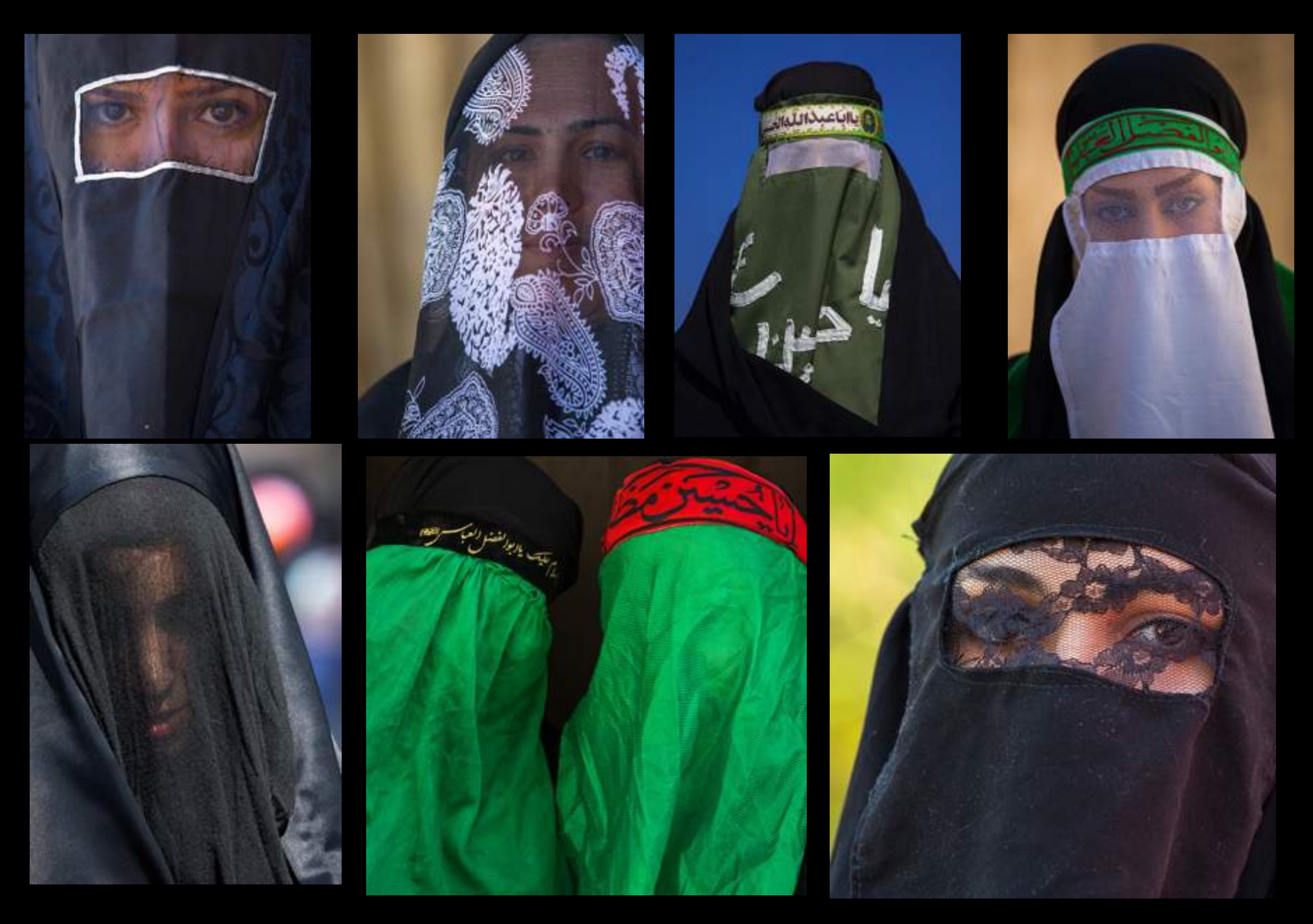
The veil hiding the face can be more or less opaque depending on the degree of intimacy that one wants to retain during the 40 Pulpits ceremony.