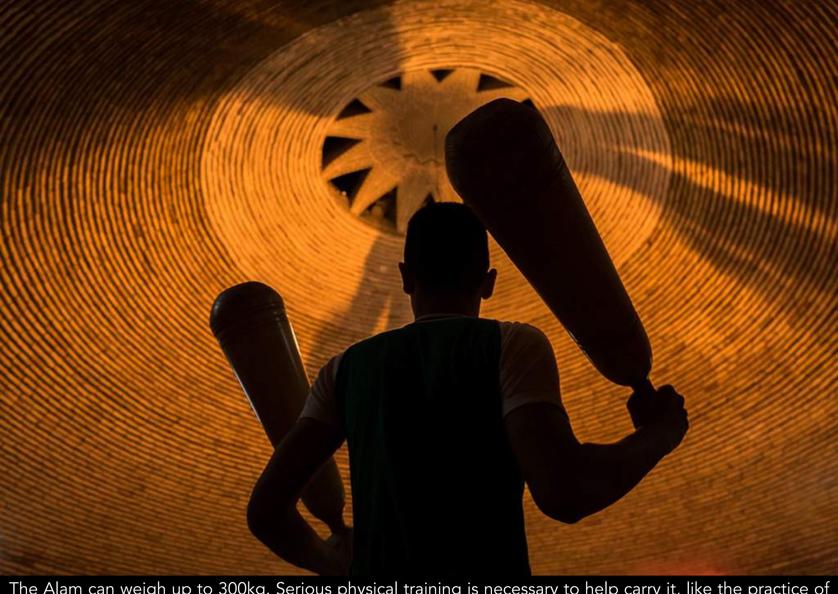
The Alam can weigh up to 300kg. Serious physical training is necessary to help carry it, like the practice of traditional Zurkhaneh and the yielding of clubs weighing 25kg each.