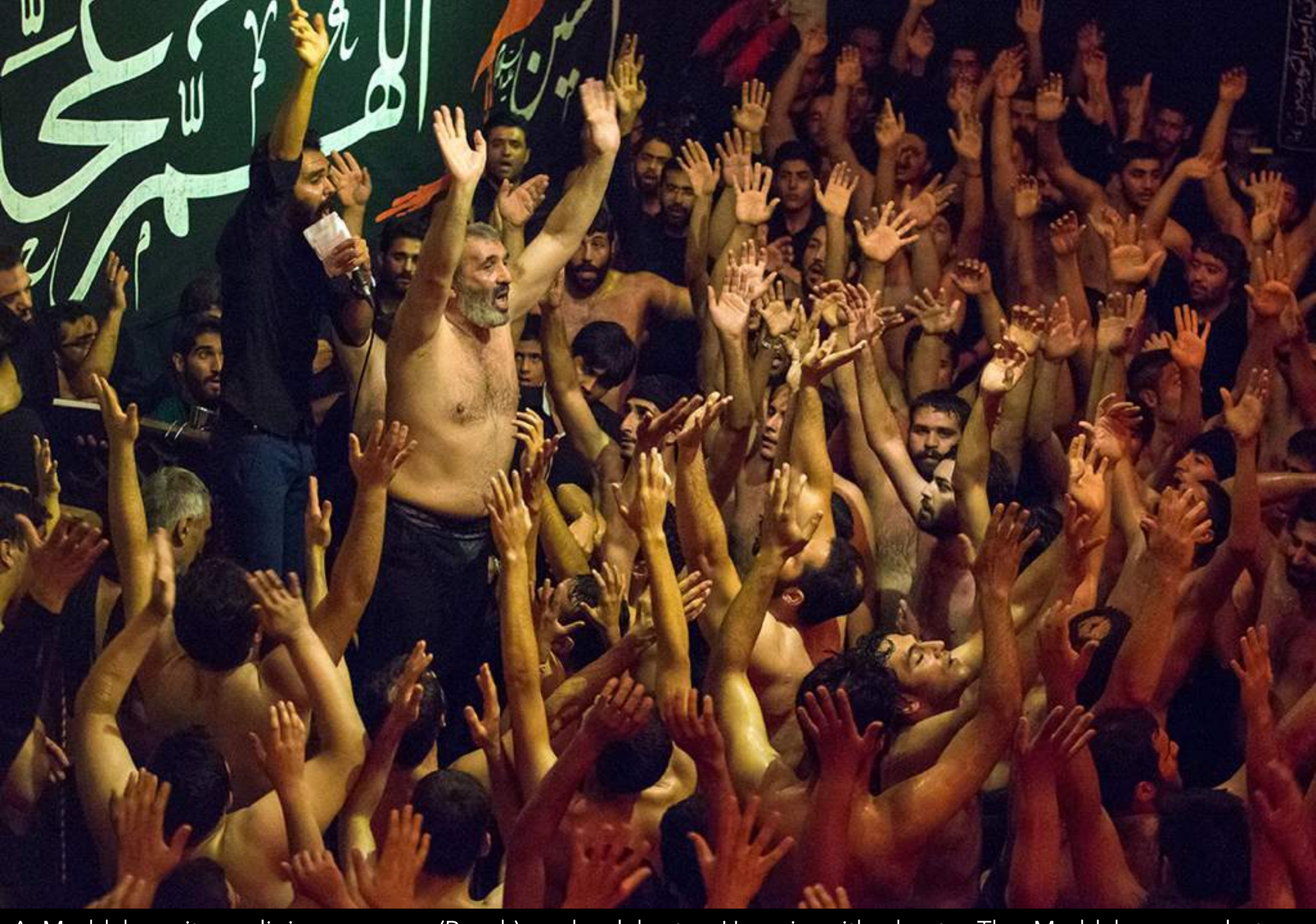
A Maddah recites religious poems (Rozeh) and celebrates Hussein with chants. The Maddah are real stars, wealthy, selling CDs, caught in scandals... Real rock stars with incredible smooth voices.