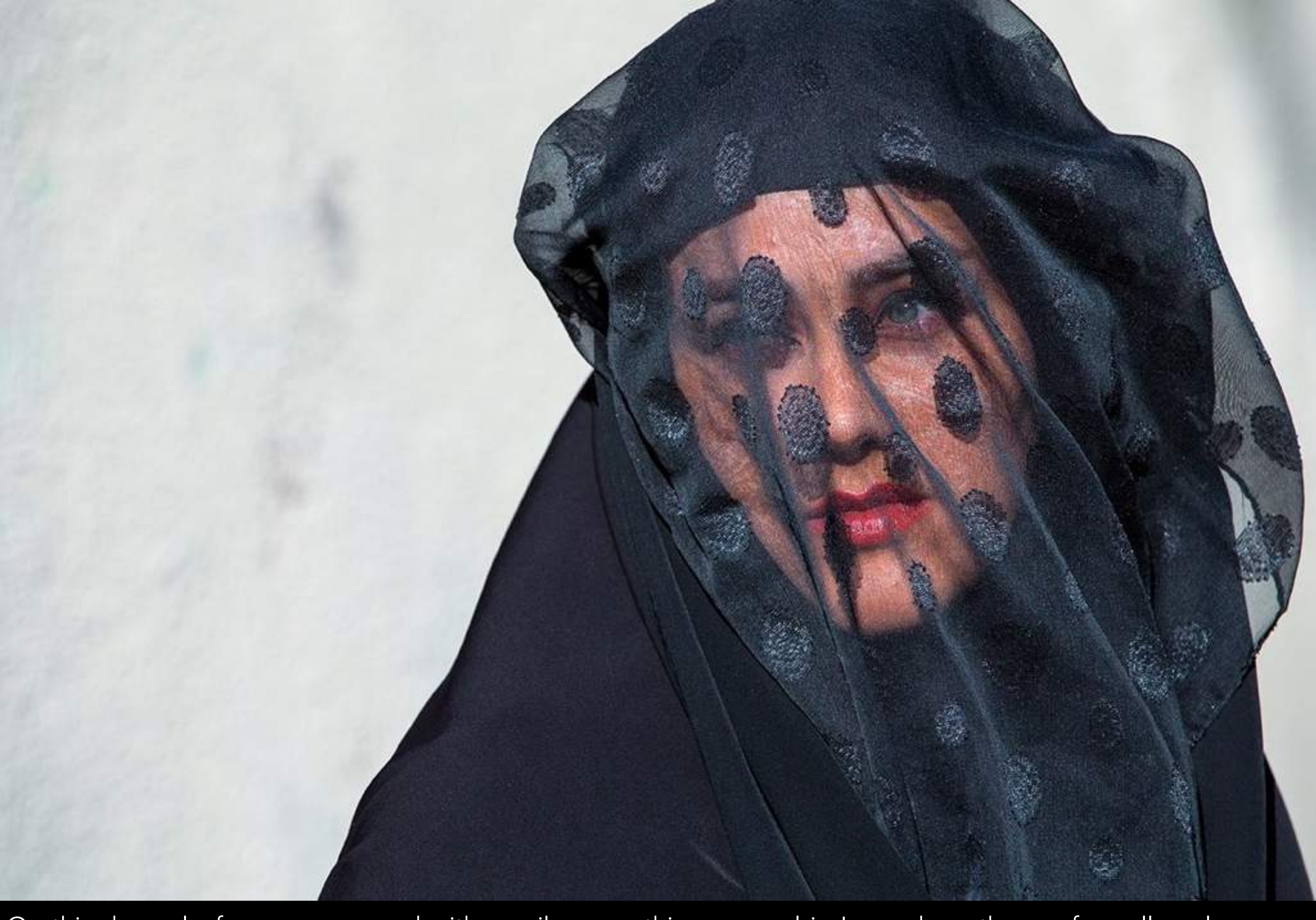
On this day only, faces are covered with a veil – something unusual in Iran, where the scarf usually only covers women's hair. People hide their faces not to be recognized.