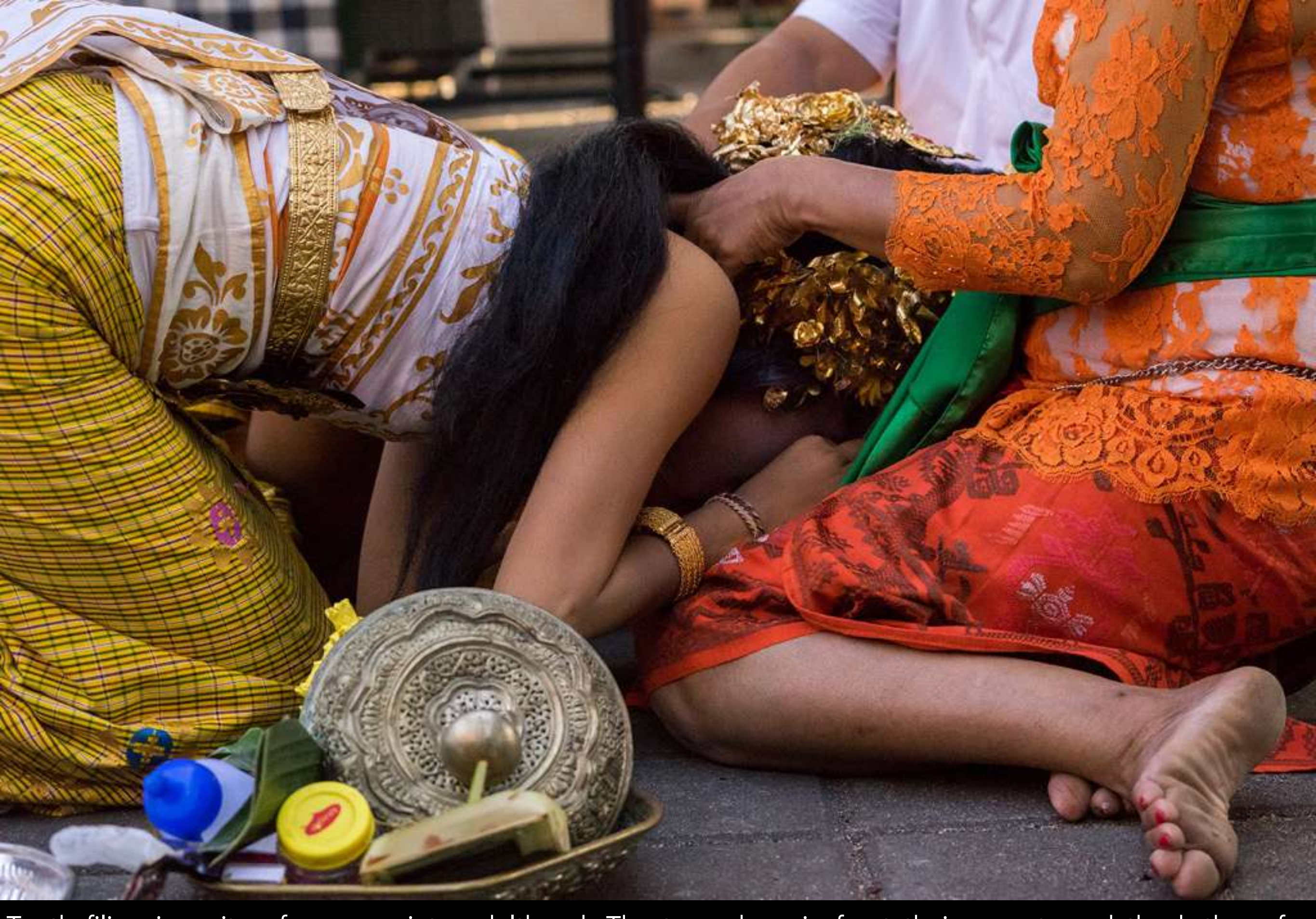
Tooth filing is a rite of passage into adulthood. The teens bow in front their parents and thank them for everything they have done since birth. An emotional scene.