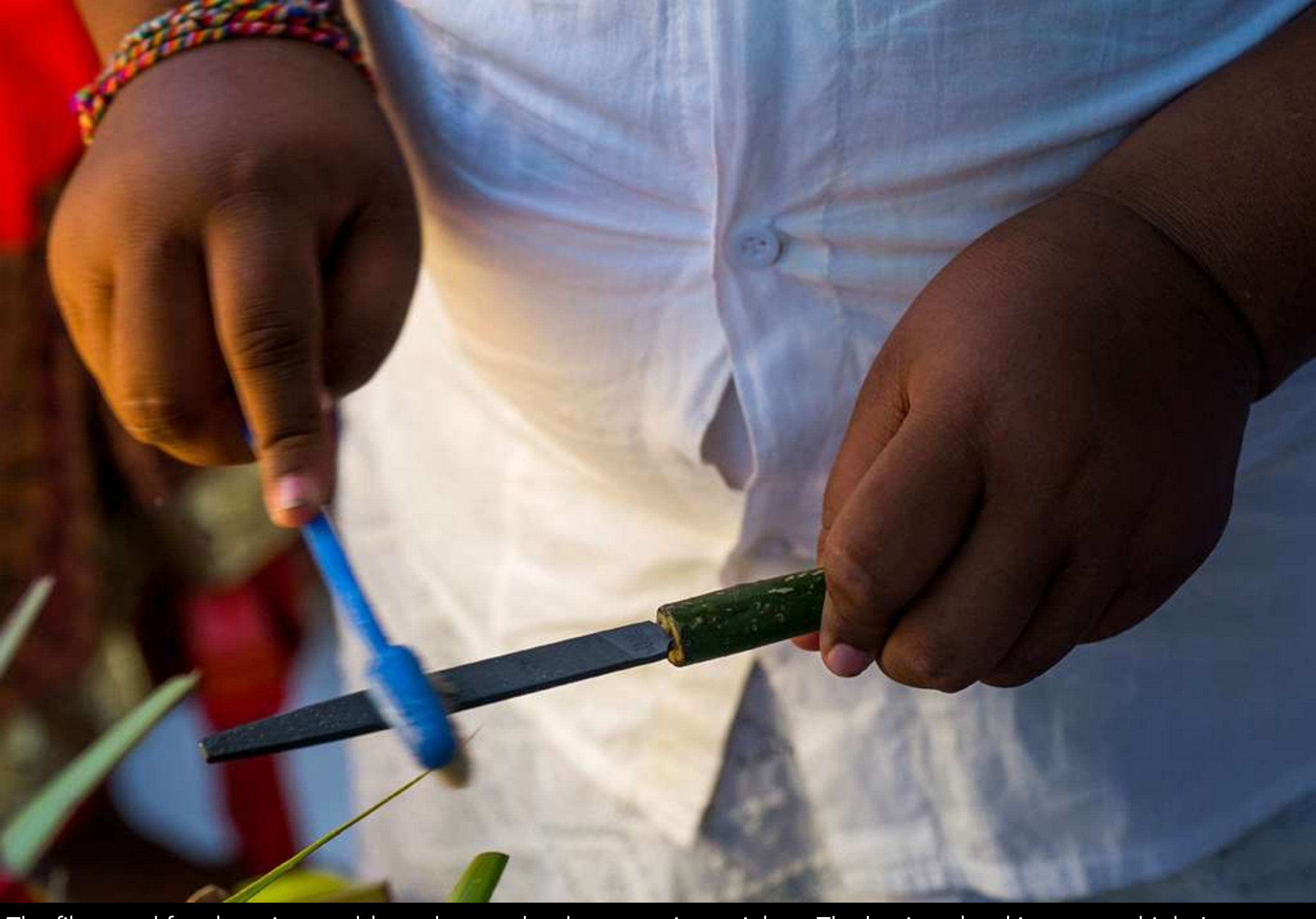
The files used for cleansing are blessed to render the operation painless. The hygiene level is not very high. In between two filings, the priest cleans the tools always with the same toothbrush.