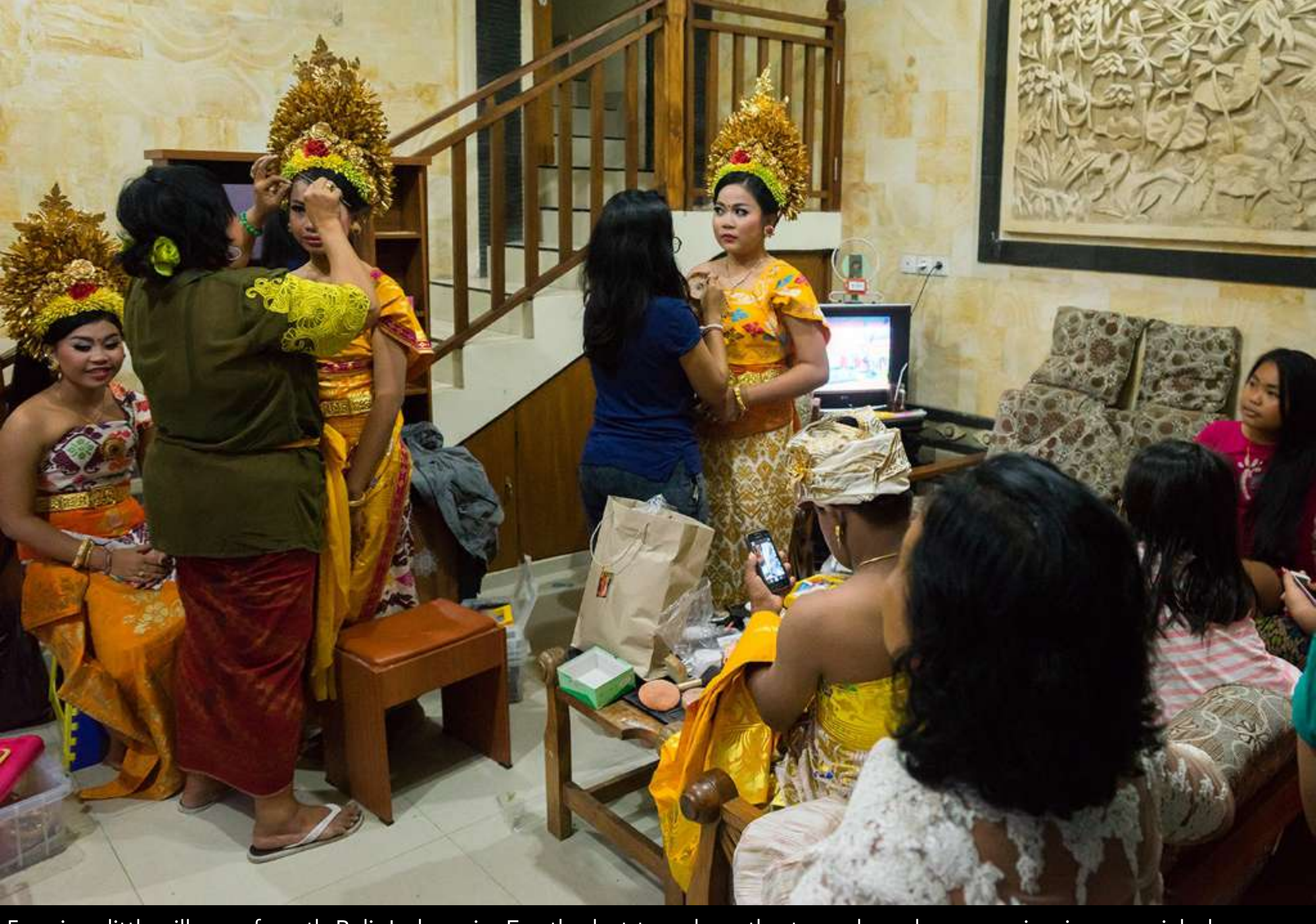
5am in a little village of south Bali, Indonesia. For the last two days, the teens have been praying in a special place, now they are ready for the tooth filing ceremony. The whole village gather together for the ceremony to reduce the high costs.