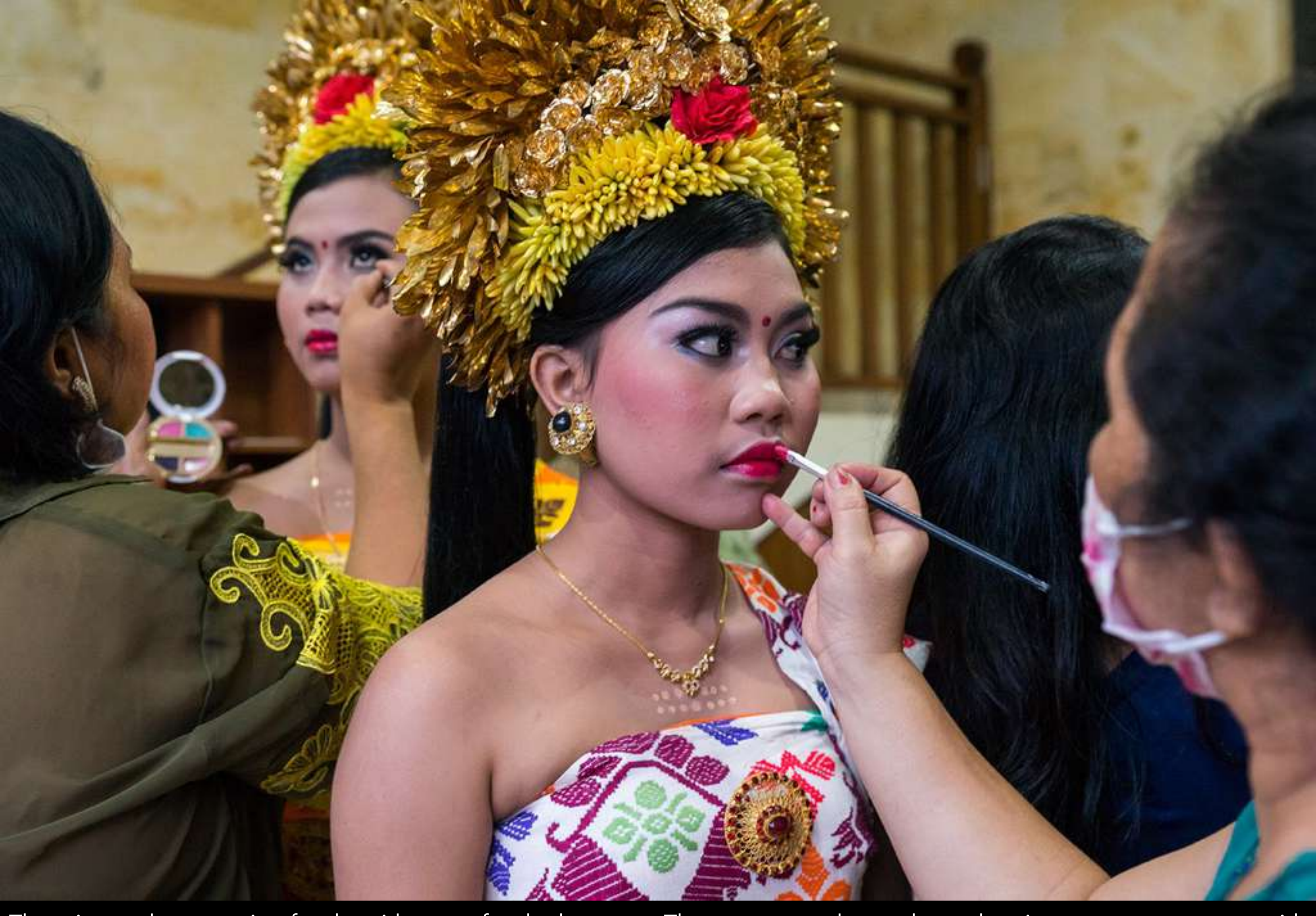
There is a makeup session for the girls, even for the boys too. The young people are dressed up in gorgeous costumes with fancy headdresses that are rented for the celebration. The atmosphere feels more like a movie set than a religious scene.