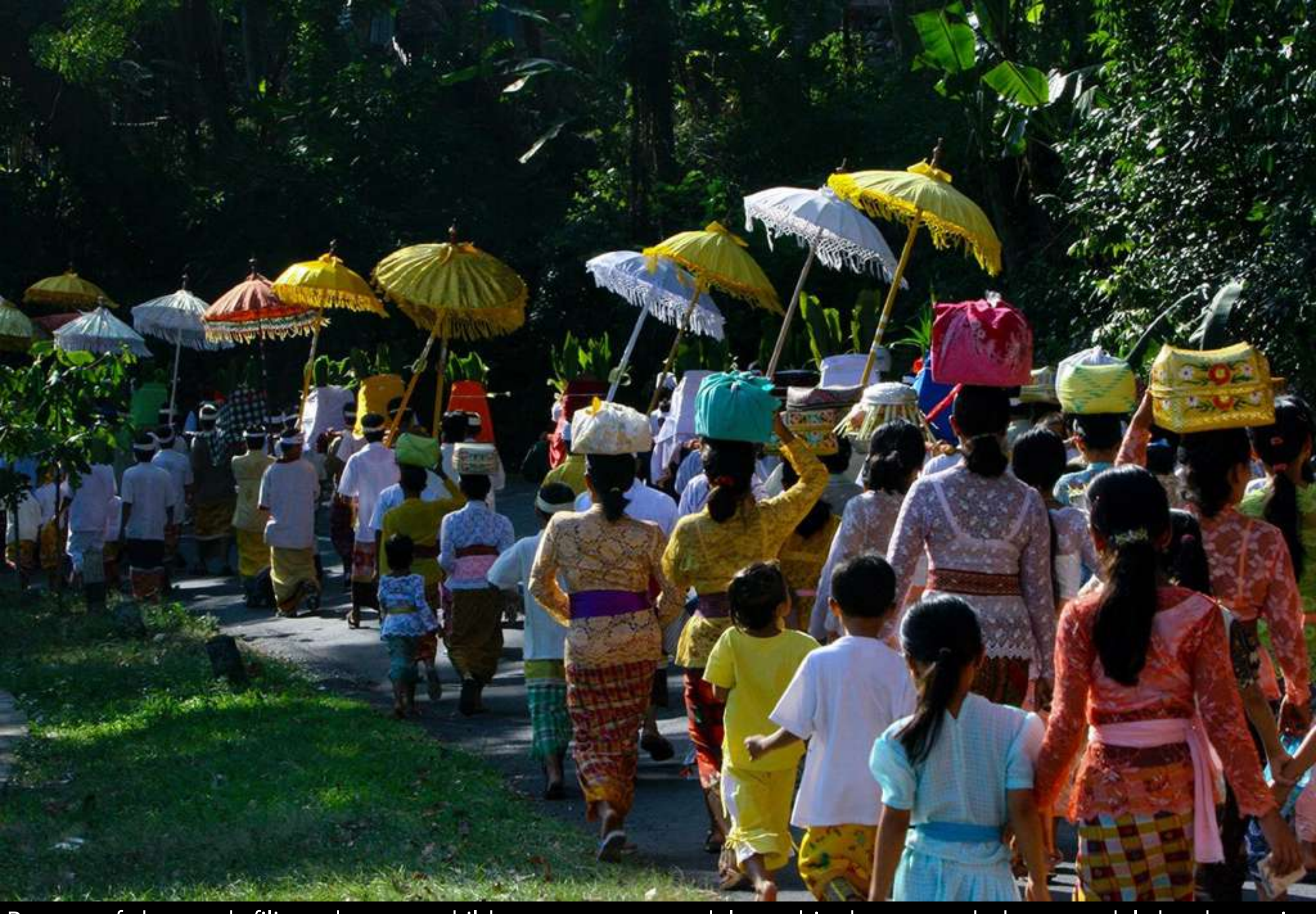
By way of the tooth filing, the once child emerges as an adult, and is then regarded as an adult by the entire village. He/she is now ready for marriage. The ceremony will keep on with praying in the temples.