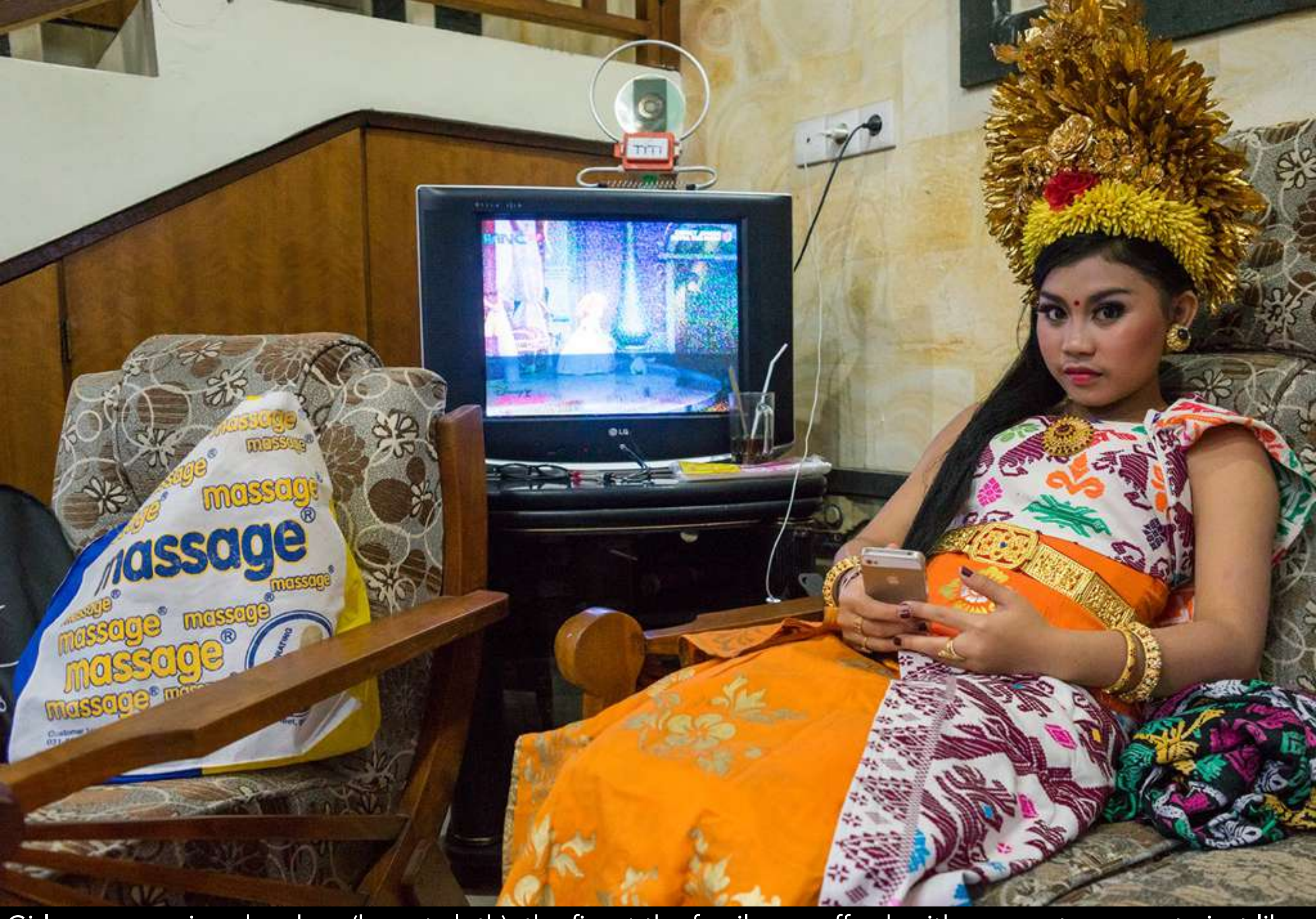
Girls wear precious kemben (breast cloth), the finest the family can afford, with garments as ornate just like those of legong dancers.