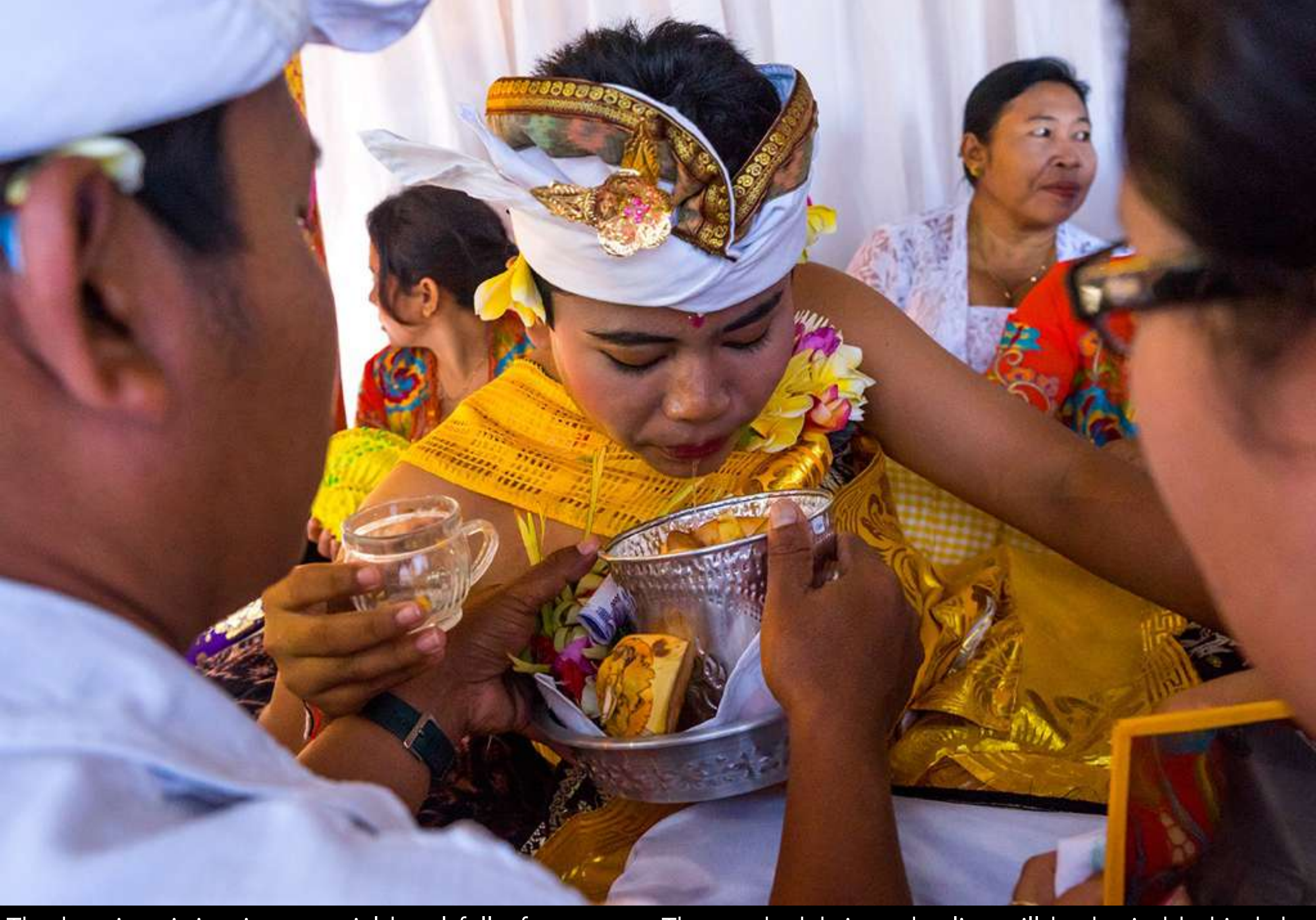
The boy is spitting in a special bowl full of coconuts. The teeth debris and saliva will be buried behind the ancestral shrine to keep the evil spirits away.