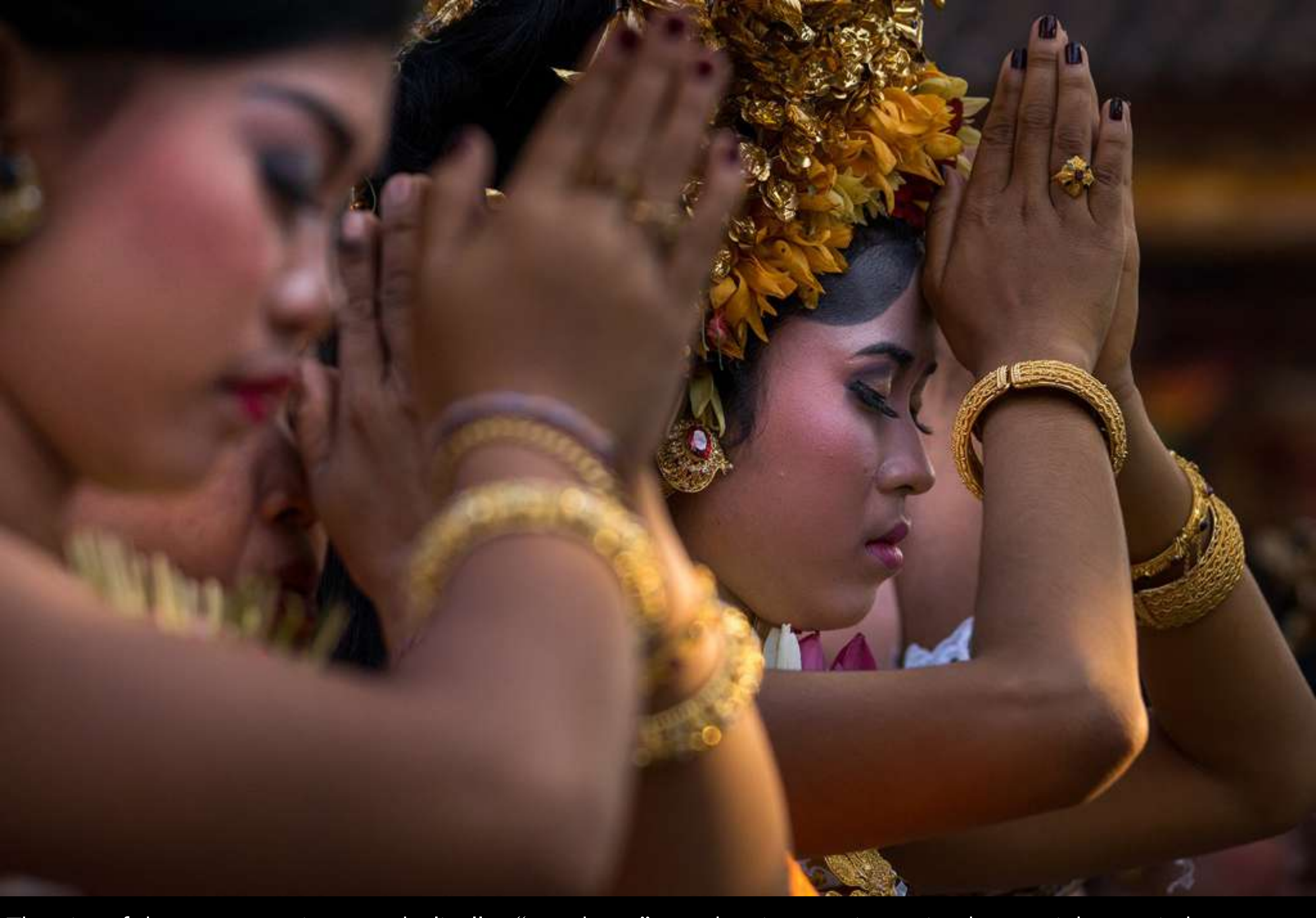
The aim of the ceremony is to symbolically "cut down" on the six negative traits that are inherent in humans (like the 7 sins in Christianity): lust, greed, wrath, pride, jealousy, and intoxication.