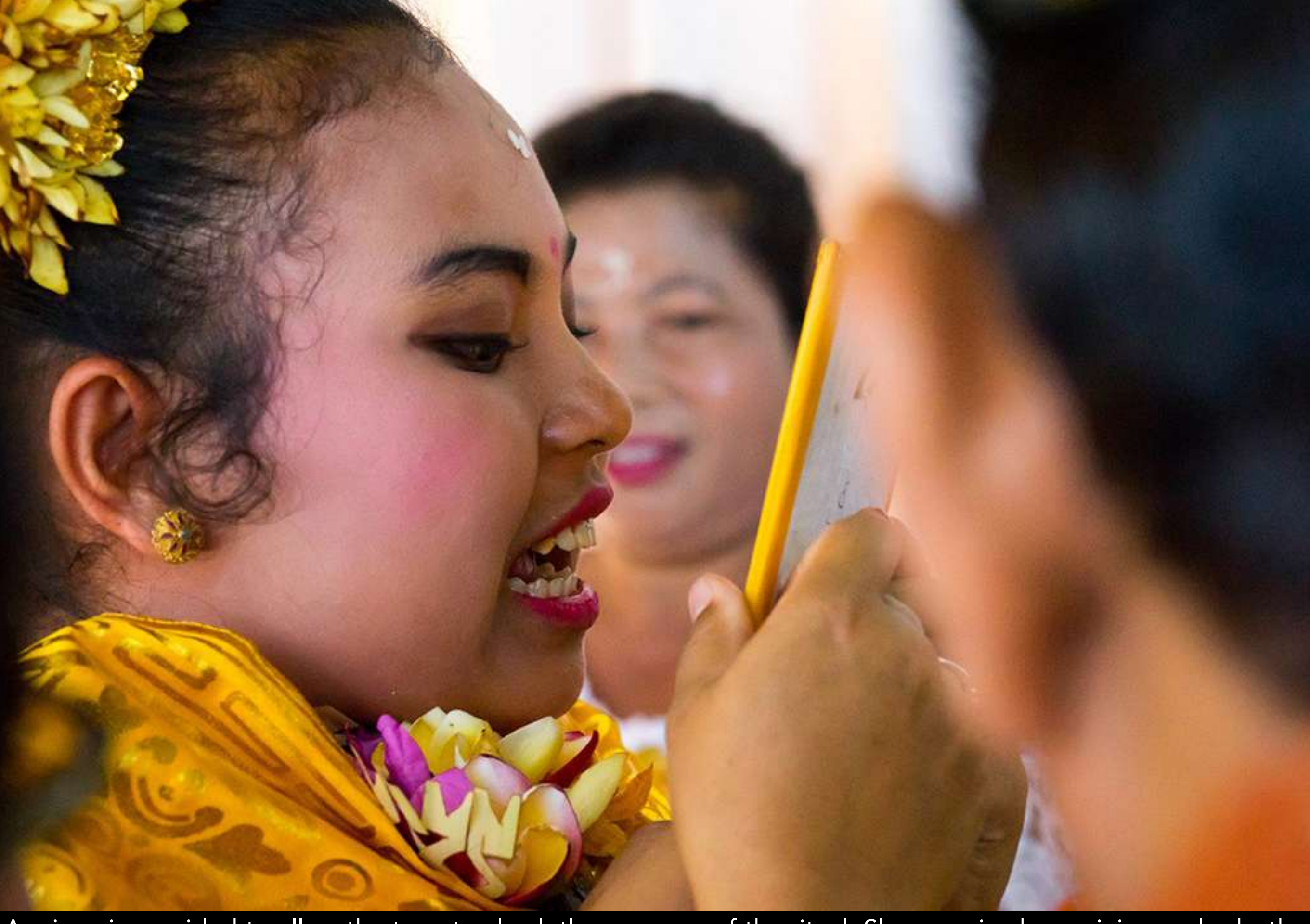
A mirror is provided to allow the teen to check the progress of the ritual. She can give her opinion and asks the priest to keep on filing as there is also an important aesthetic work that must be done.