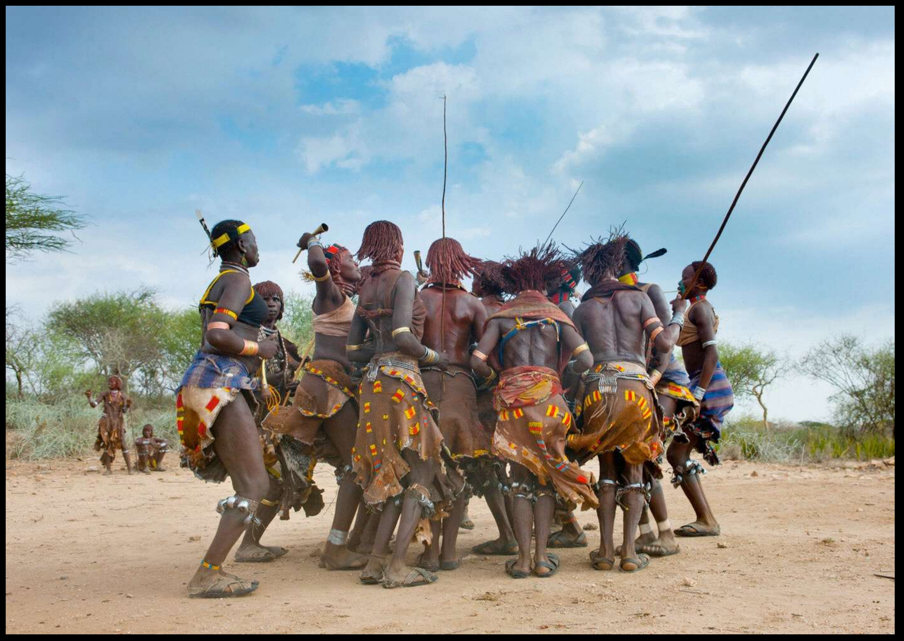
The jumper's female relatives, covered in animal skins, butter, and ocher, danse in a circle while blowing into horns.