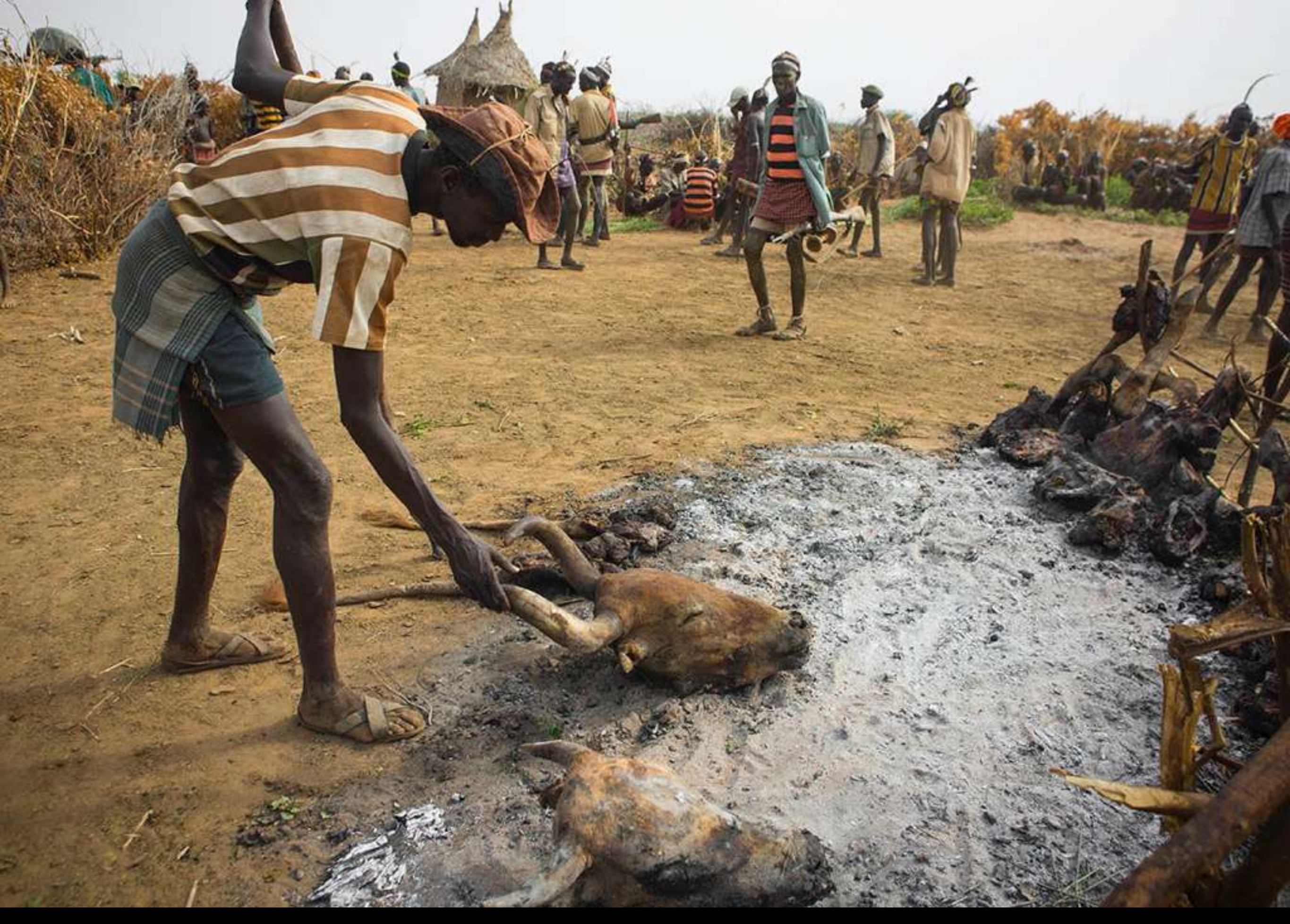
They start to kill some cows for a giant BBQ, complete with dances and chanting.