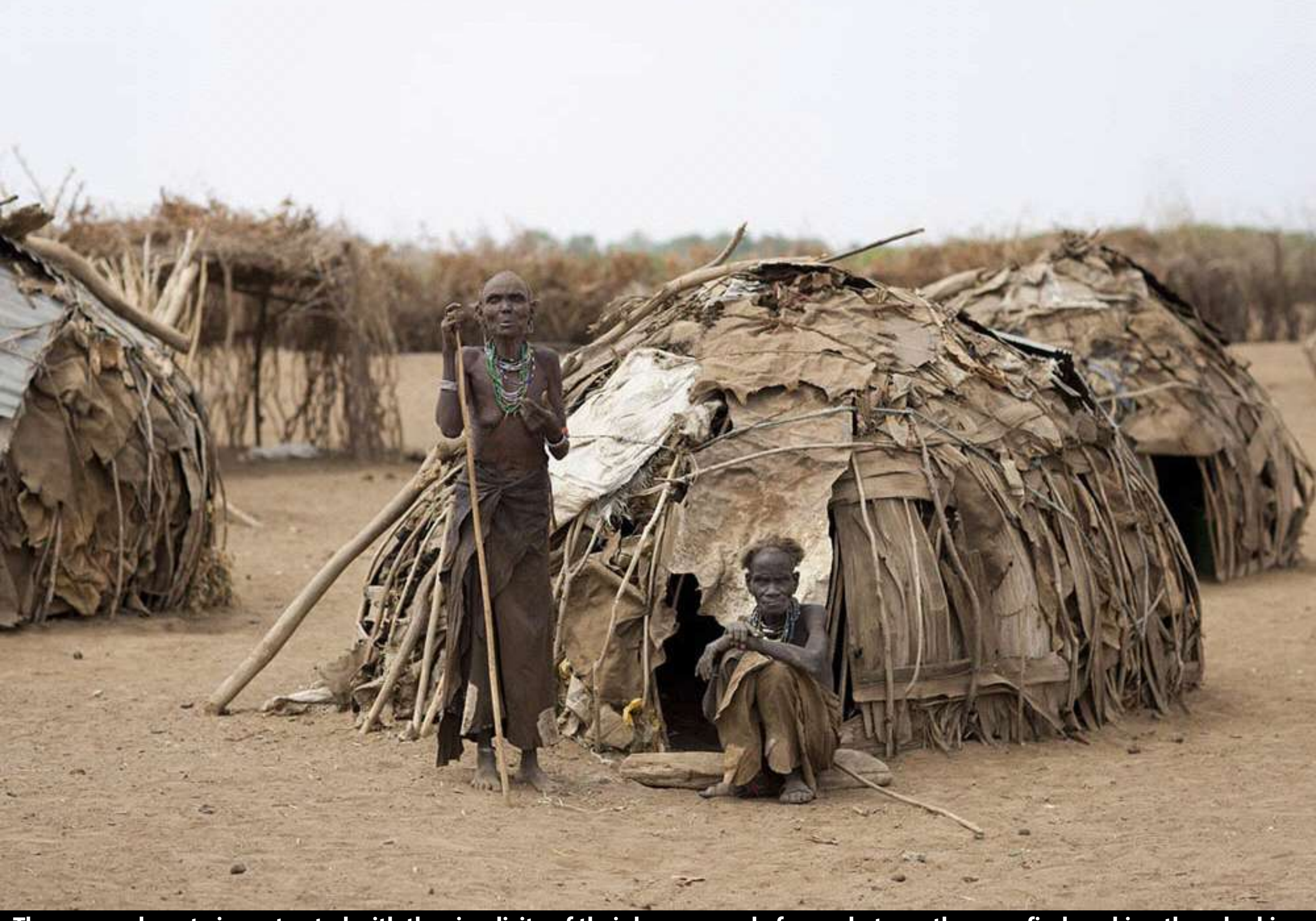
The women beauty is contrasted with the simplicity of their houses made from whatever they can find, making them looking like homeless people...