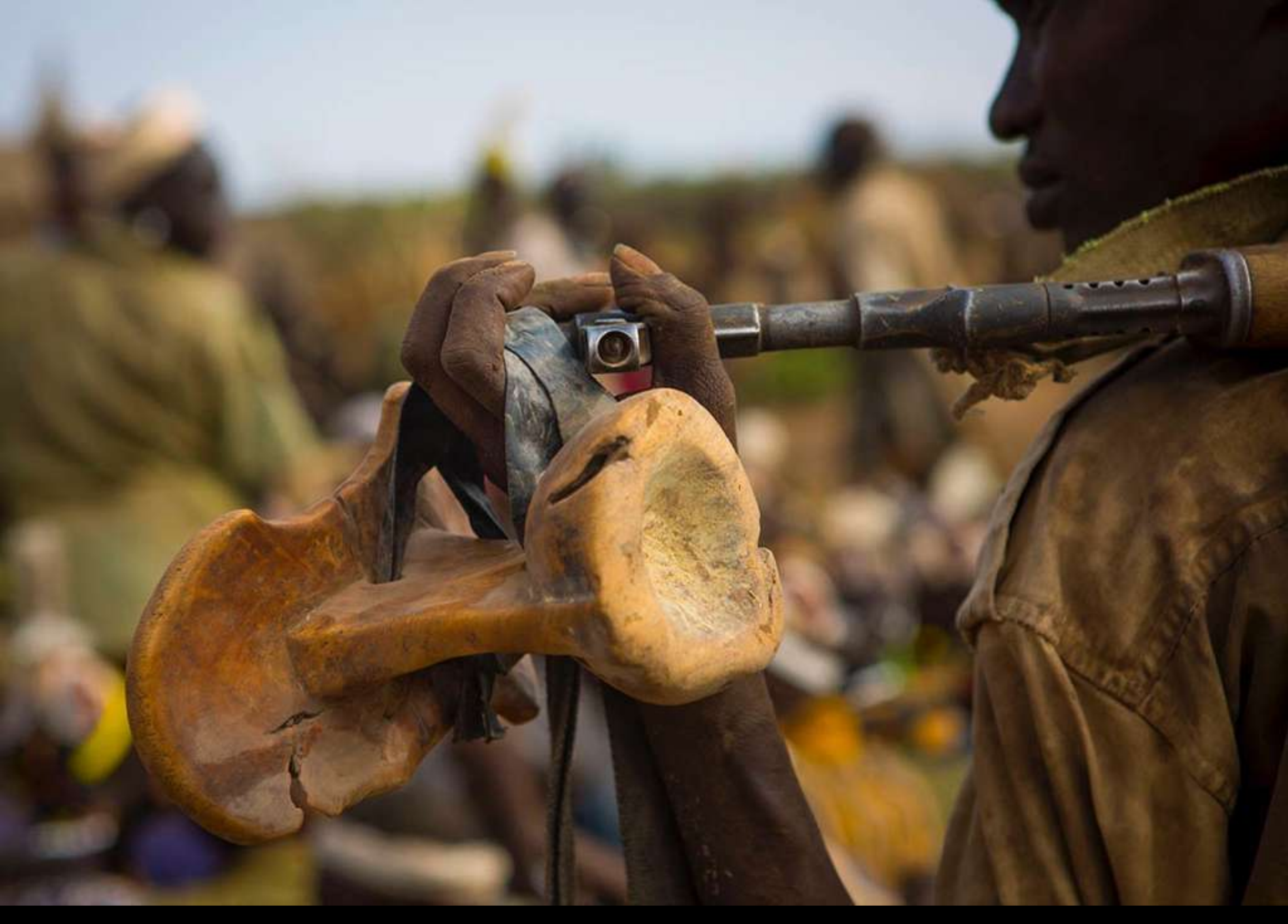
Every man has a gun and a wooden pillow, the two things they never leave home without!