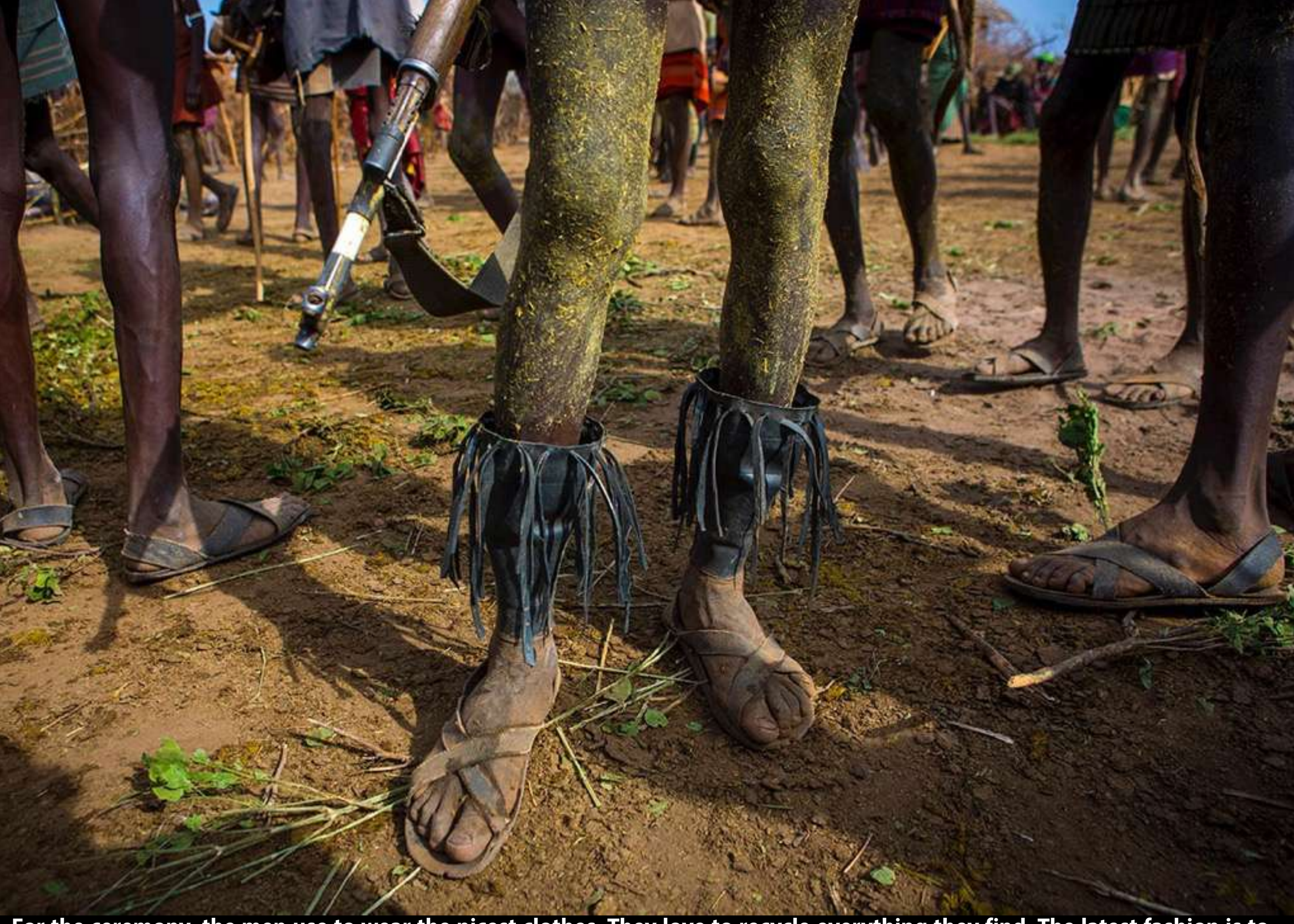
For the ceremony, the men use to wear the nicest clothes. They love to recycle everything they find. The latest fashion is to use half plastic shoes to make this decoration.