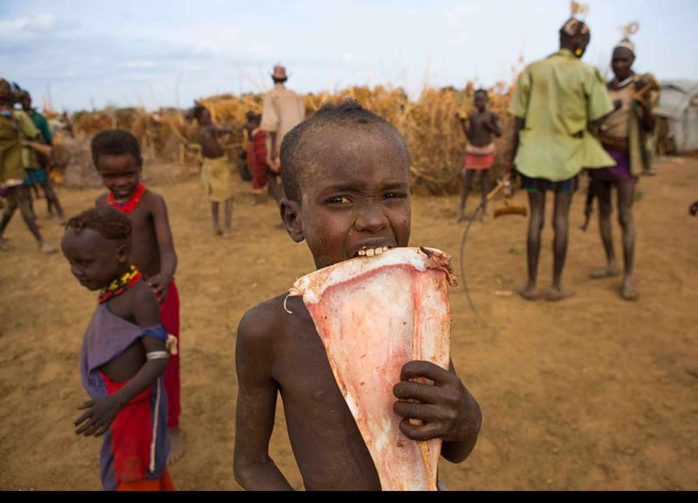
The kids fight to find a good piece of meat, but most of them are just left with the bones.