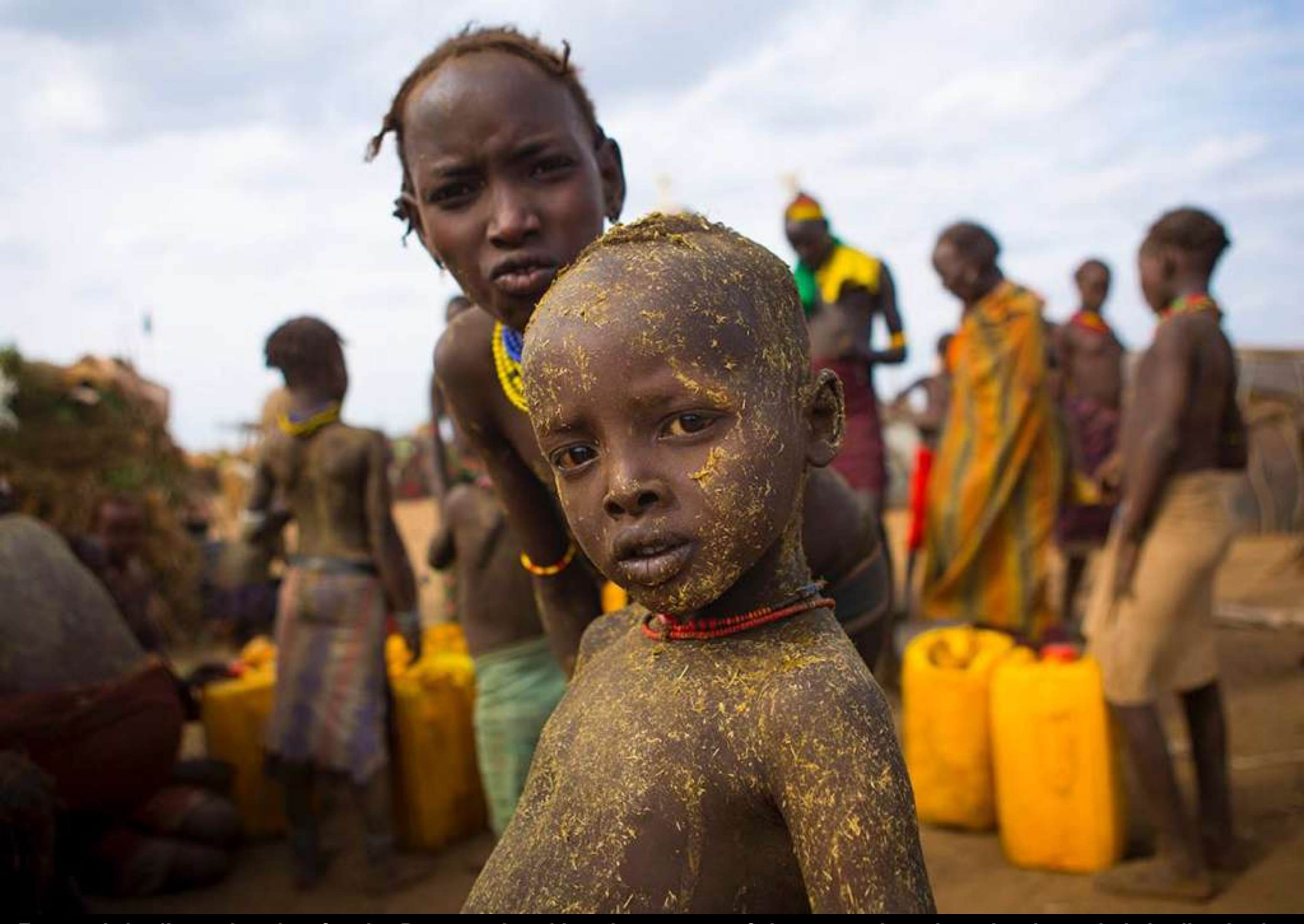
For us, it is disgusting, but for the Dassanech, taking the content of the stomach and putting it on their bodies is the highest tribute to these animals that they venerate.