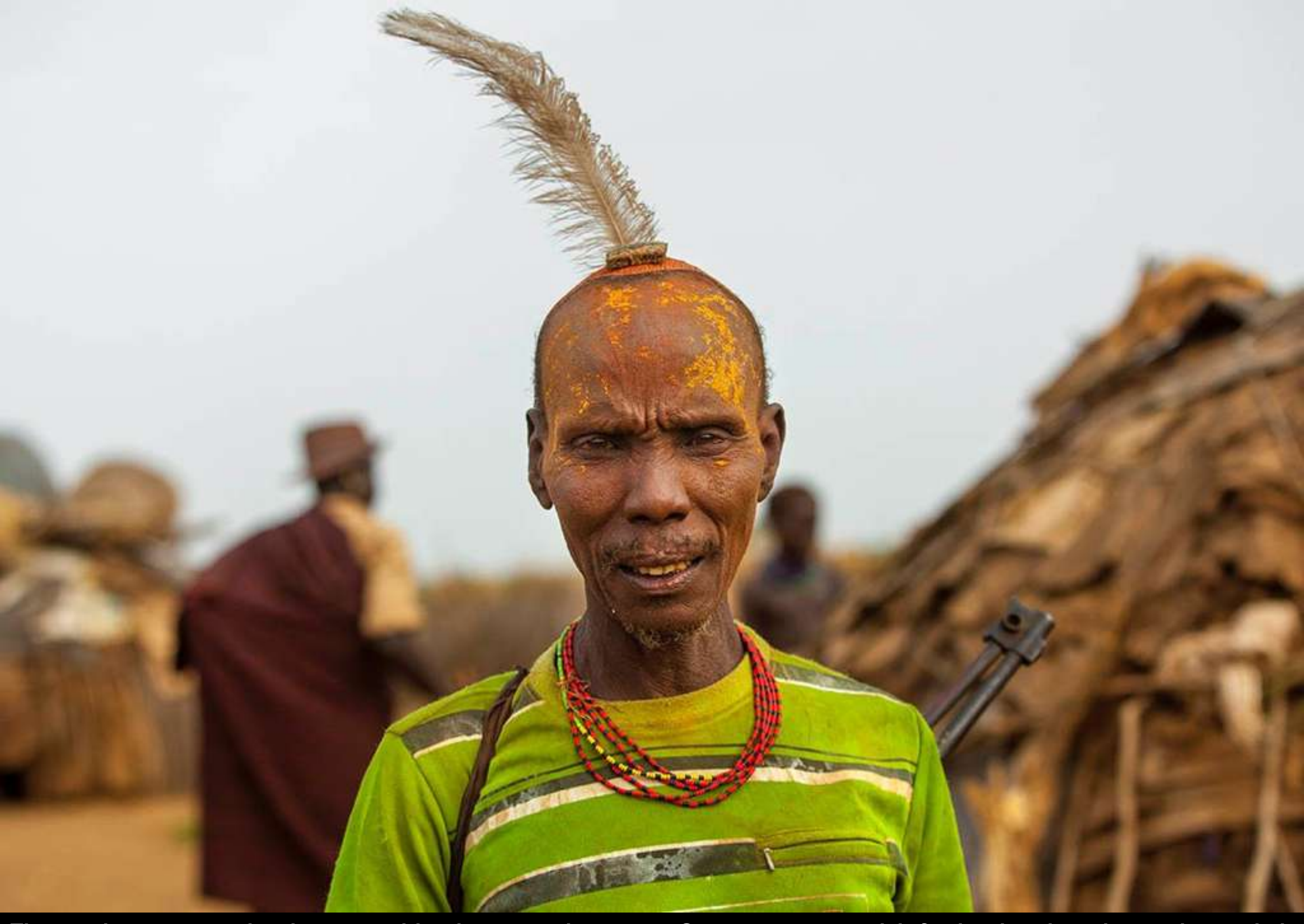
The warriors are proud to be covered by the stomach content. Some wear an ostrich feather in a bun they make on their head. It has a special meaning: they have killed a wild animal or a man. There are few animals left in the area...