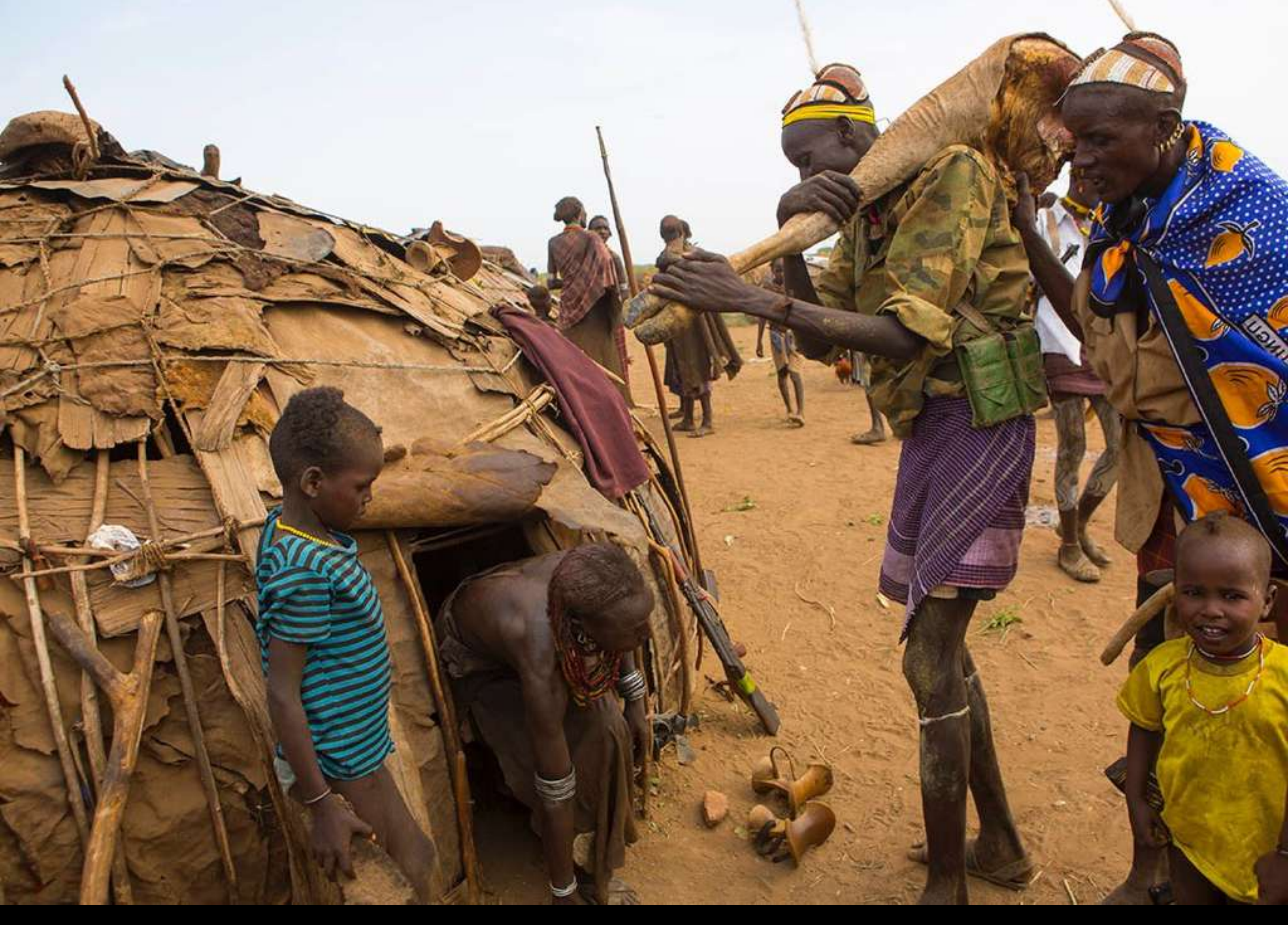
Everybody returns home, the chief of the village goes back in his hut with a cow leg he'll keep inside!