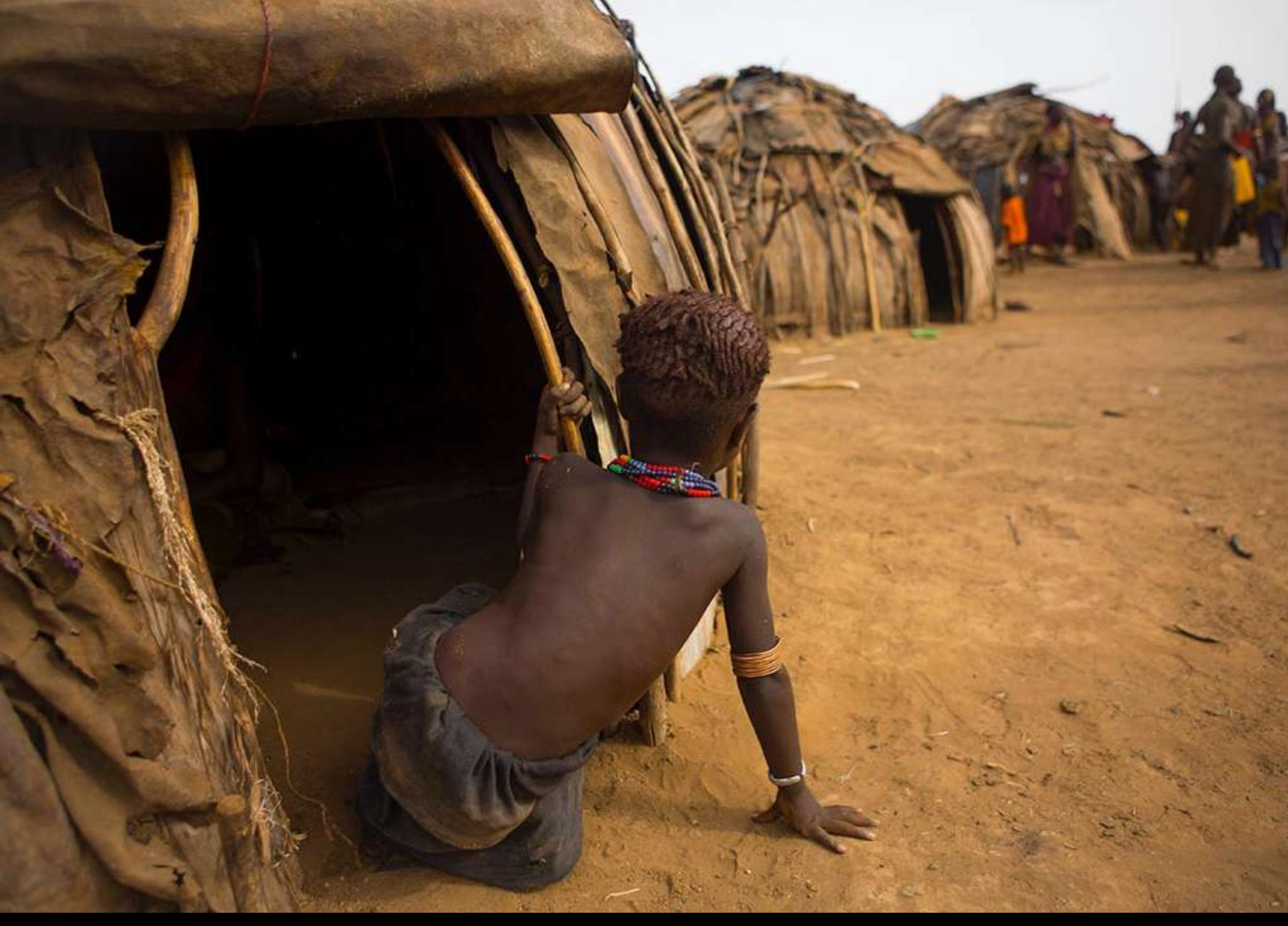
Some kids try to hide in the huts to avoid the ritual!