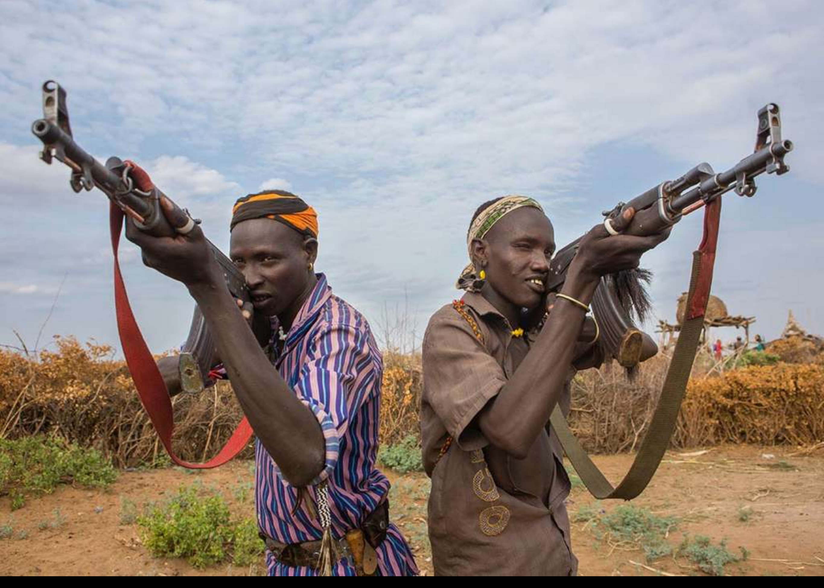
The ceremony starts with dances and gun shots... Real ones!