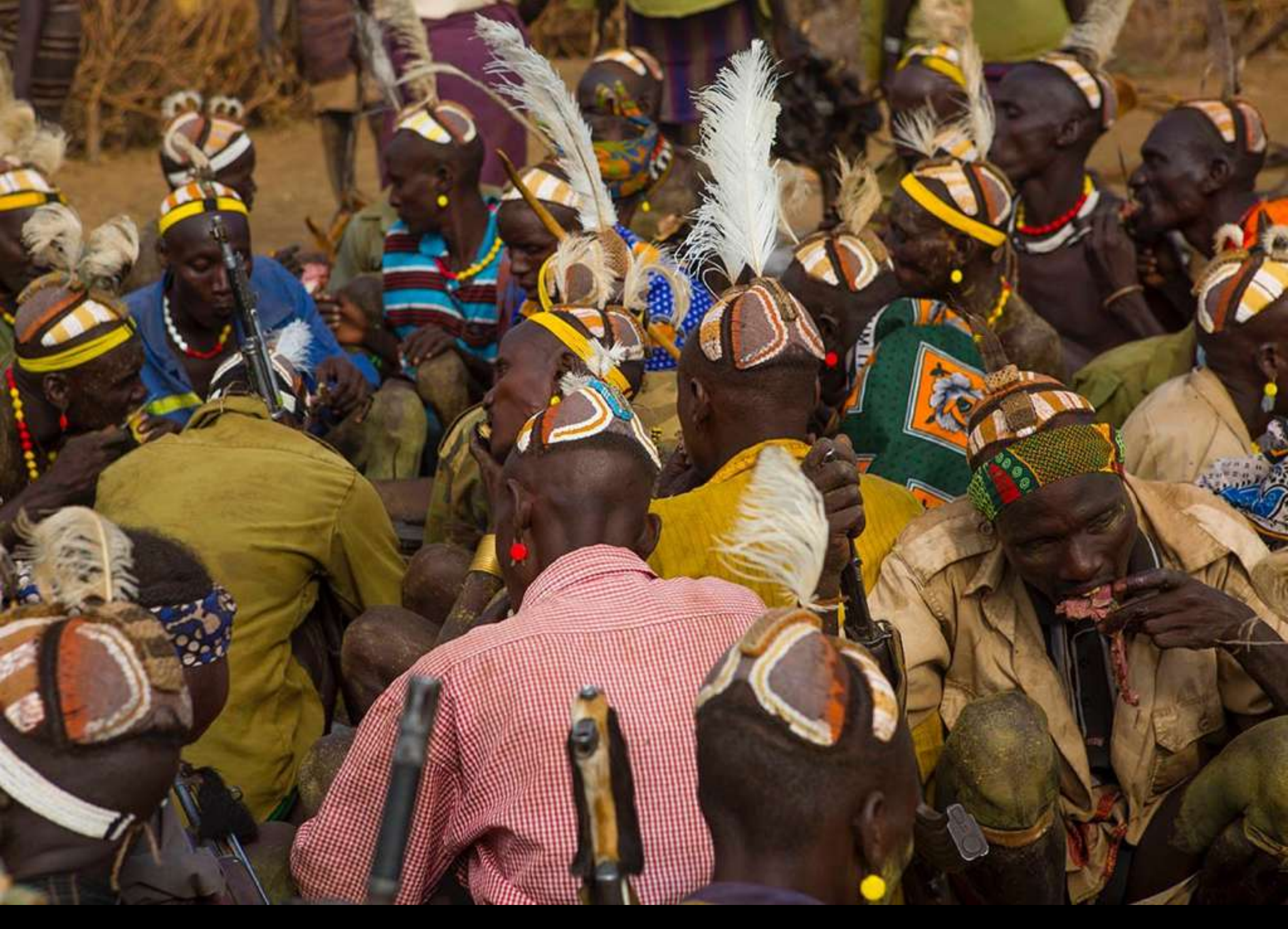
The best BBQ meat is offered to the chiefs and the warriors. Without setting down their Kalashnikovs, everybody eats.