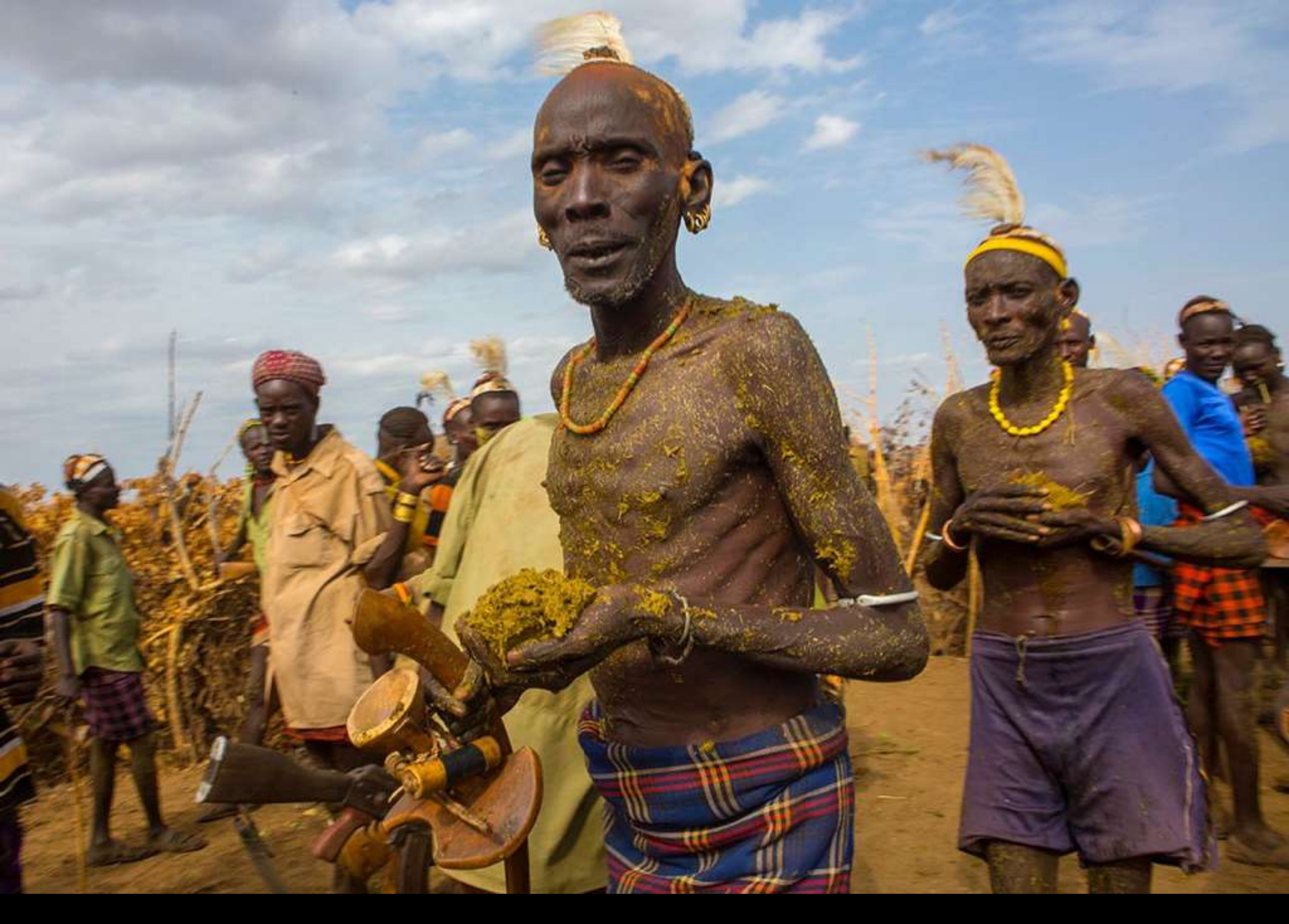
Some men bring dungs to offer them to friends.