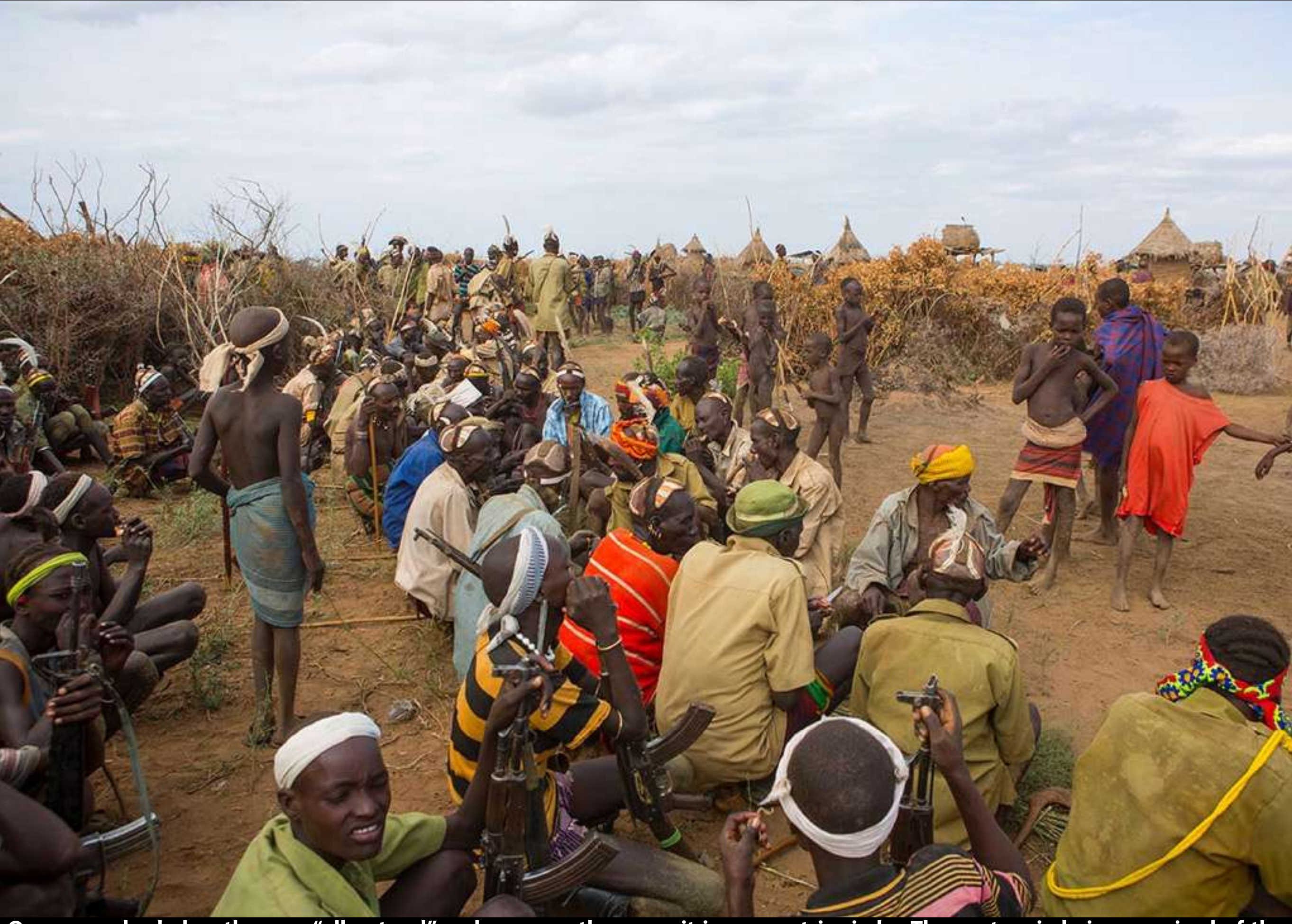
Once everybody has the new "all natural" make up on, the men sit in concentric circles. The center circle is comprised of the chiefs and the elders. The second, the young warriors, and around the periphery, wander the hungry children.