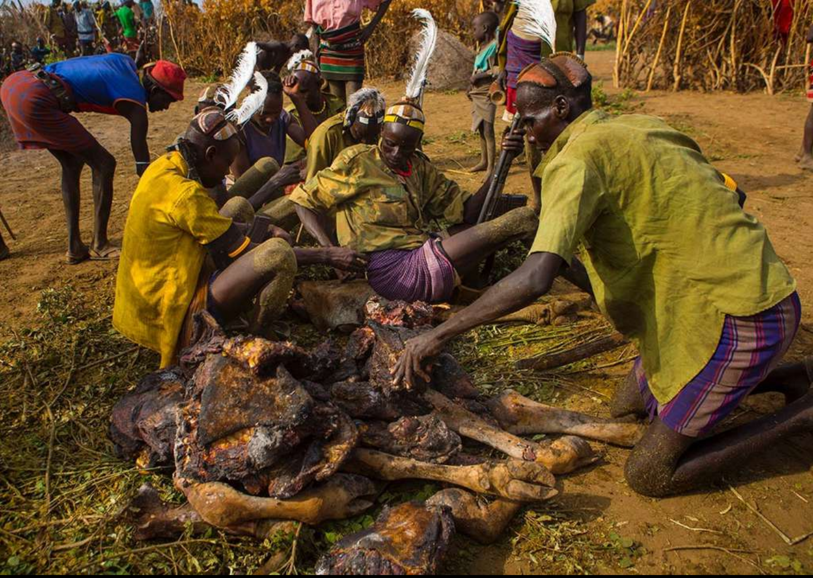
The best parts of the cows are kept in the middle of the camp and carefully monitored. Eating meat is a rare treat, since cows, being very expensive, are hardly ever slaughtered.