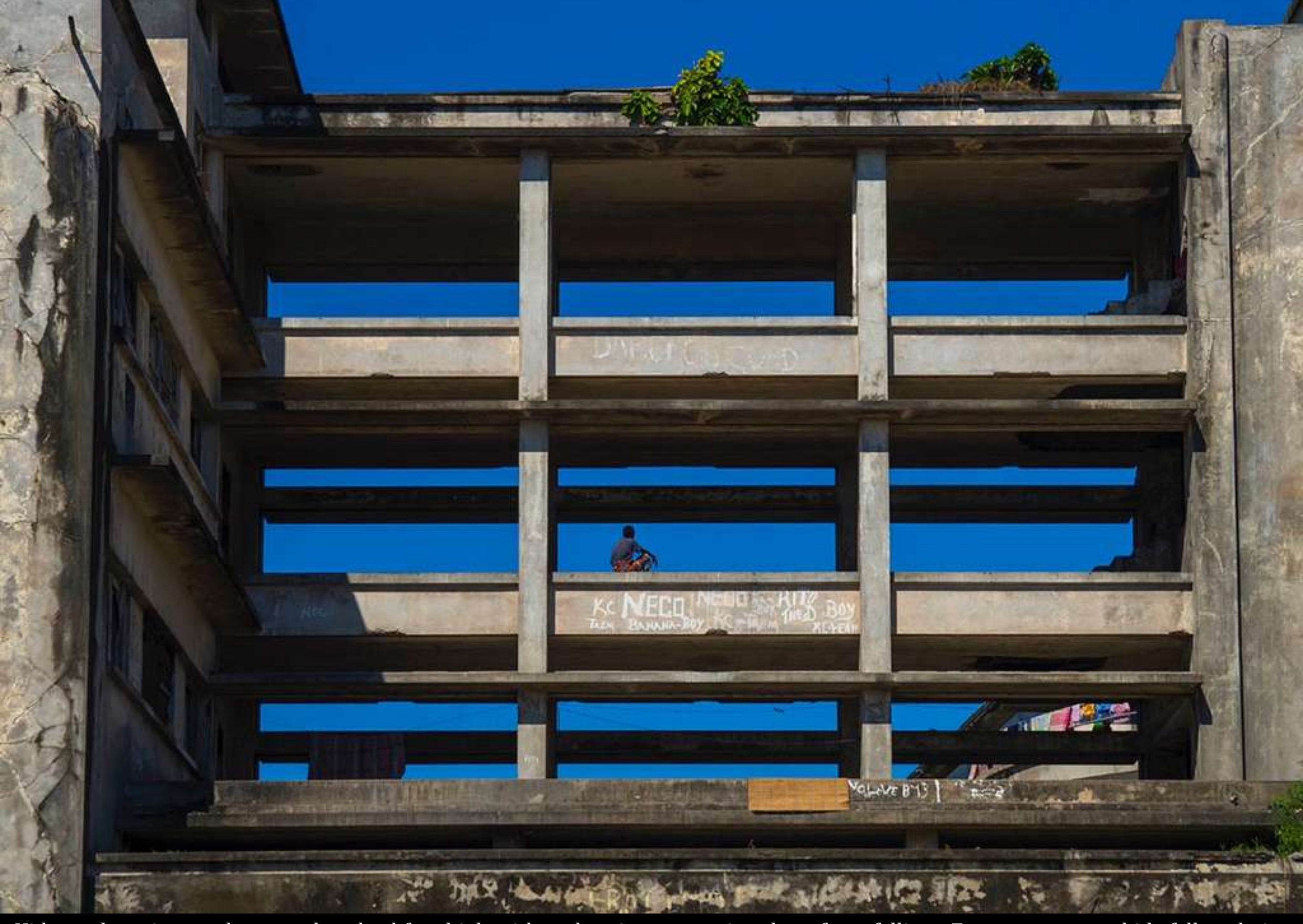
Kids are learning to play tag a hundred feet high with no barrier preventing them from falling. Every year, some kids fall to their deaths reported one mother...