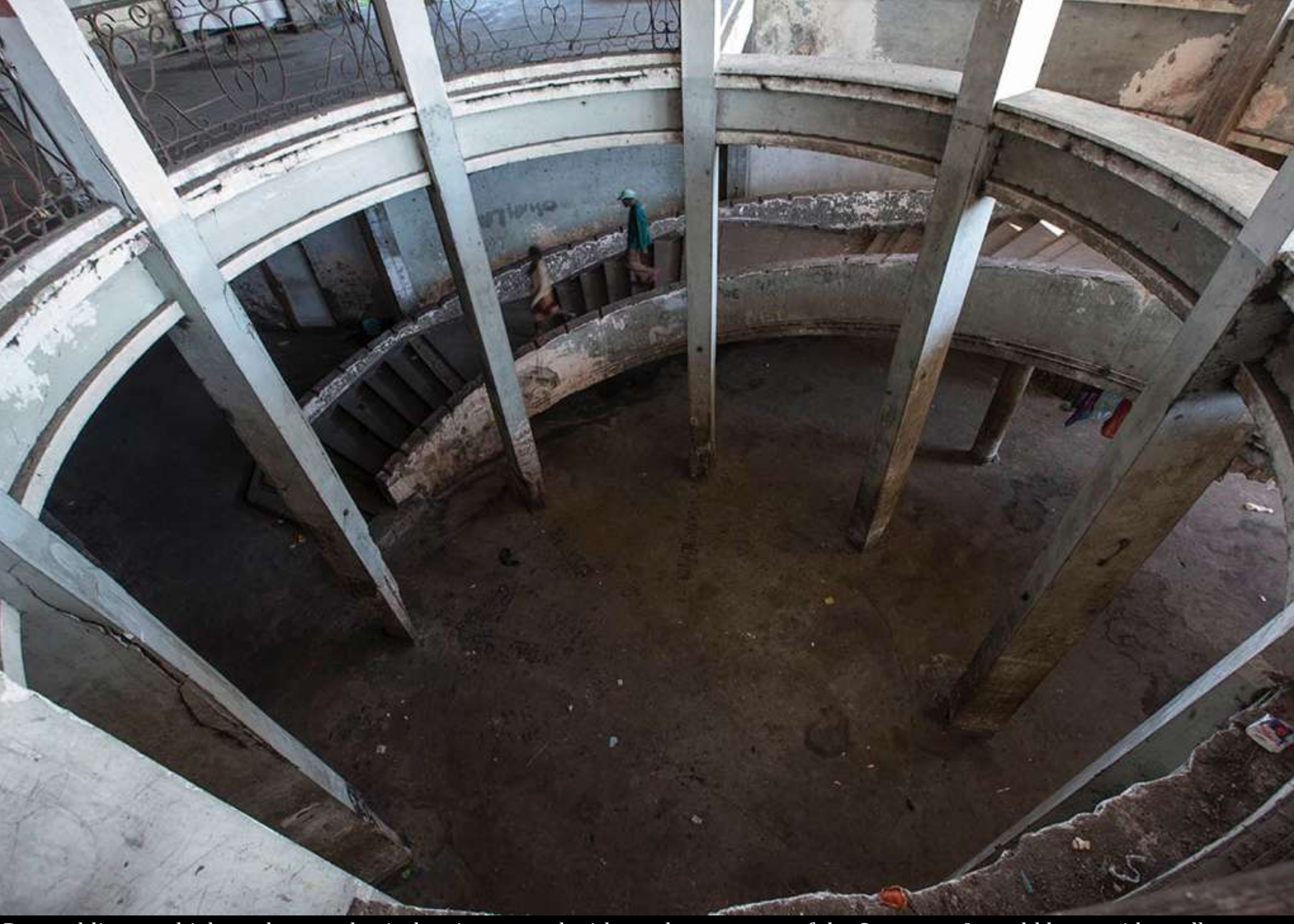
Drug addicts get high on the grand spiral staircase, and without the presence of the Secretary, I would have said goodbye to my cameras....