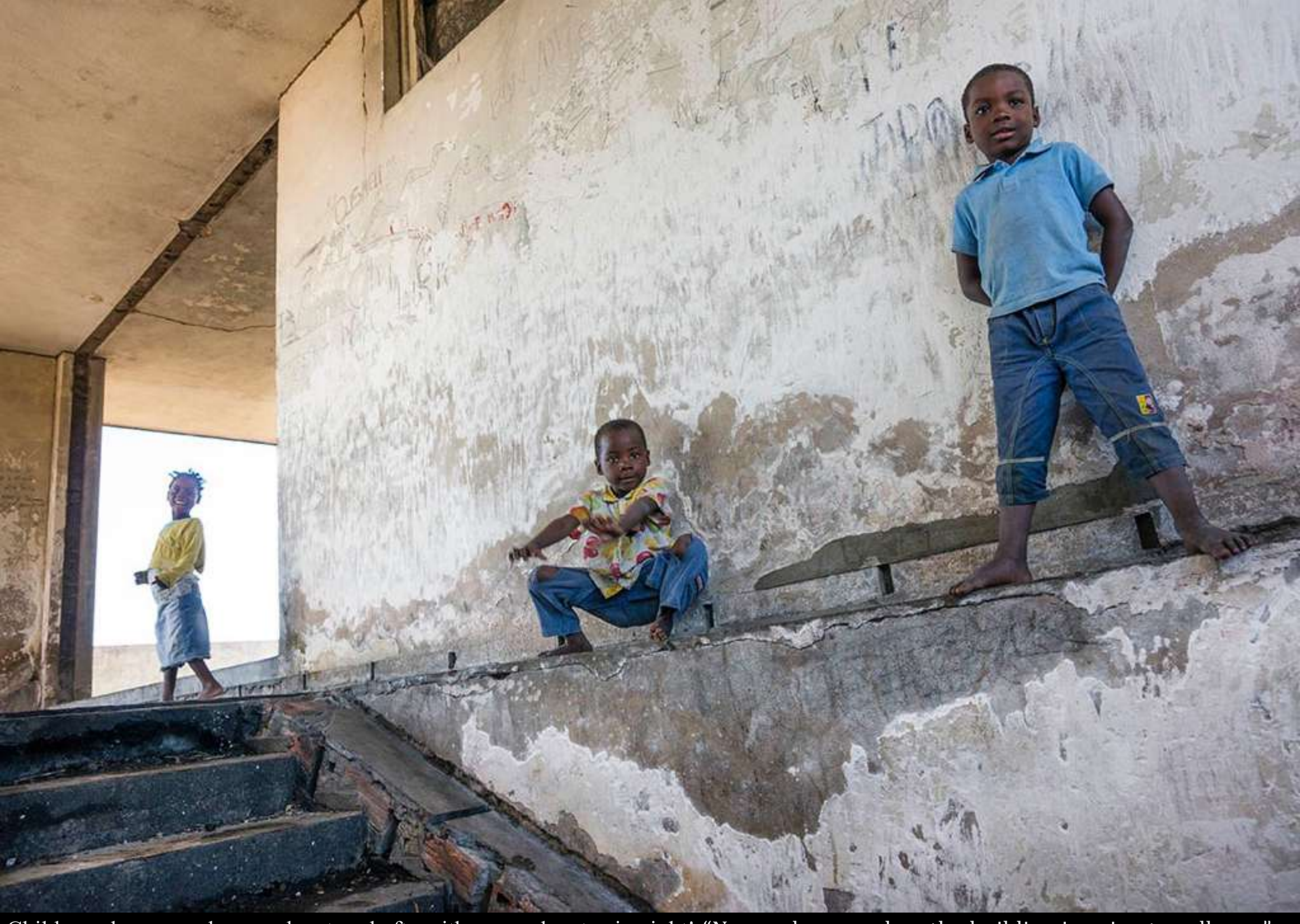
Children play around open elevator shafts with... no elevator in sight! "No one knows when the building is going to collapse," says one resident, "It's going to collapse on top of our poverty".