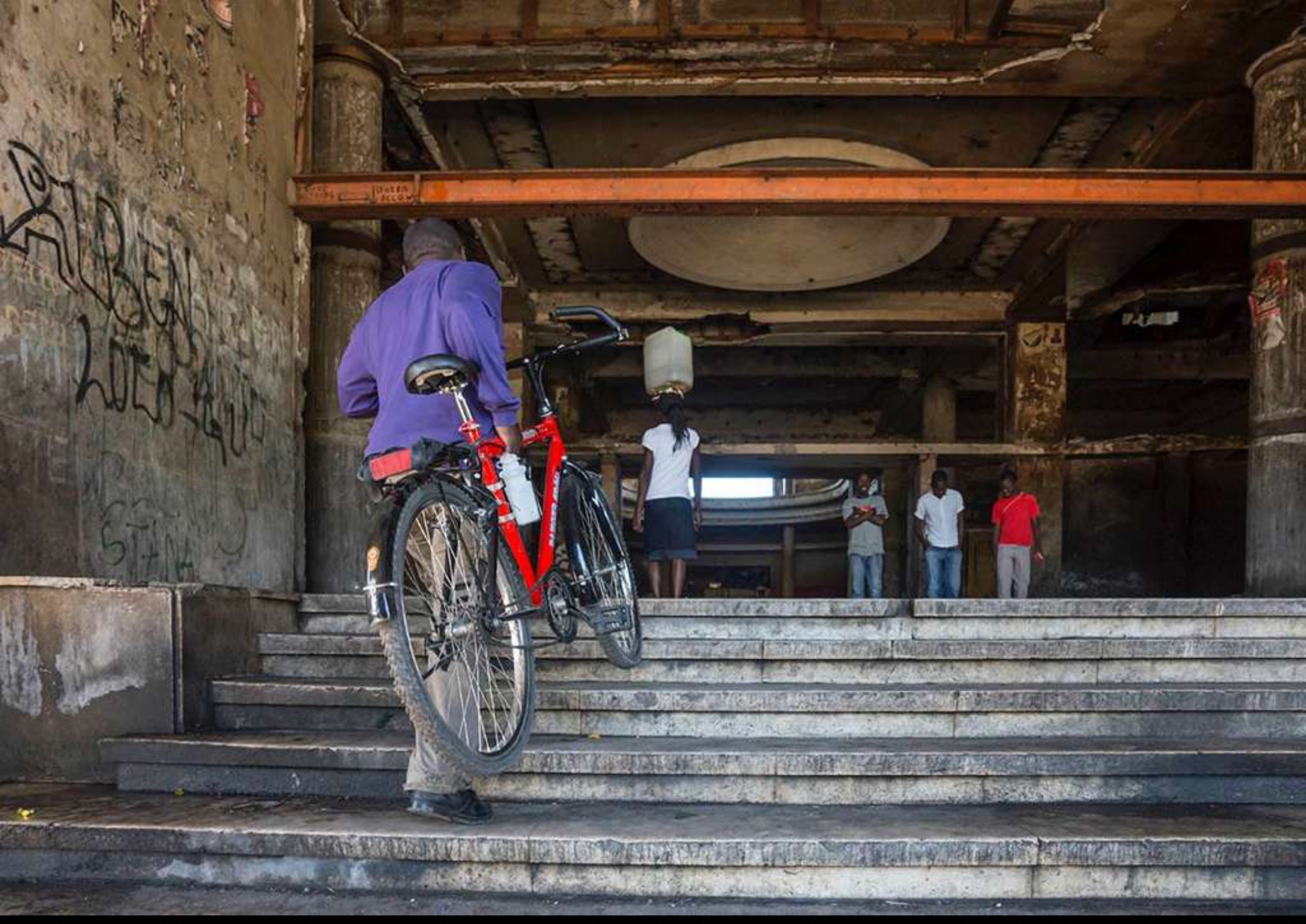
The living conditions are atrocious. Drugs, disease, and trash are ubiquitous. People have removed much of the plumbing, electrical, windows and even concrete to sell on the black market. This weakens the building but provides them with another meal.