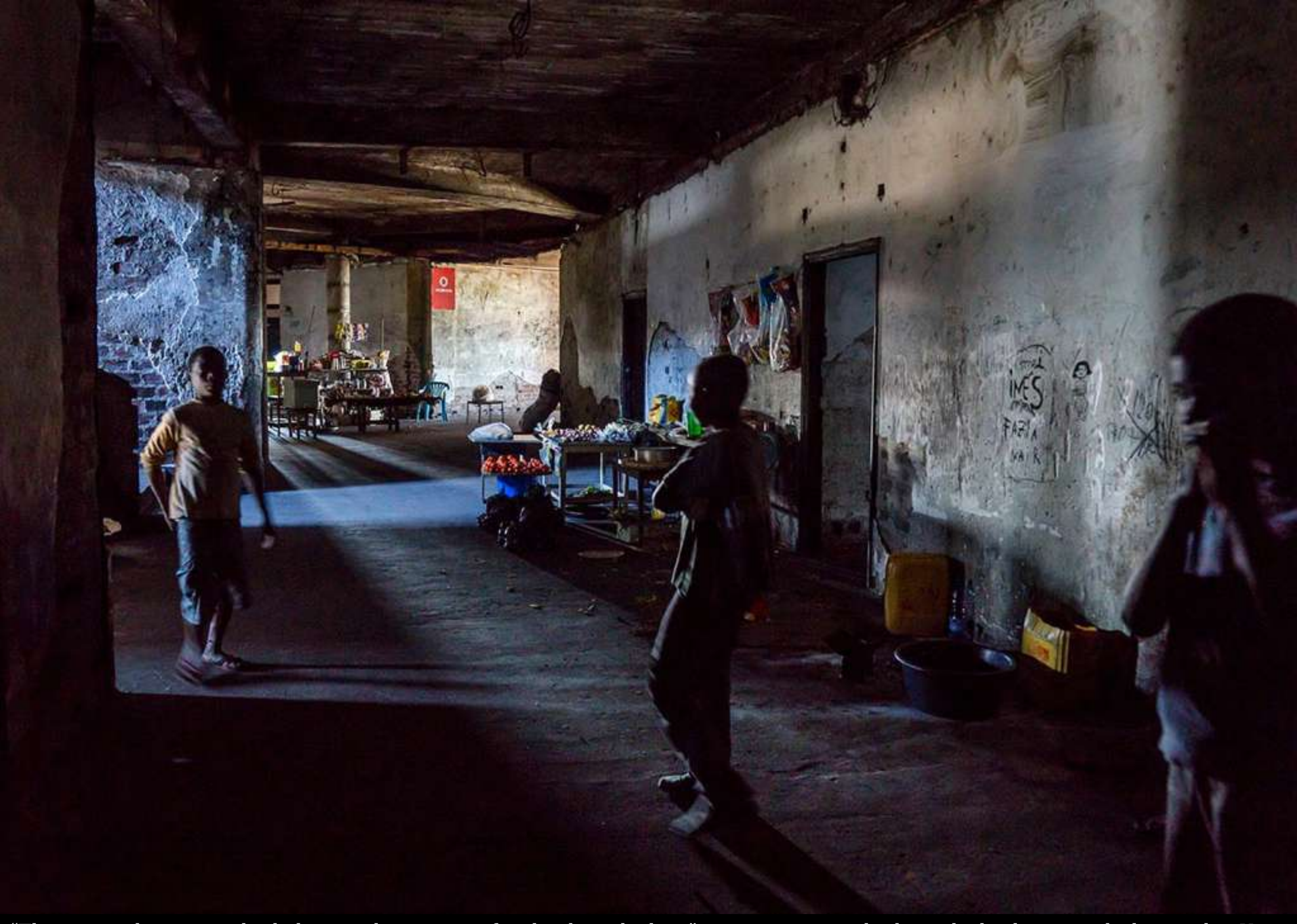
"There is no hope as nobody has a salary, except for the drug dealers," says a woman who has a little shop in a dark corridor. You need a lamp to see what she is selling.