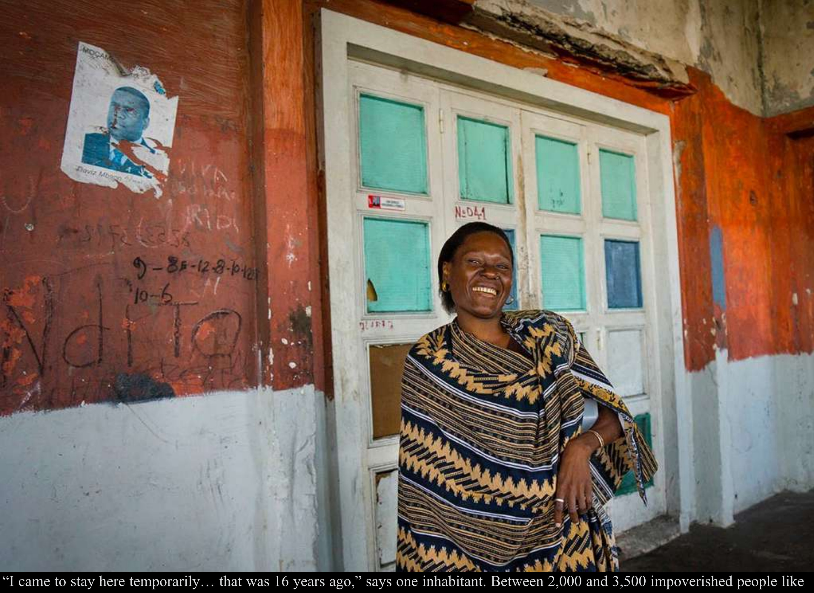
him now crowd the Grande Hotel. There are approximately 700 families in residence.