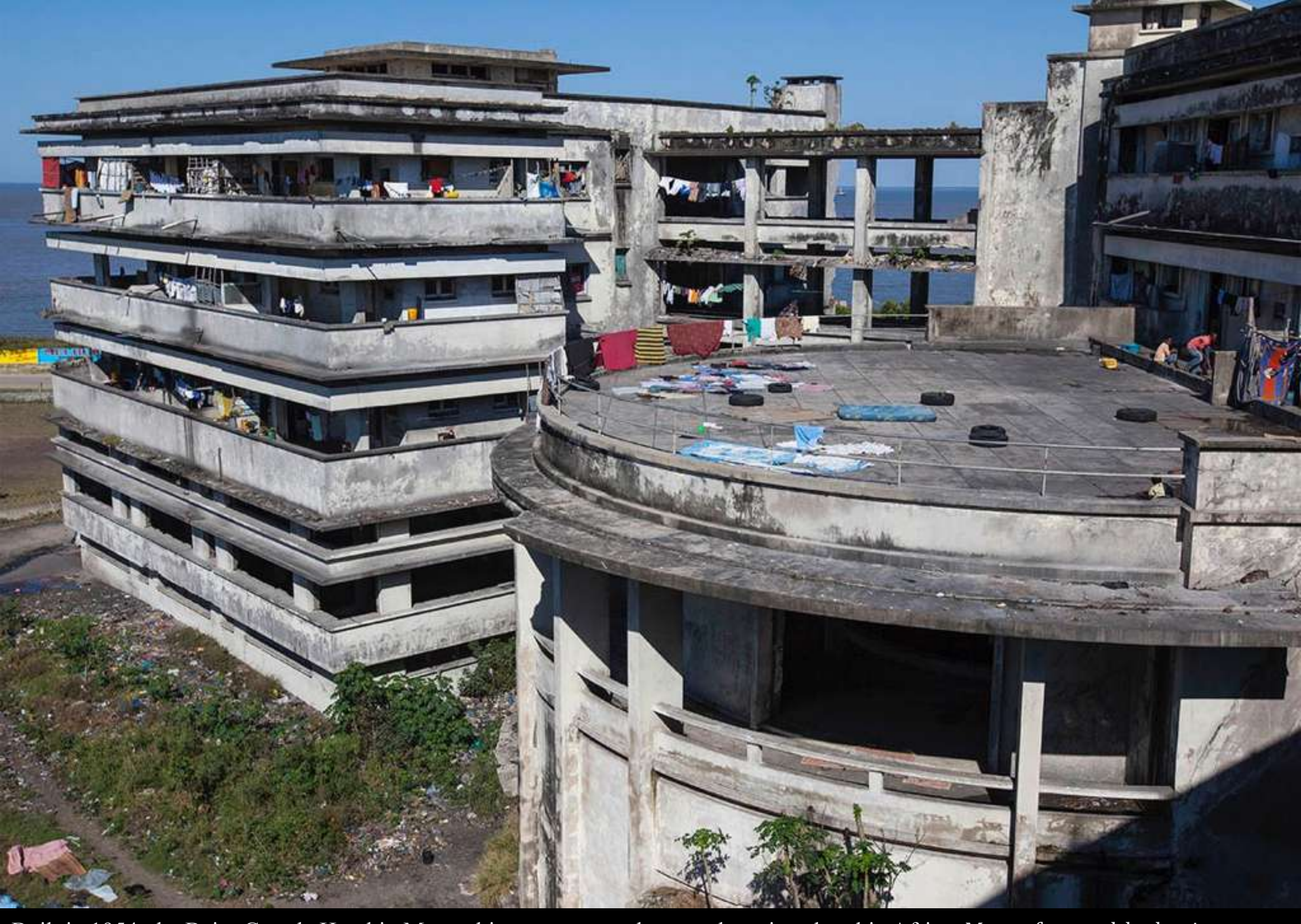
Built in 1954, the Beira Grande Hotel in Mozambique was once the most luxurious hotel in Africa. Meant for wealthy businessmen and tourists, it was both the pinnacle of luxury and of colonial folly. There was no demand for it so they shut it down in 1963.