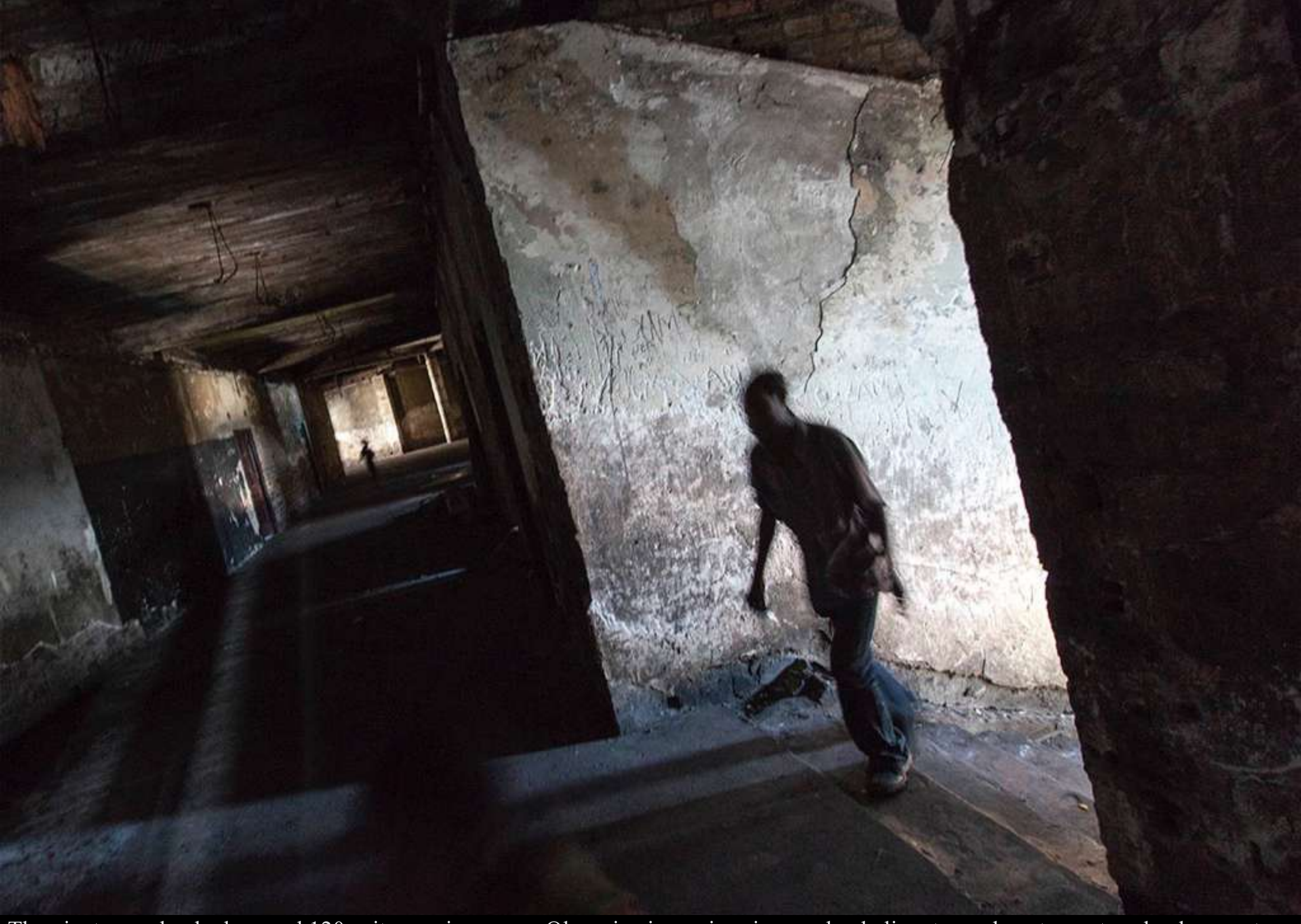
The giant complex had around 120 suites, a cinema, an Olympic-size swimming pool, a helicopter pad, restaurants, a bank, a post office - it was a city in itself.