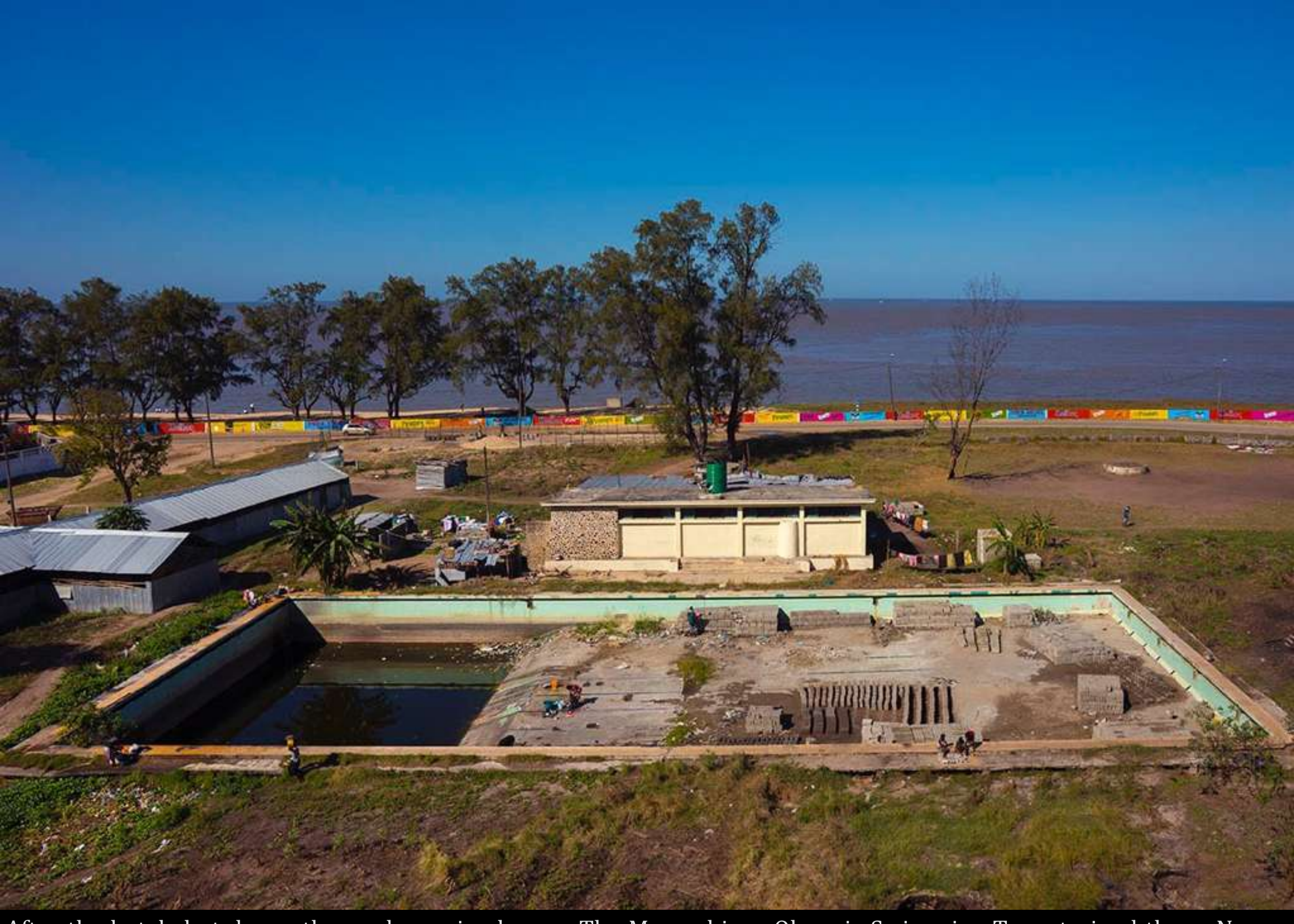
After the hotel shut down, the pool remained open. The Mozambican Olympic Swimming Team trained there. Now, filled with no more than a dirty puddle, it is used by inhabitants for bathing or washing laundry.