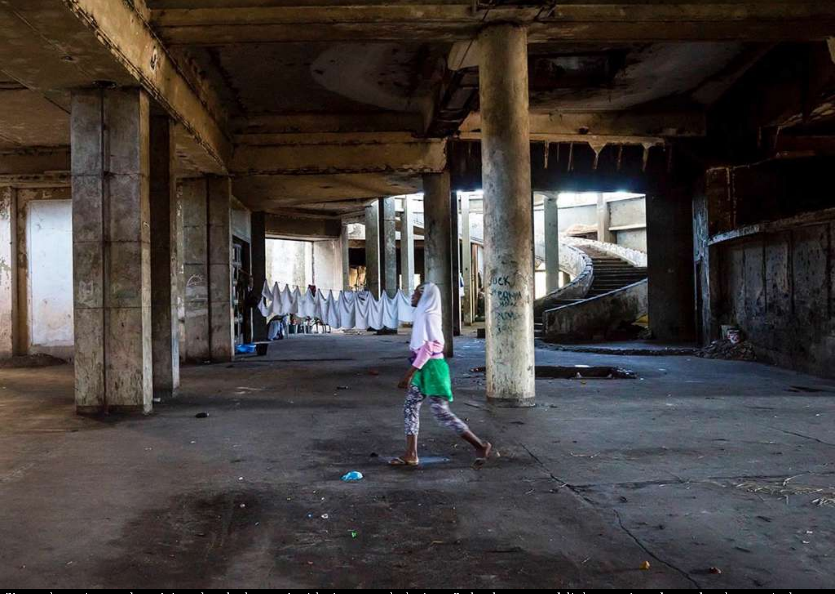
Since there is no electricity, the darkness inside is overwhelming. Only the natural light coming through where windows used to be illuminates the hotel. Clothes are hanging where the giant reception used to be.