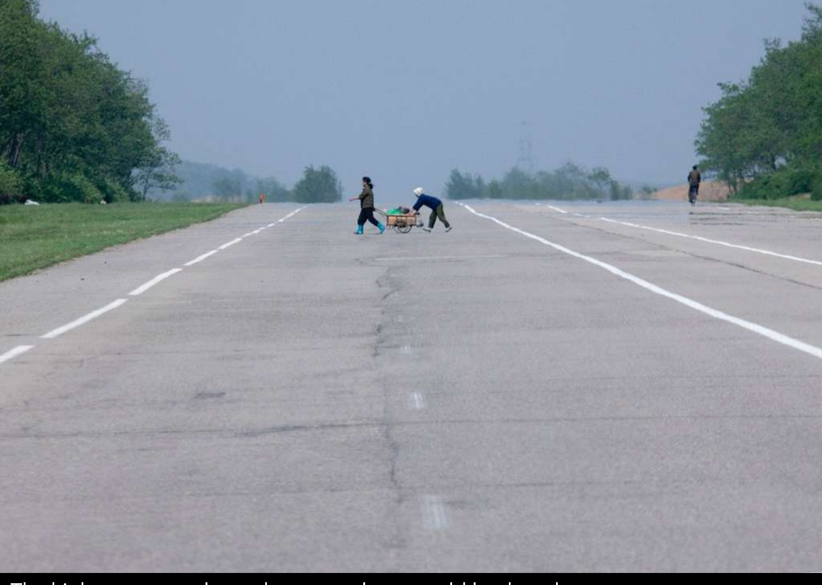
The highways are so large that even planes could land on them.