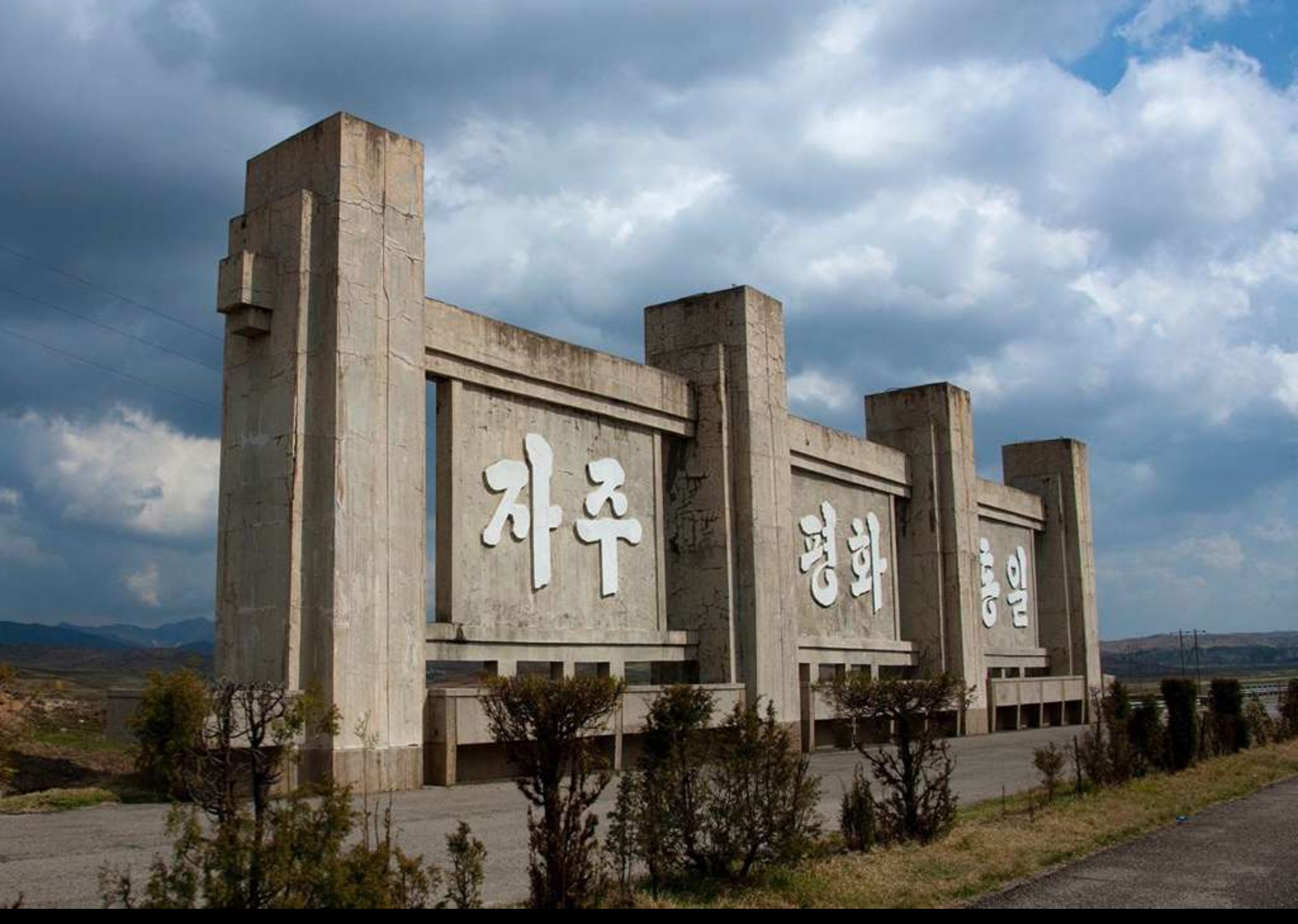
«Independance, peace, reunification » on the cement blocks of the DMZ highway.