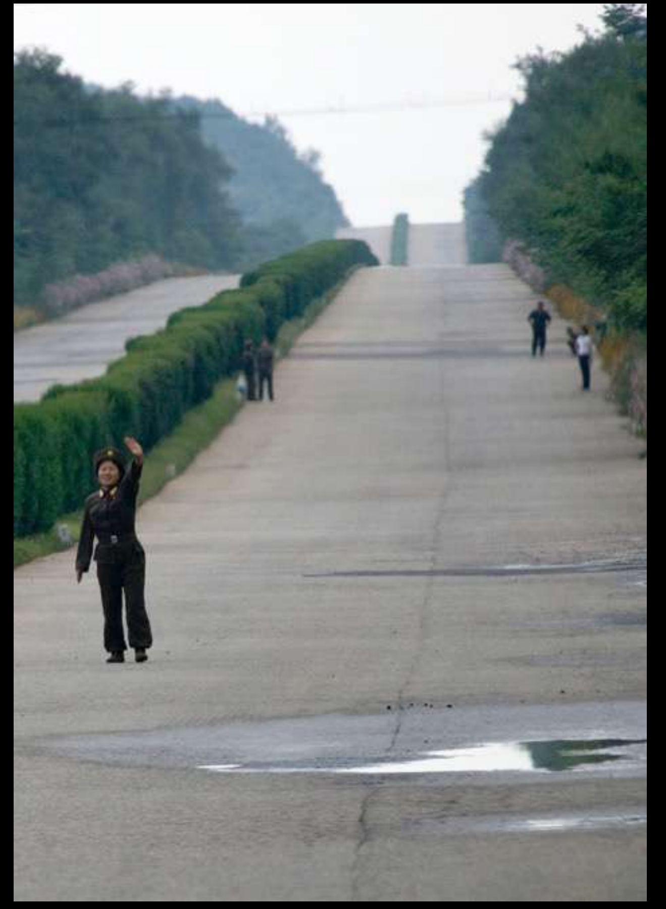
Yes, in North Korea, you can bike without danger on highways. A lot of people are trying to stop cars, however they have to wait for hours... So, I ask my guide to stop for them as the tourist bus I have is empty. He refuses, explaining that it is absolutely impossible to do this.