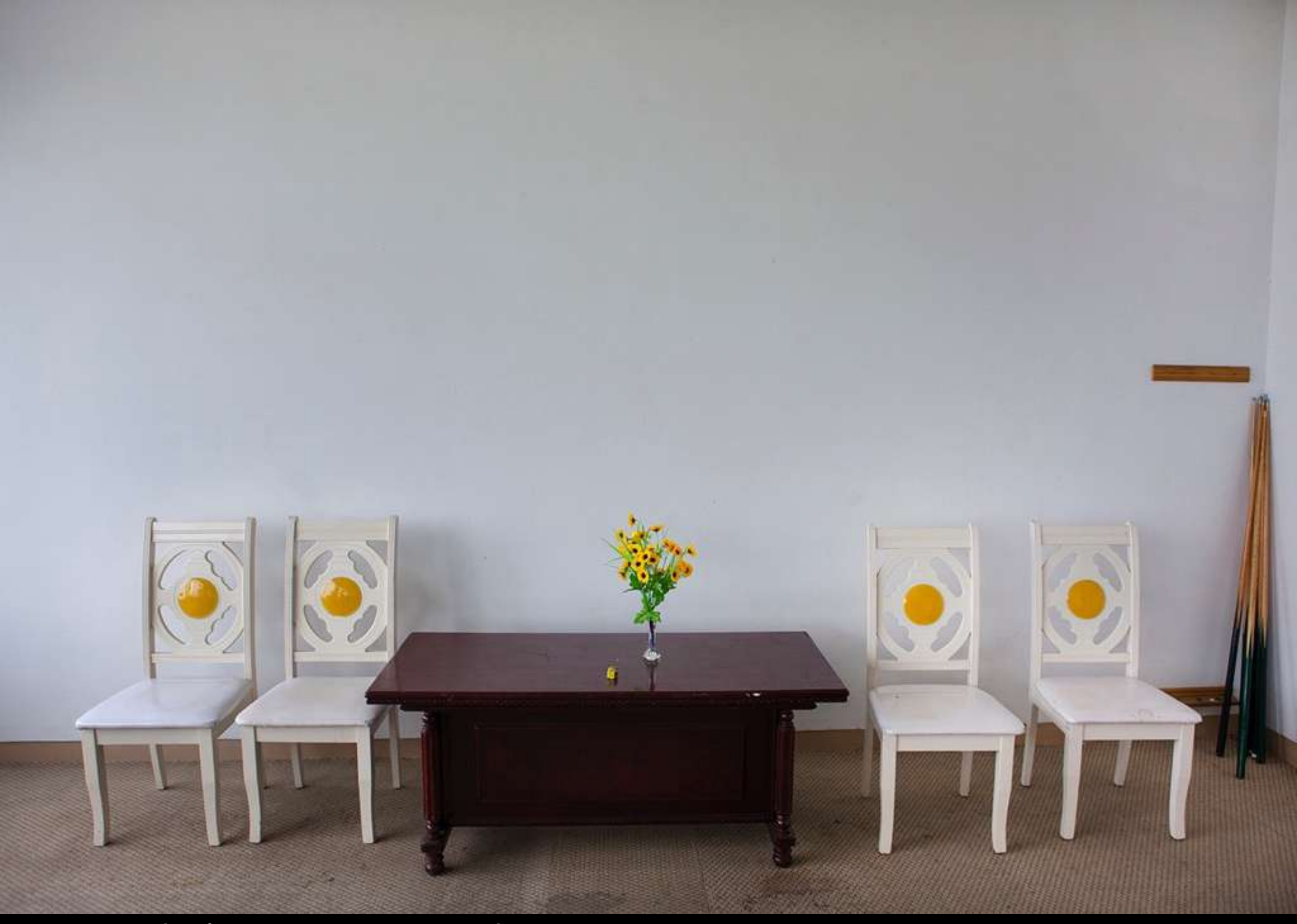
A nice and relaxing room in a Highway.