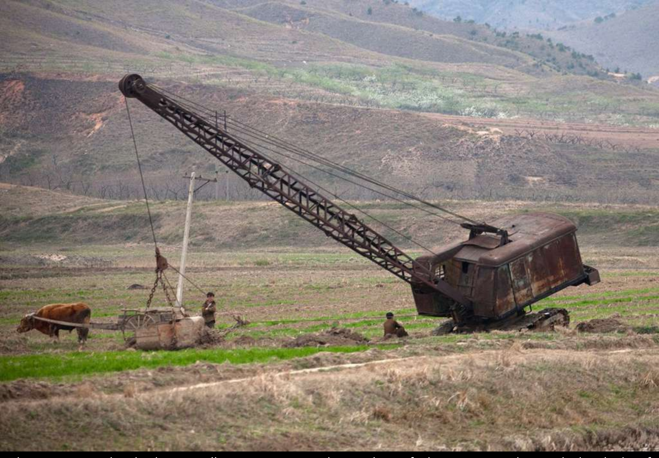
The trips on the highways allow us to see the reality of the countryside, and the lack of development it seems time has frozen in the 50s..