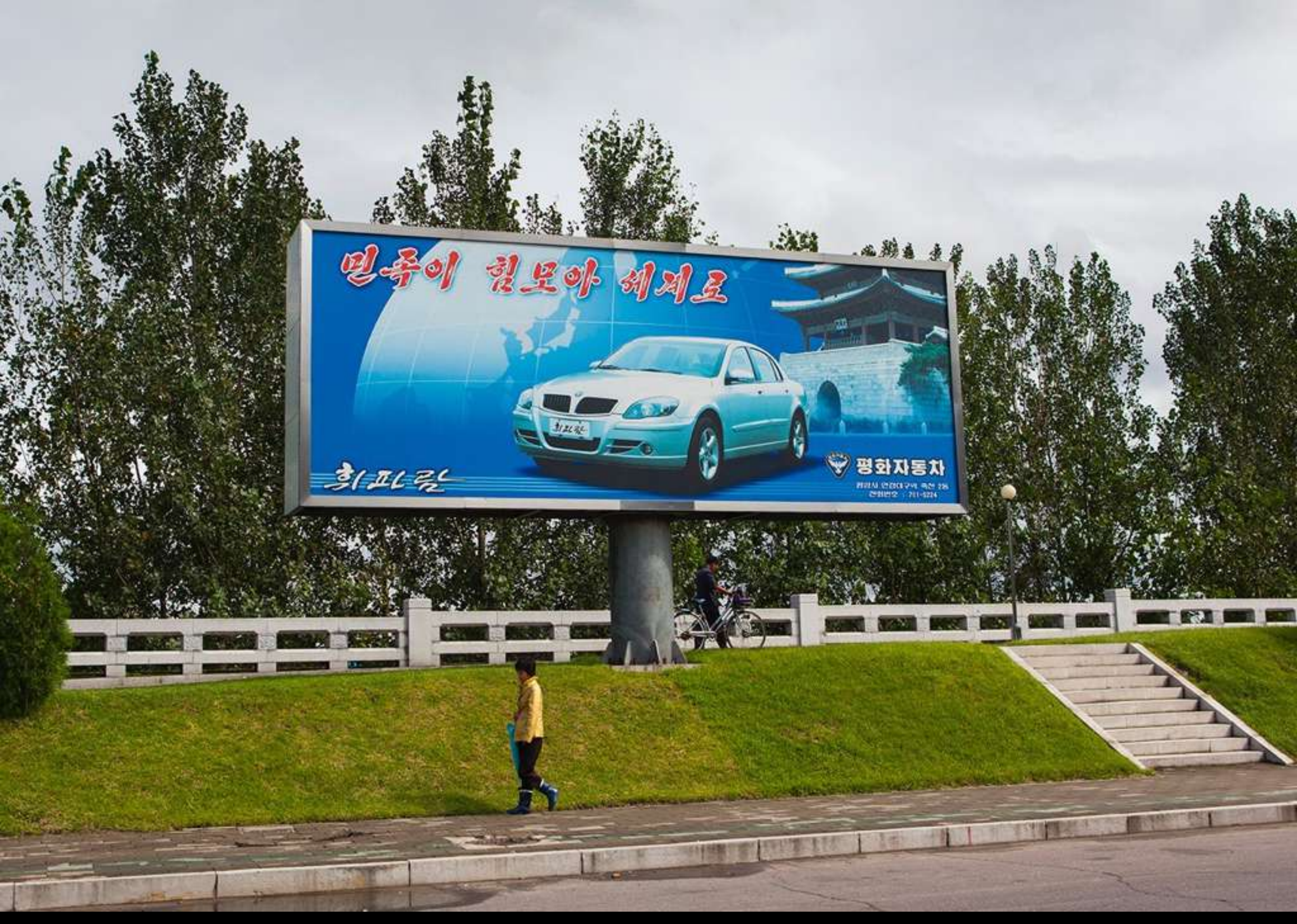
Ironically, the only advertising billboards you can see in Pyongyang are about... cars!