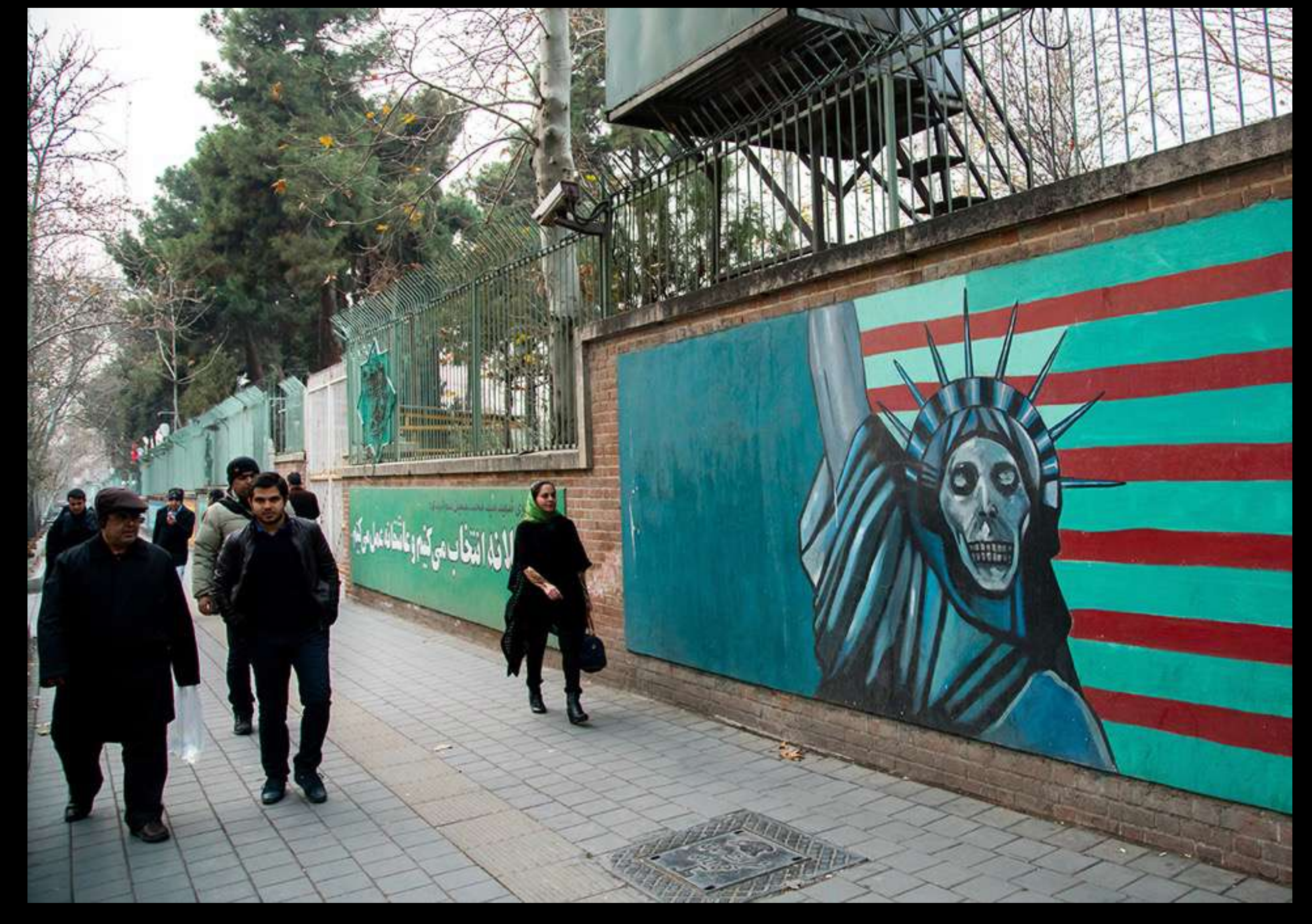
An Iranian version of the Statue of Liberty on the walls of the former American embassy in Tehran, which was captured in 1979 during the Revolution. The building is now home to a militia base and a sports club.