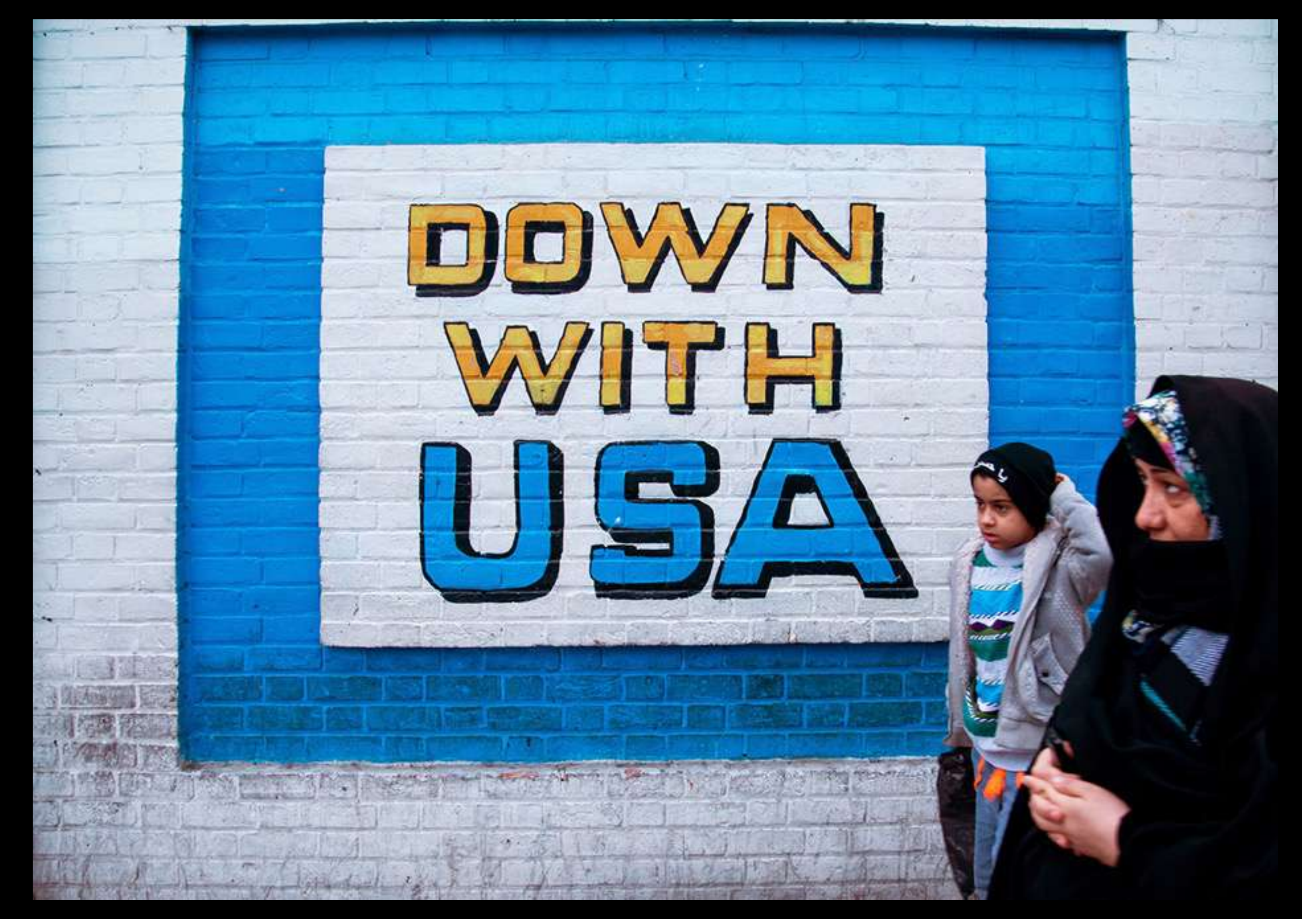
"Down with USA" on the walls of the former American embassy in Tehran. When they saw me taking this picture, many young Iranians stopped and whispered to me, "This is not the real Iran."