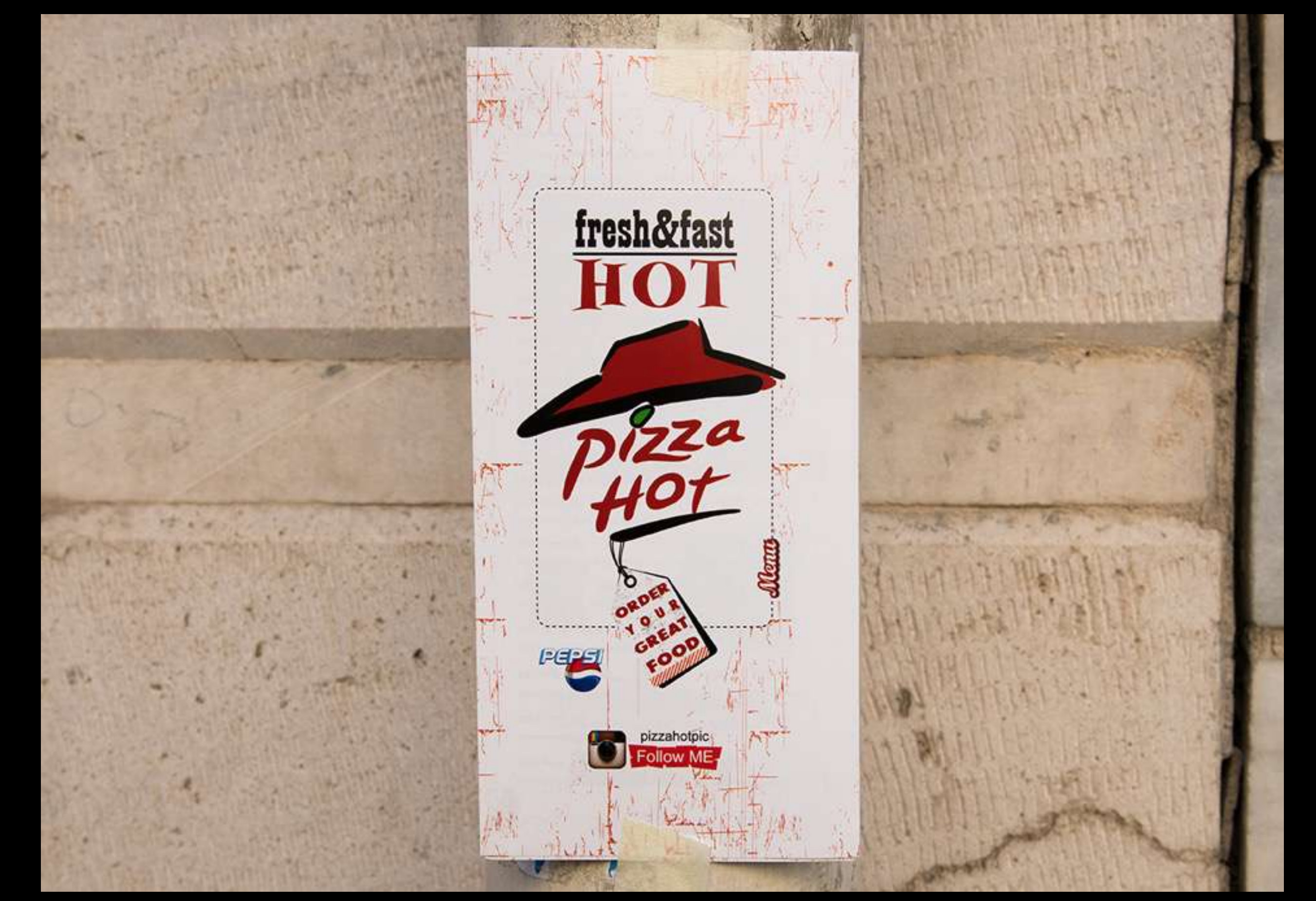
Doubtful whether the CEO of Pizza Hut in Dallas has heard of Iranian cousin "Pizza Hot," who uses the same marketing and social media to get customers.