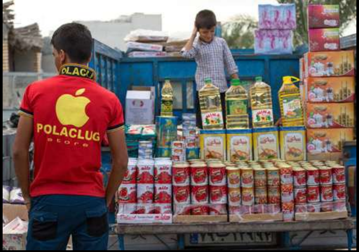
Apple's logo can be found everywhere: in the cars for luck, on t-shirts advertising local shops and even in hotels like on those beds in Qeshm.