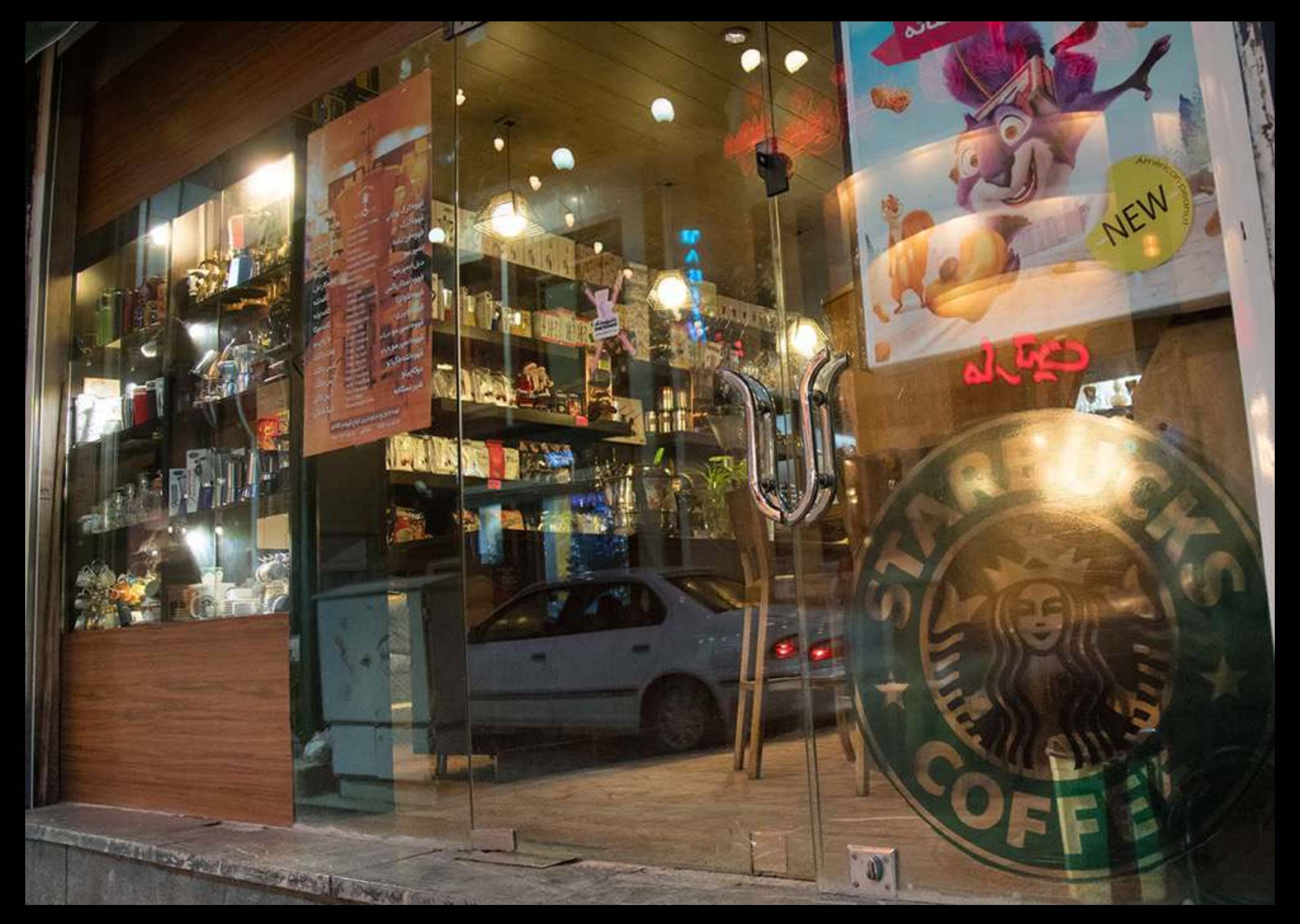
A fake Starbucks cafe in the Armenian neighborhood of Tehran.