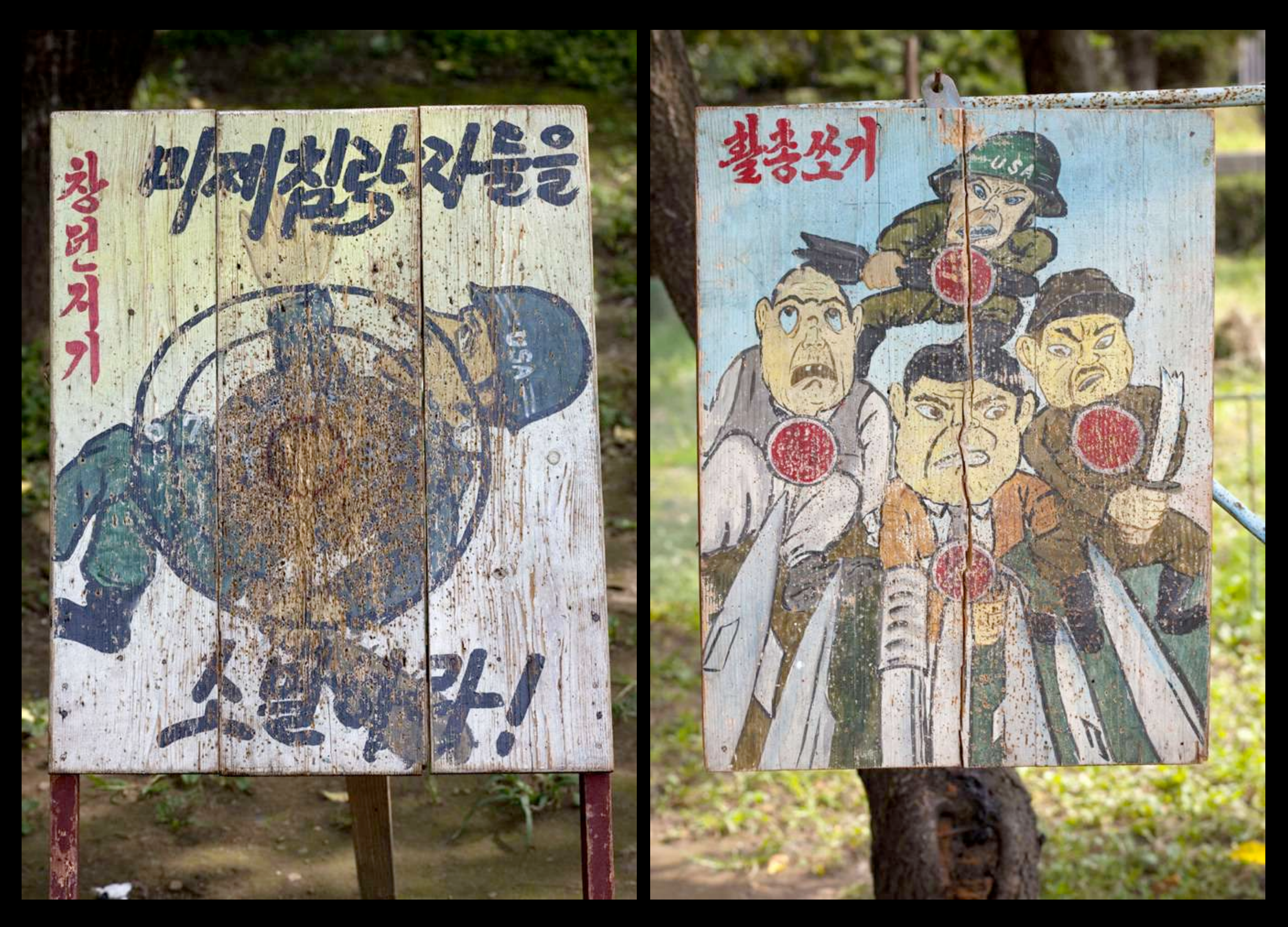
Targets with US soldiers in the Pyongyang Fun Fair.