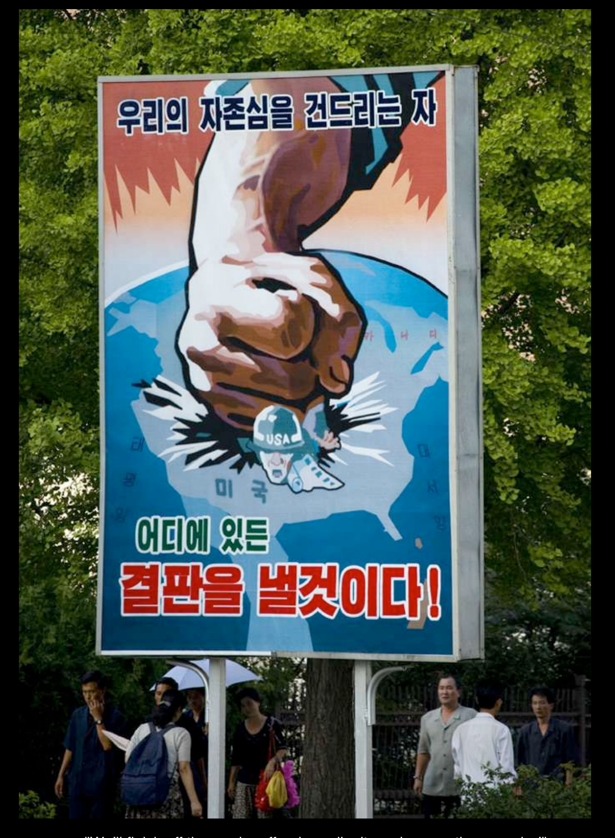
"We'll finish off those who offend our dignity - wherever they may be!"

The last billboard in the streets of Pyongyang showing a North Korean fist crushing a US soldier. Every 6 months posters are changed, but this one remains.