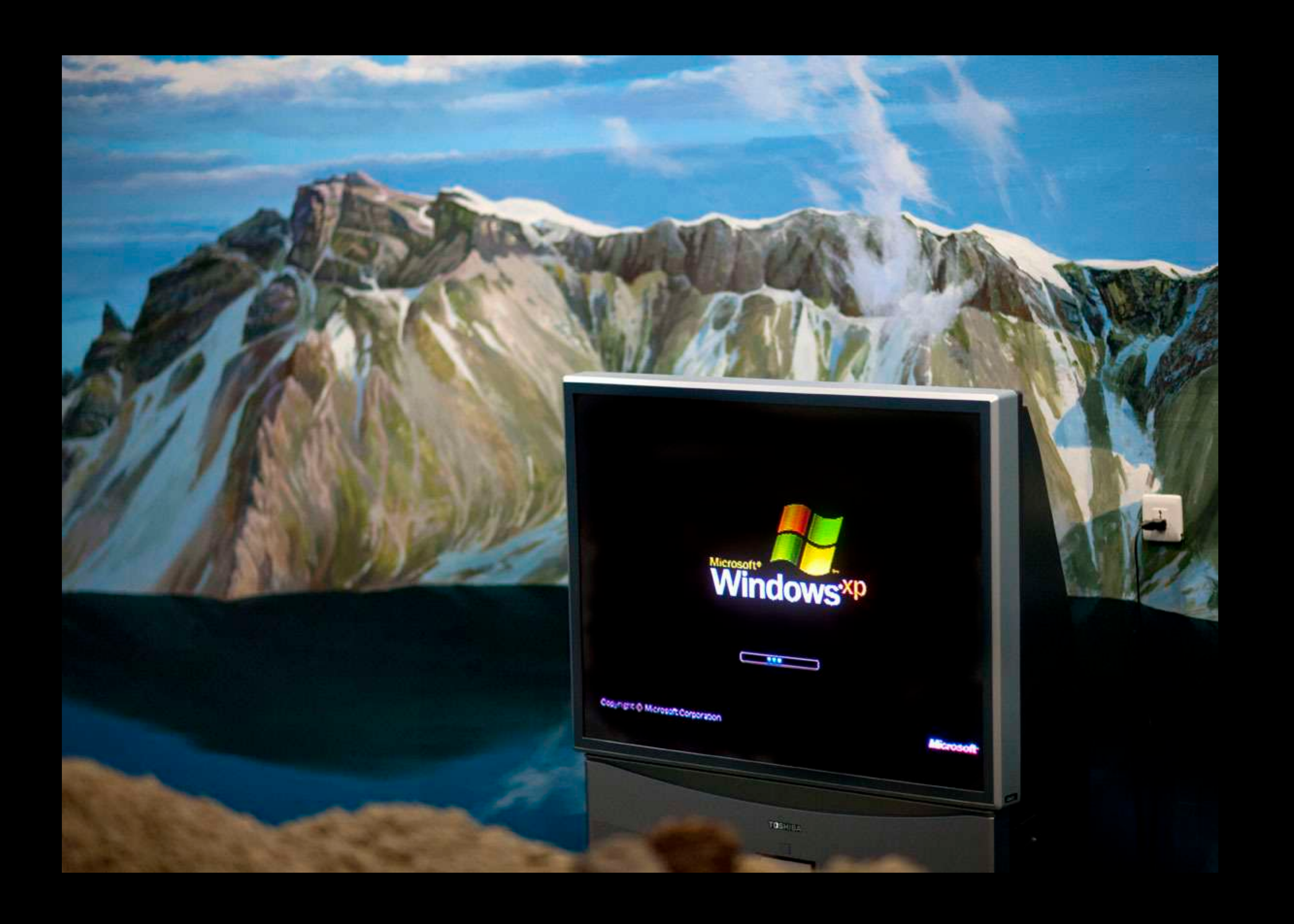
Windows program in Samjiyŏn Students and Children's Palace, in front of Mount Paektu fresco. Many bugs.