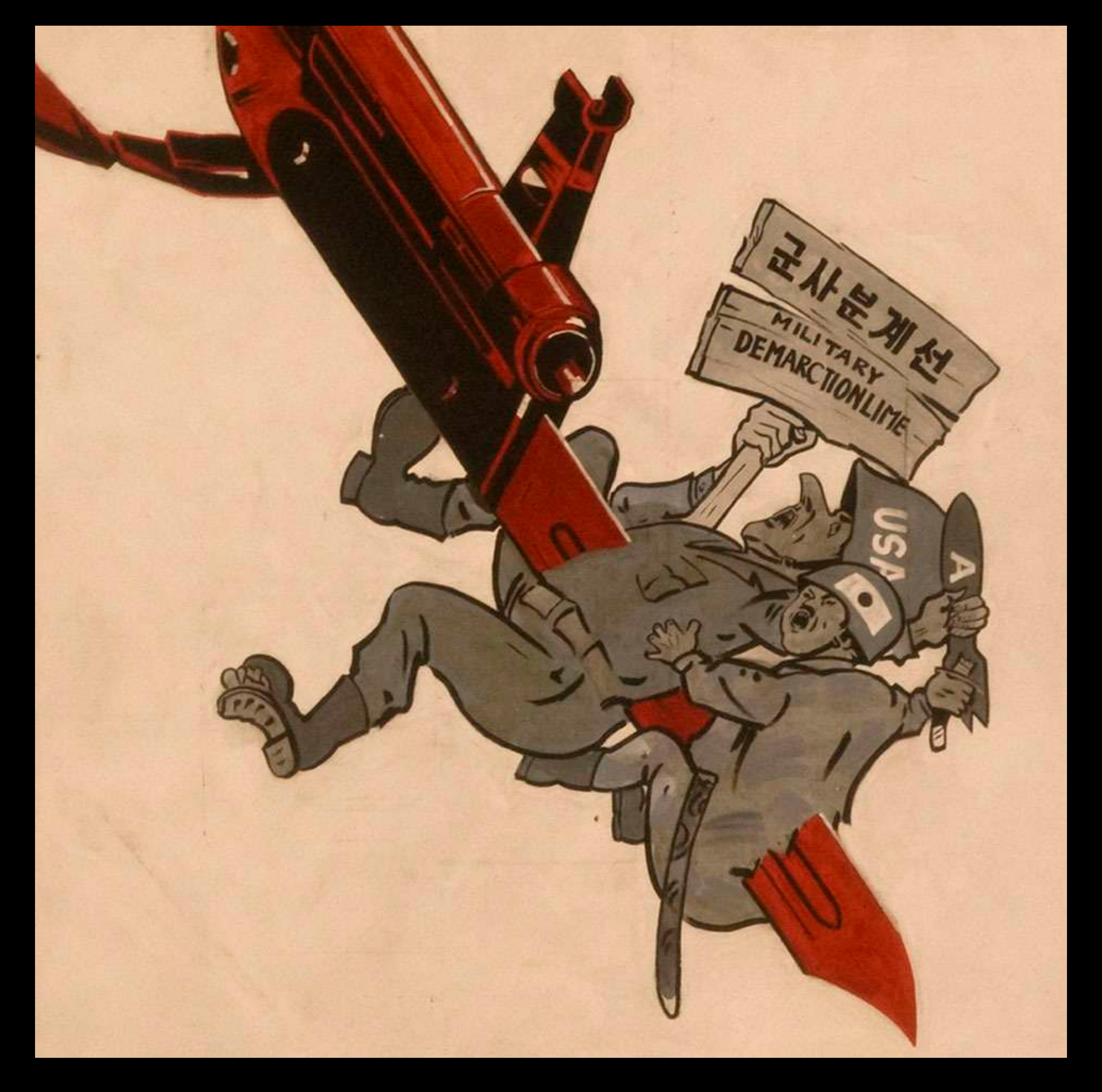
Propaganda poster near the DMZ showing the South Koreans (called the Puppets in North Korea) and the US Army. Less and less posters like this can be seen in the streets.