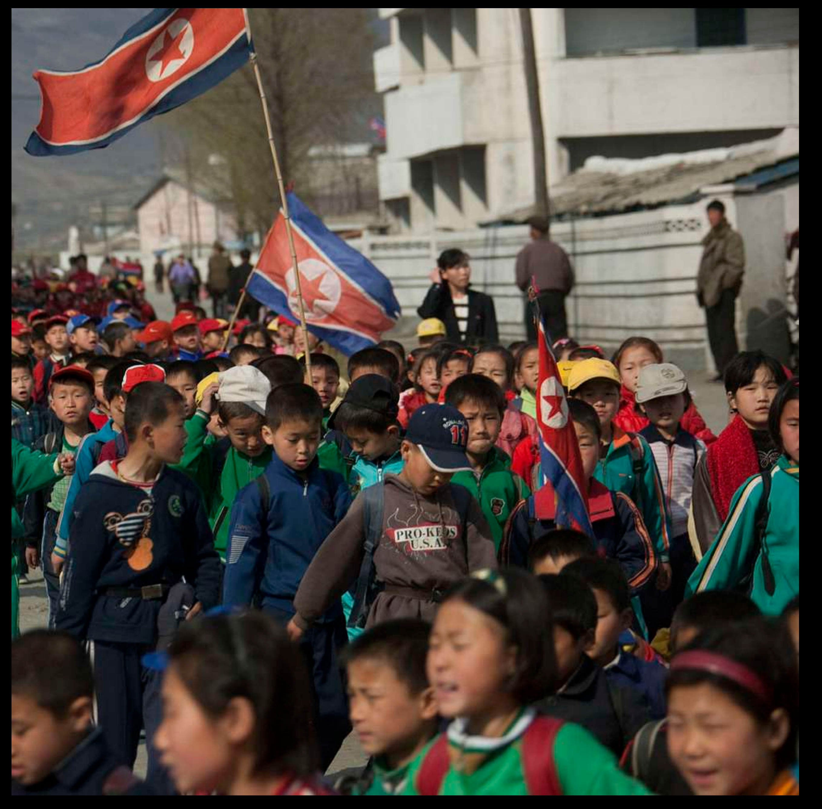
Kids during the May 1st parade near Kaesong, one wearing a «Pro Keds USA » t-shirt.