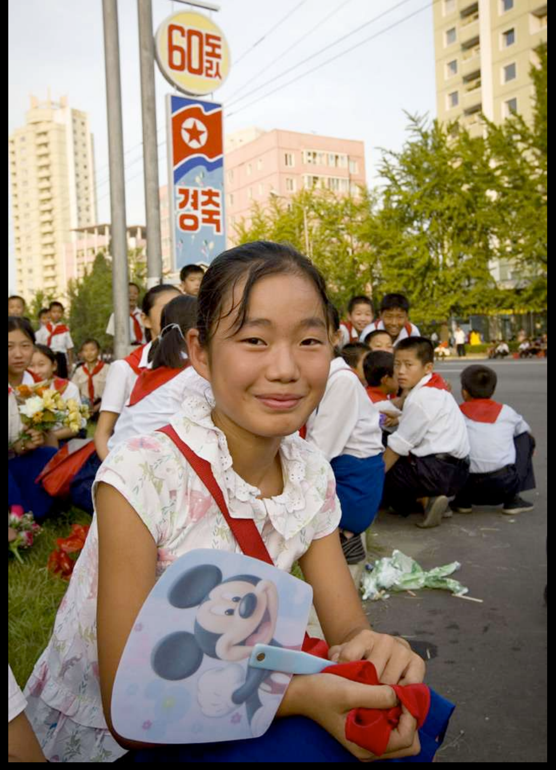
Young Pioneer waiting for the parade on September 9th, in Pyongyang carrying a Mickey Mouse fan. She didn't know anything about the cartoon character.