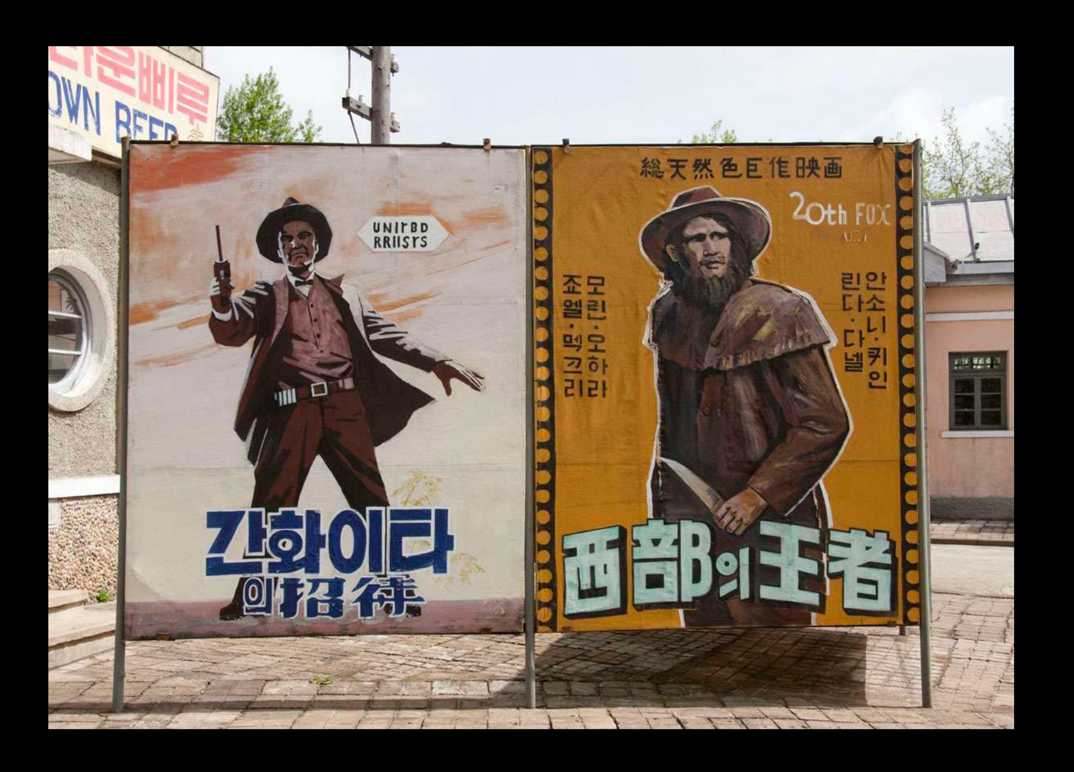
Fake American movie posters in Chollima studio, Pyongyang, with « 20th Fox » and "United Artists" logos. They are part of the set.