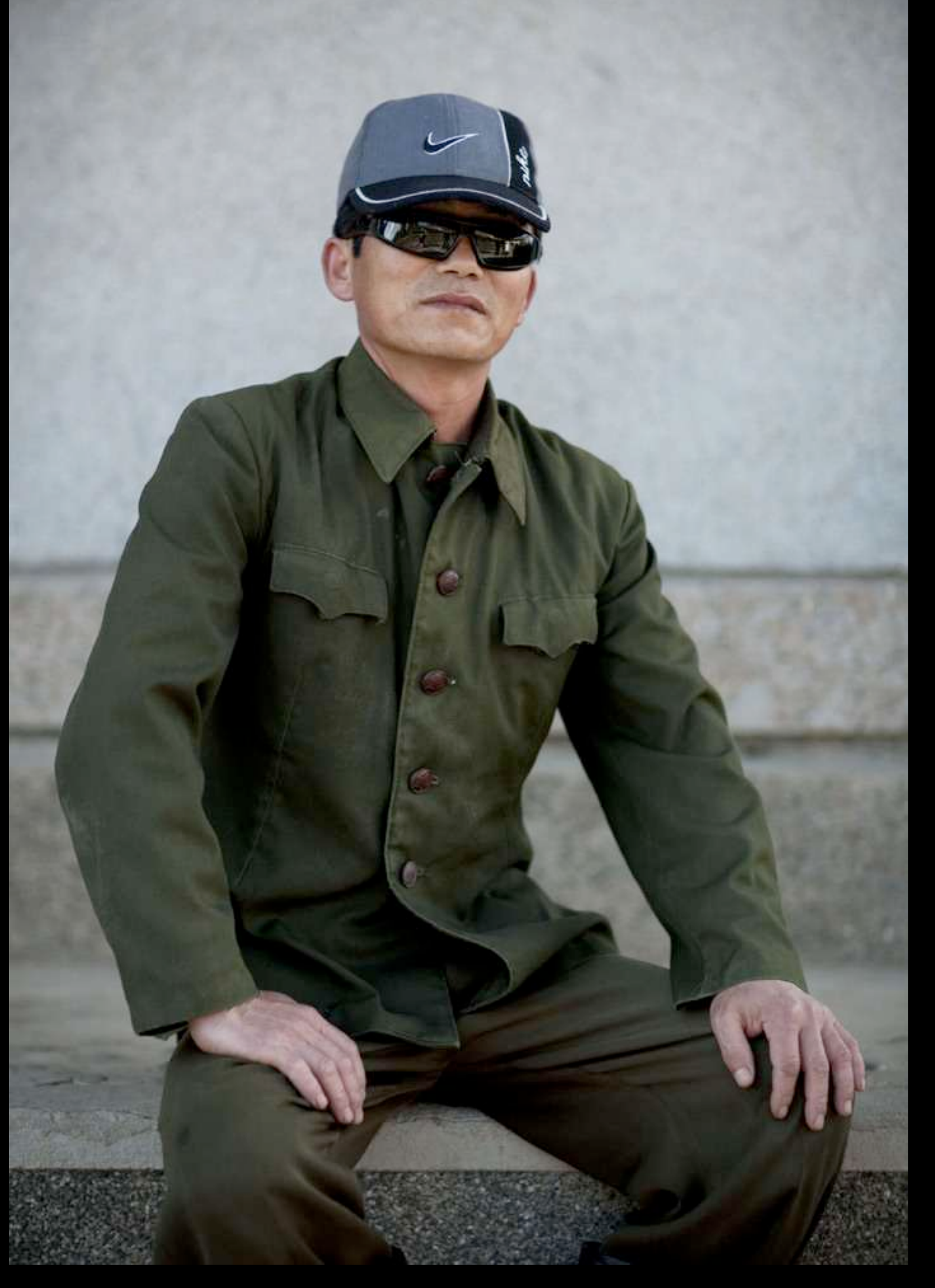
When I saw this man, a worker on the Chilbo sea, I said to my guide: "Look, he's got an American cap!!" He replied: "no, it's not American, it is Chinese!"