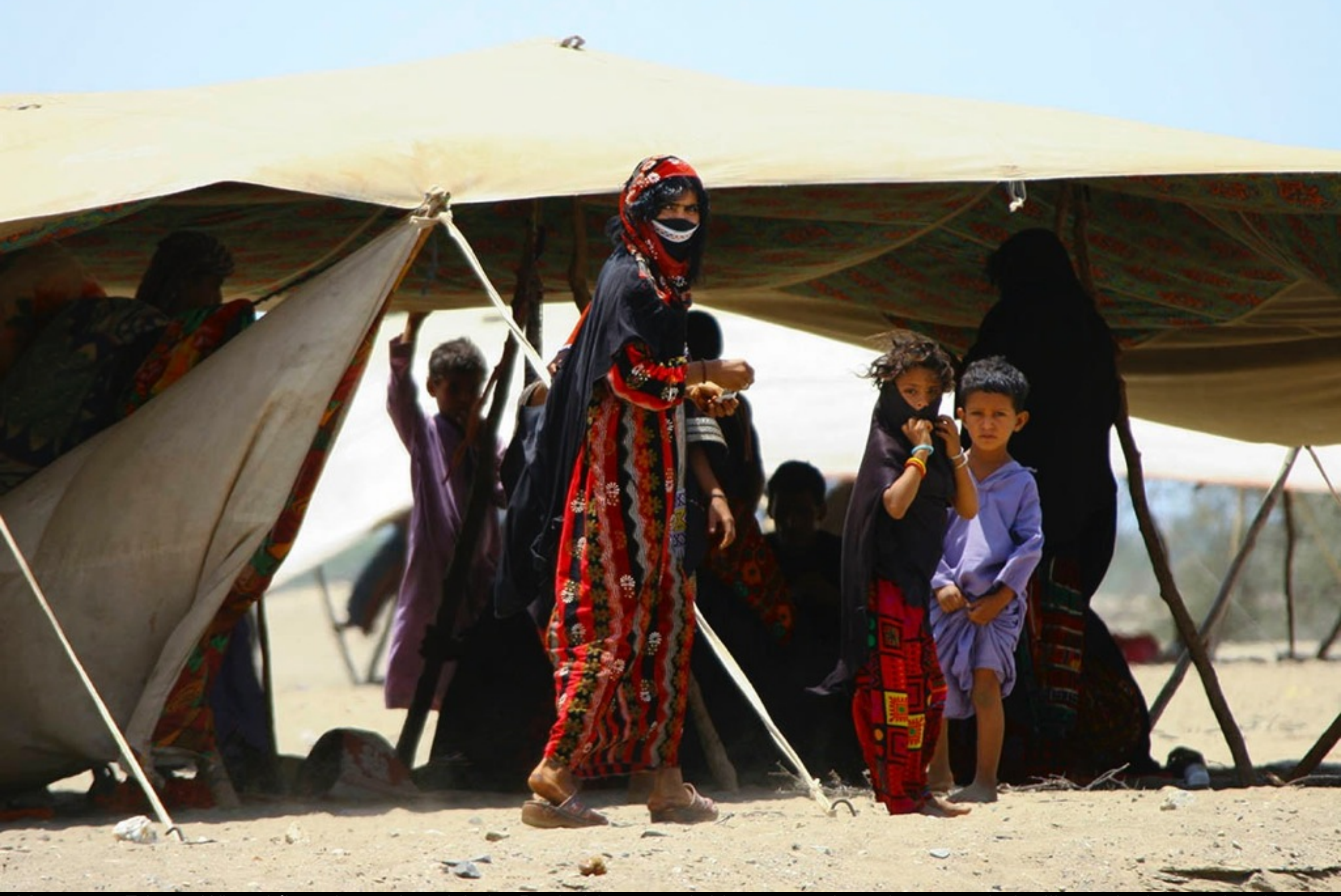
Massawa, Eritrea. When i first planned to visit the Rashaida, no taxi driver agreed to take me to their villages in the nearby desert. "They will rob you and they will steal my taxi," they all told me. After tough negotiations, one driver finally agreed to drop me off 200 meters from a camp. Sure enough, as soon as the kids saw me, they ran towards me and began to search my pockets for money. The adults arrived and with one word made the kids go away.