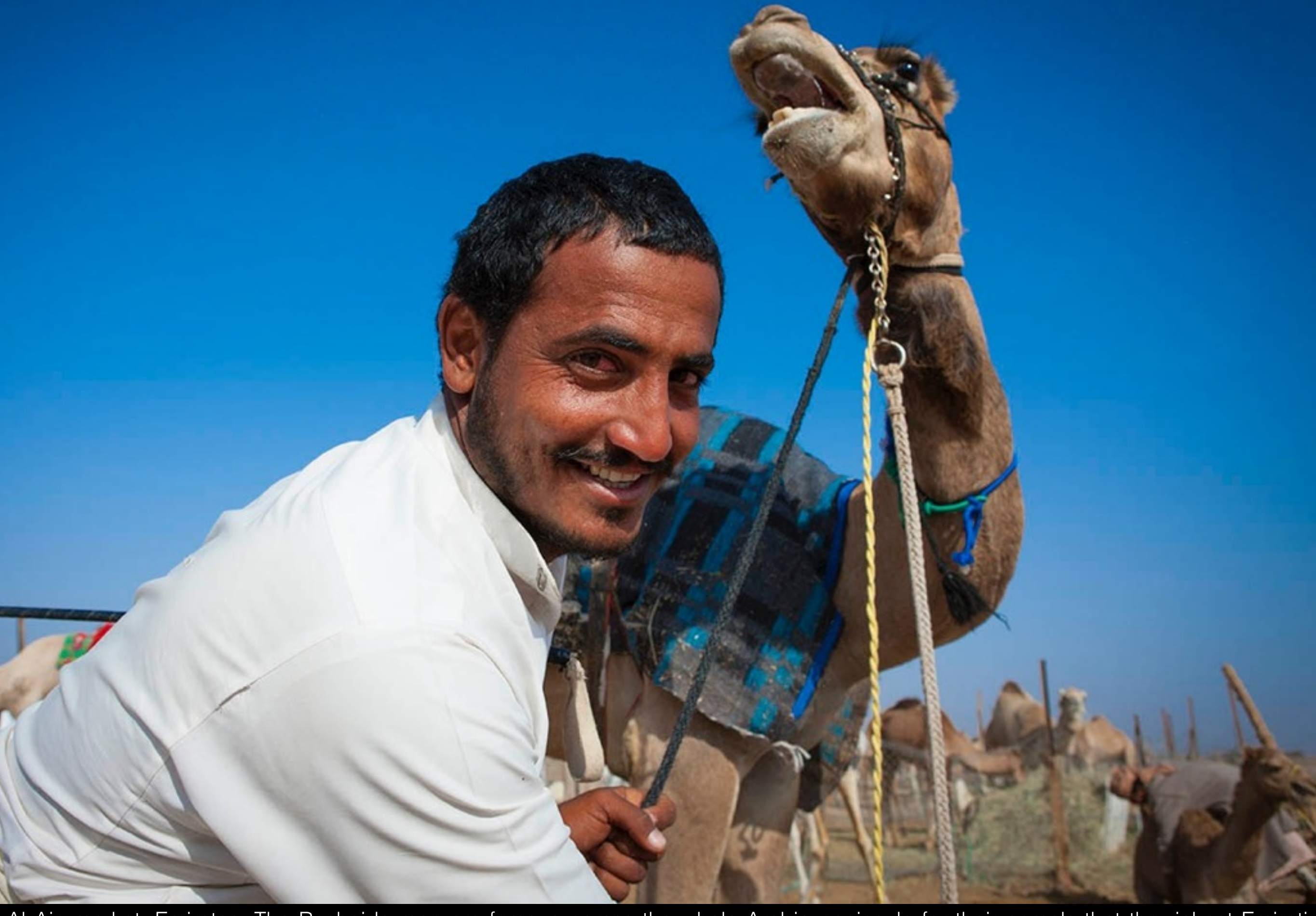
Al Ain market, Emirates. The Rashaida men are famous across the whole Arabic peninsula for their camels that the richest Emirati people buy for races and breeding. Many Rashaida men leave the desert to go to Dubai and work, taking care of the most expensive camels on the market.