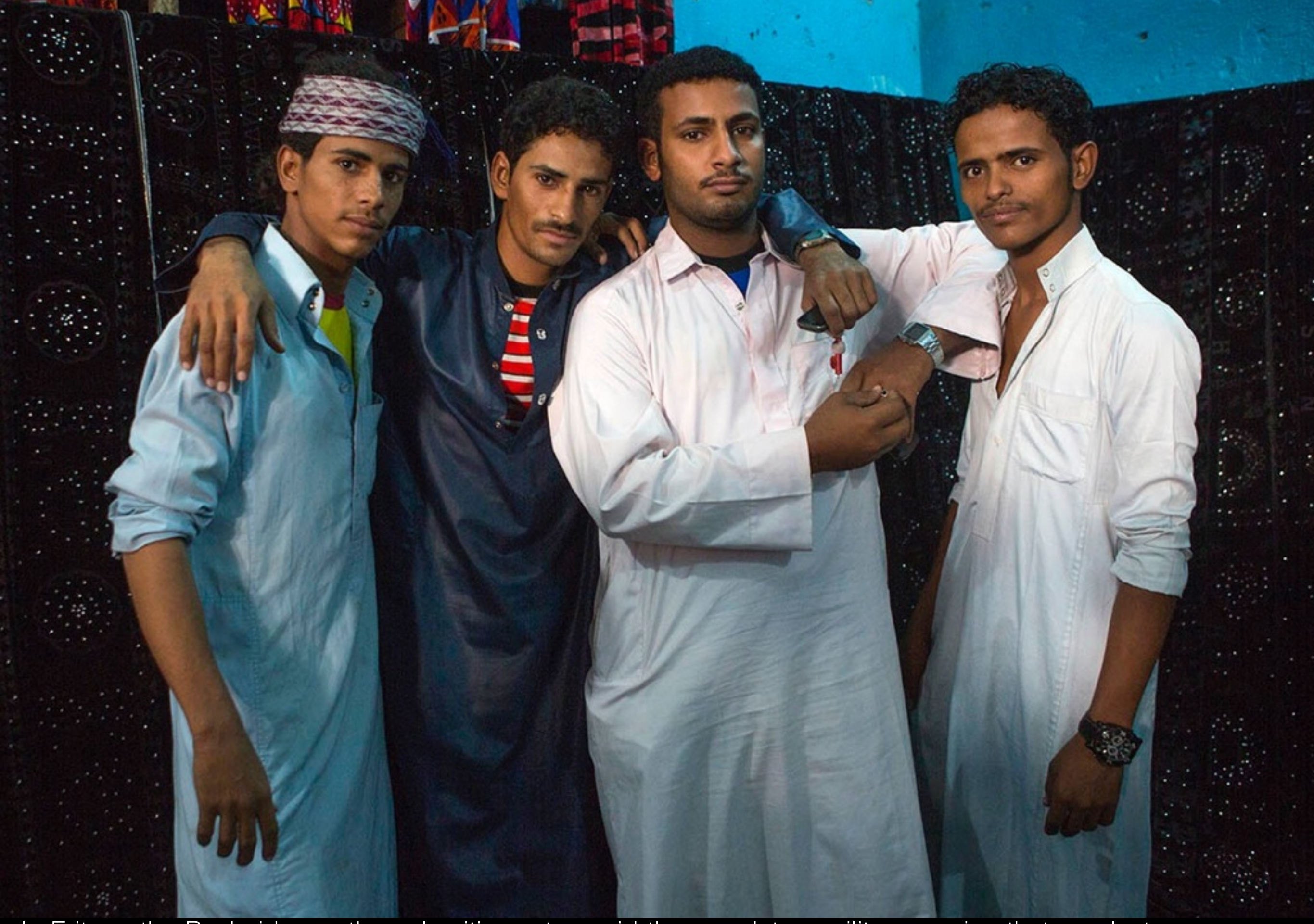
In Eritrea, the Rashaida are the only citizens to avoid the mandatory military service that can last many years since the regime is a dictatorship.