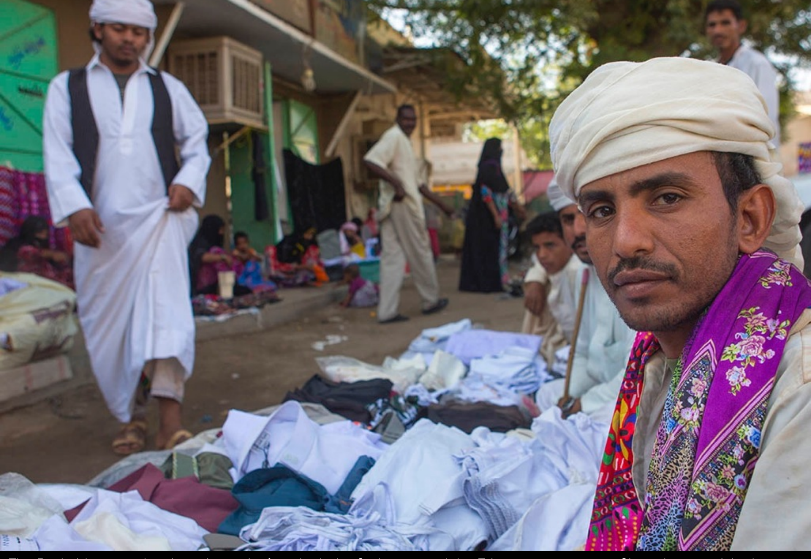
The Rashaida smugglers have immunity from both the Sudanese and the Eritrean governments. Since they are rich, they can bribe practically any officials. In Eritrea, the black market that has become the mainstay of the economy depends heavily on the Rashaida.