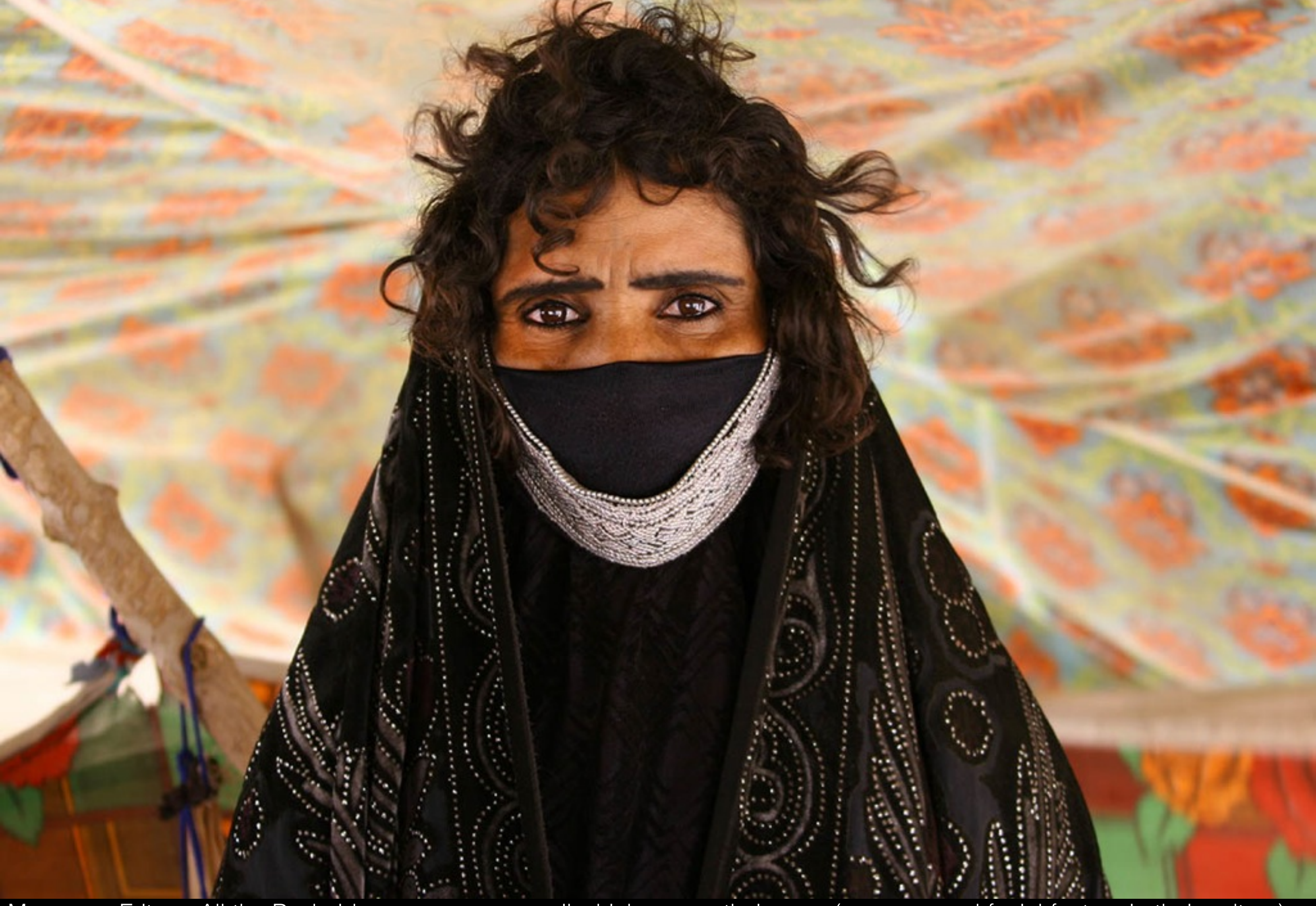
Massawa, Eritrea. All the Rashaida women wear a veil which covers their nose (a very sexual facial feature in their culture) and their mouth, but not their hair - this is rather surprising for the Muslim culture. With long hair, some of them have an amazing style with their hair going out.