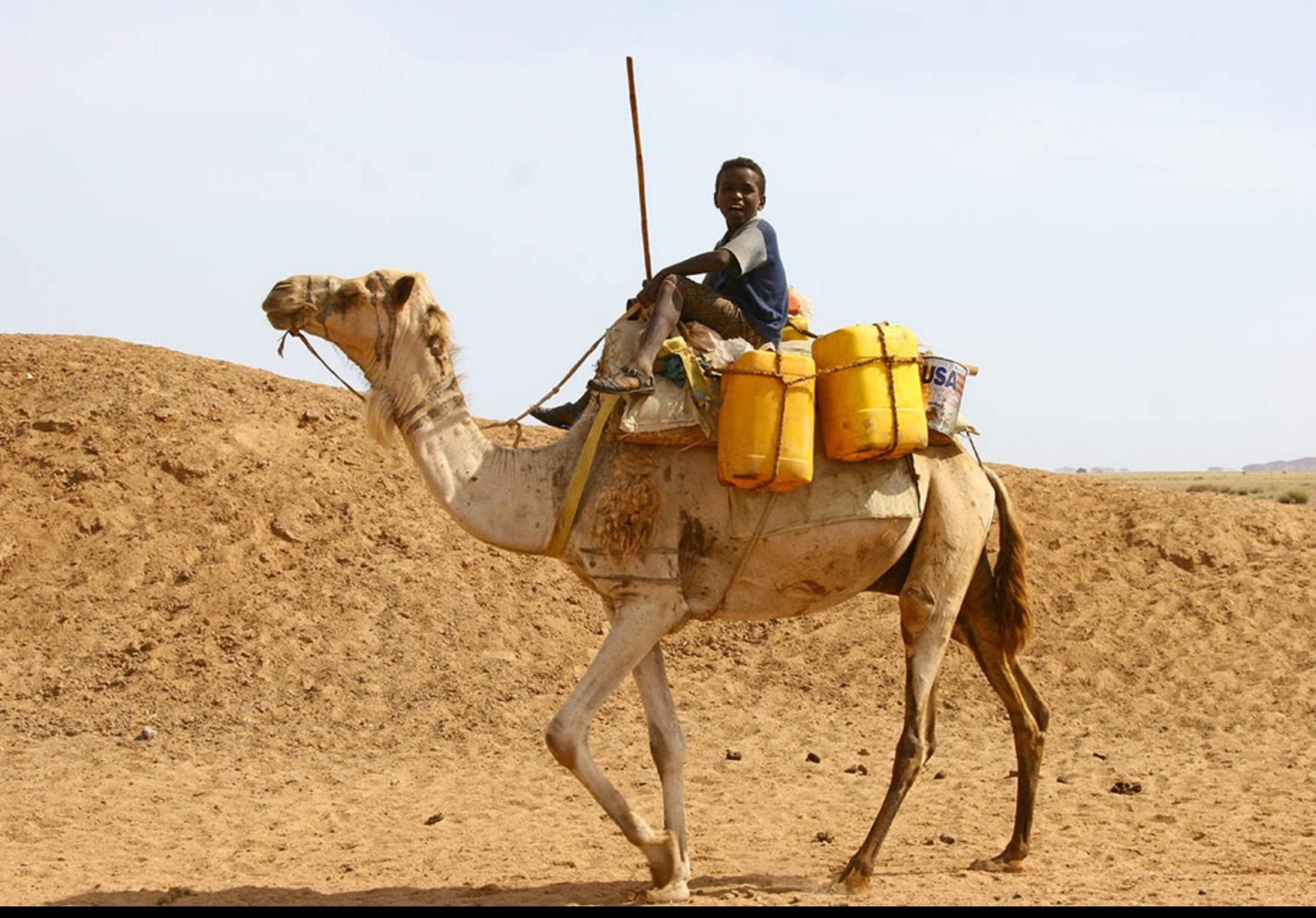
When the Rashaida arrived in Africa from Saudi Arabia in the mid-19th century, they did not have access to regular water sources so they became nomadic camel pastoralists, learning the ins and outs of the desert.