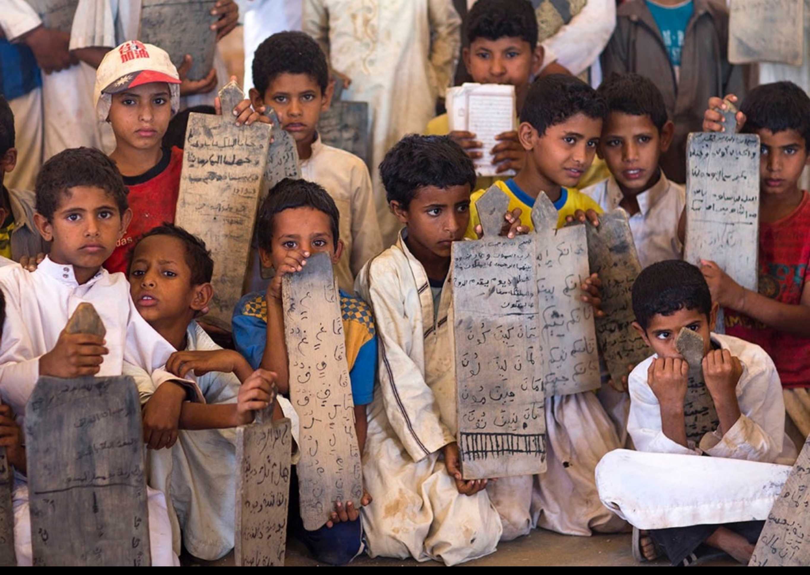
Koranic school in Suakin, Sudan. The Rashaida are muslim, they follow Saudi sharia law.