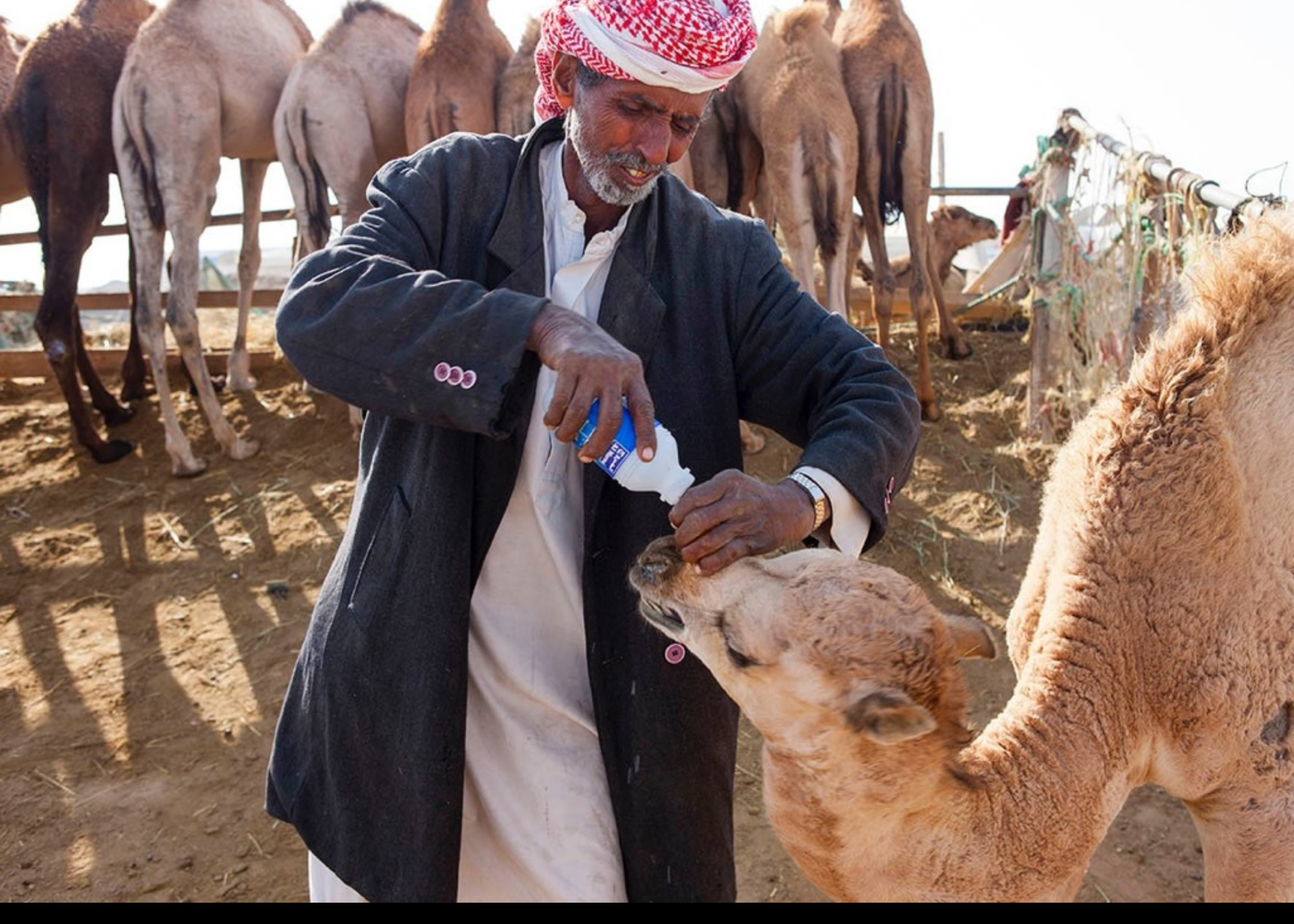
A Rashaida from Eritrea said, "We have sold 150 camels to Saudi Arabia for 100,000 Riyadh each (20,000 euros)".