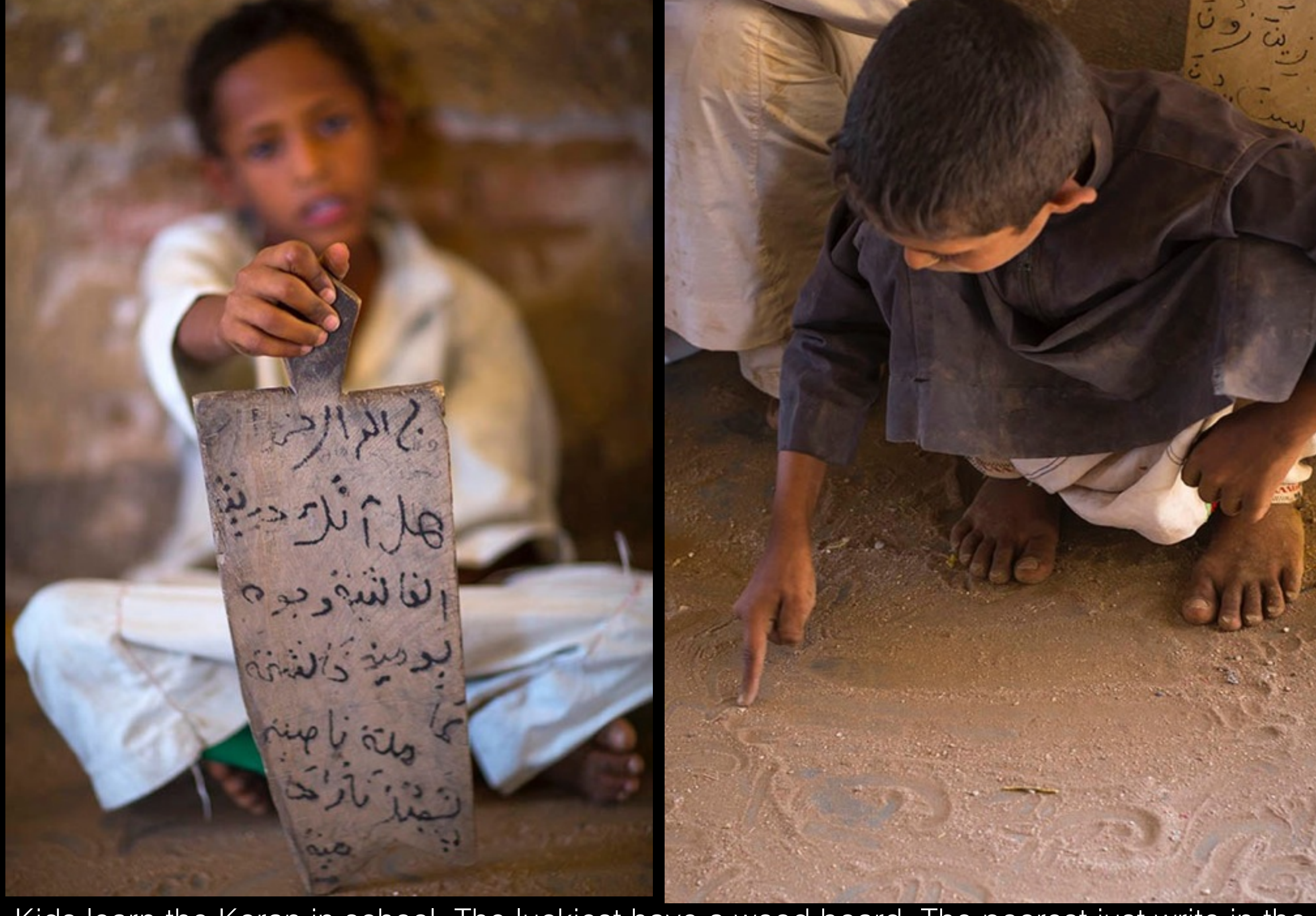
Kids learn the Koran in school. The luckiest have a wood board. The poorest just write in the sand. Kassala, Sudan.