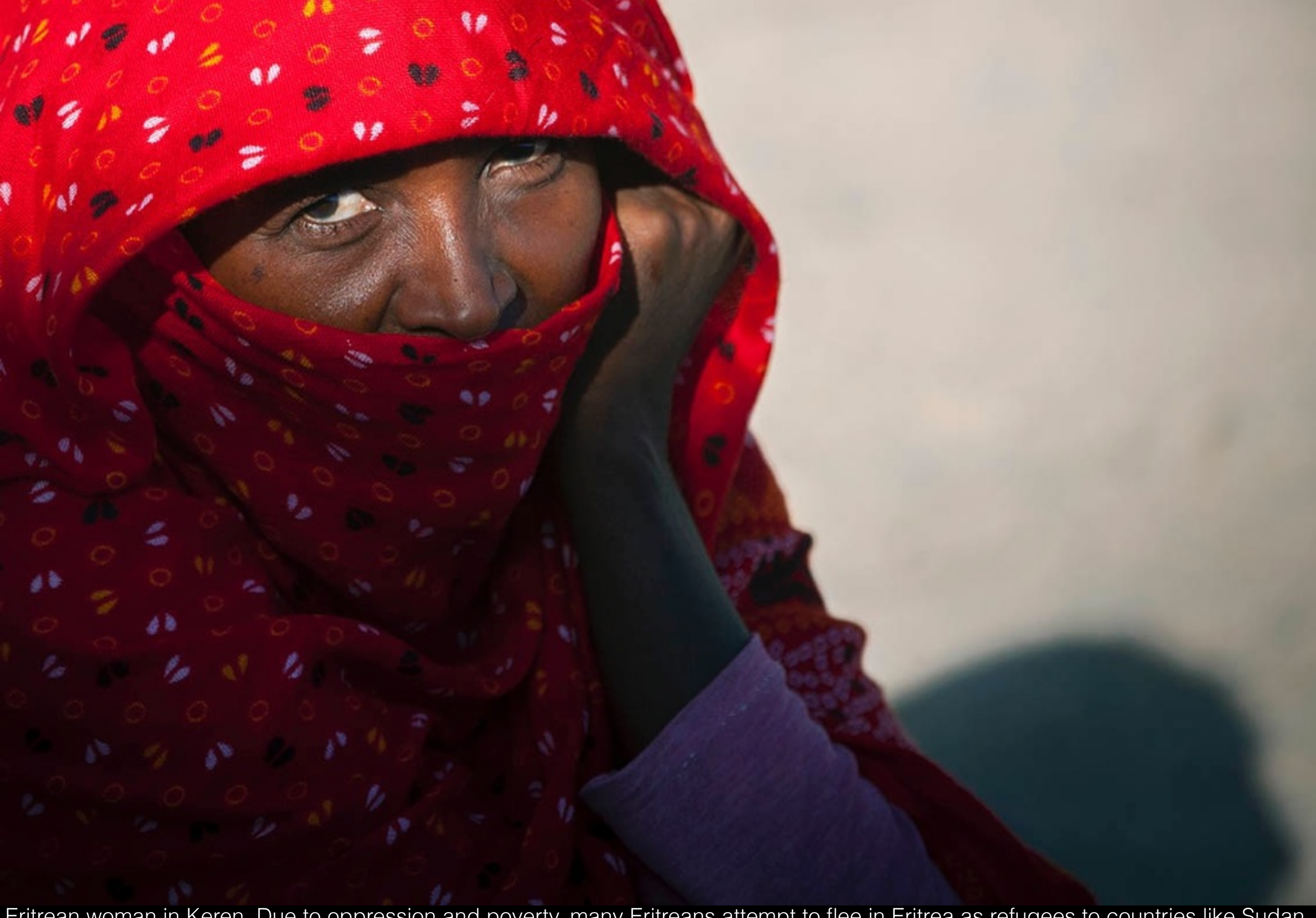
Eritrean woman in Keren. Due to oppression and poverty, many Eritreans attempt to flee in Eritrea as refugees to countries like Sudan. Many rely on human smugglers to help them escape. Some Rashaida are part of this this lucrative business. The UN reports that some of these Rashaida abuse and hold these refugees for ransom.