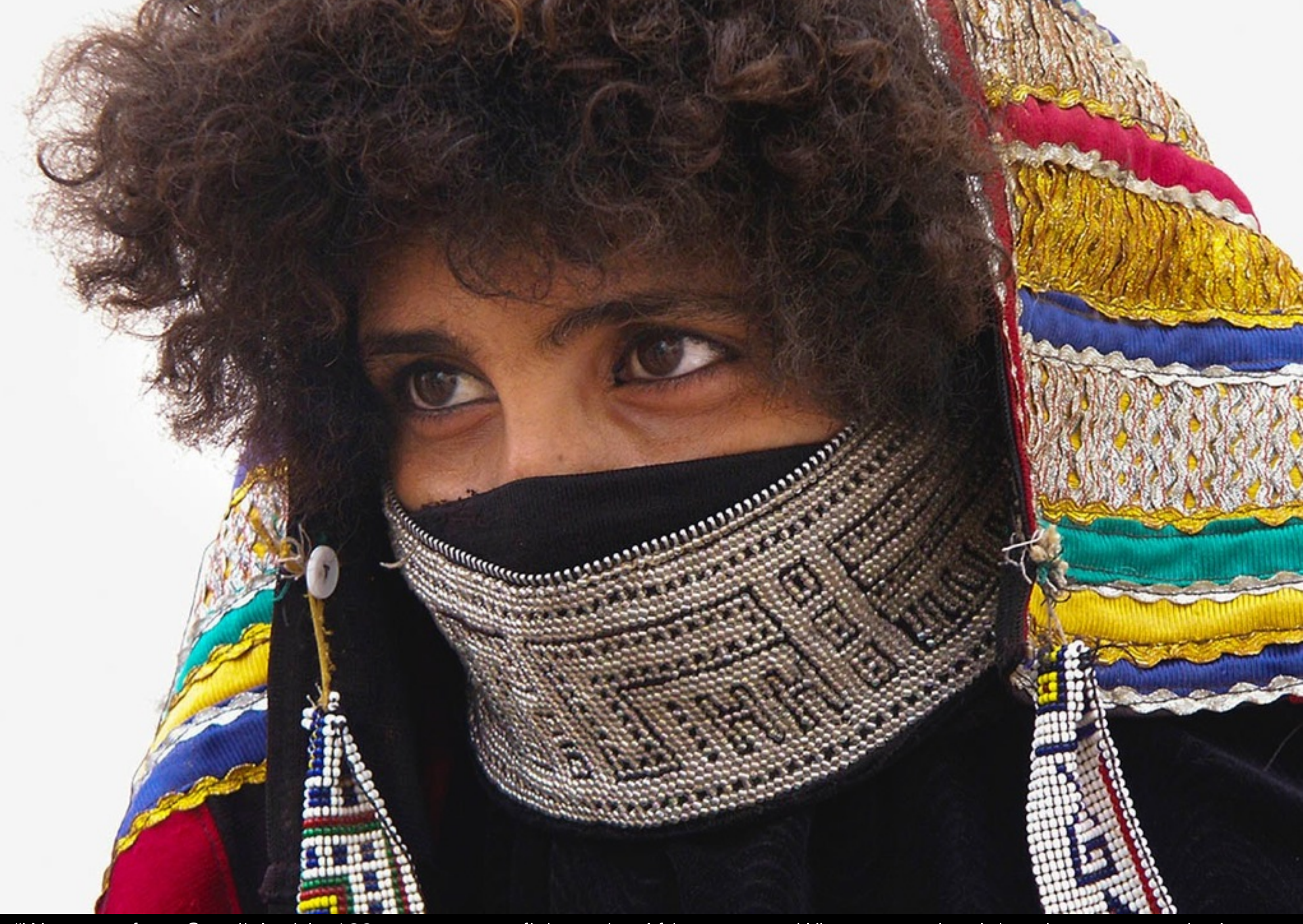
"We came from Saudi Arabia 120 years ago to fish on the African coast. When we noticed that there was agriculture and better weather, we stayed." Other reports say that they were expelled due to tribal warfare!