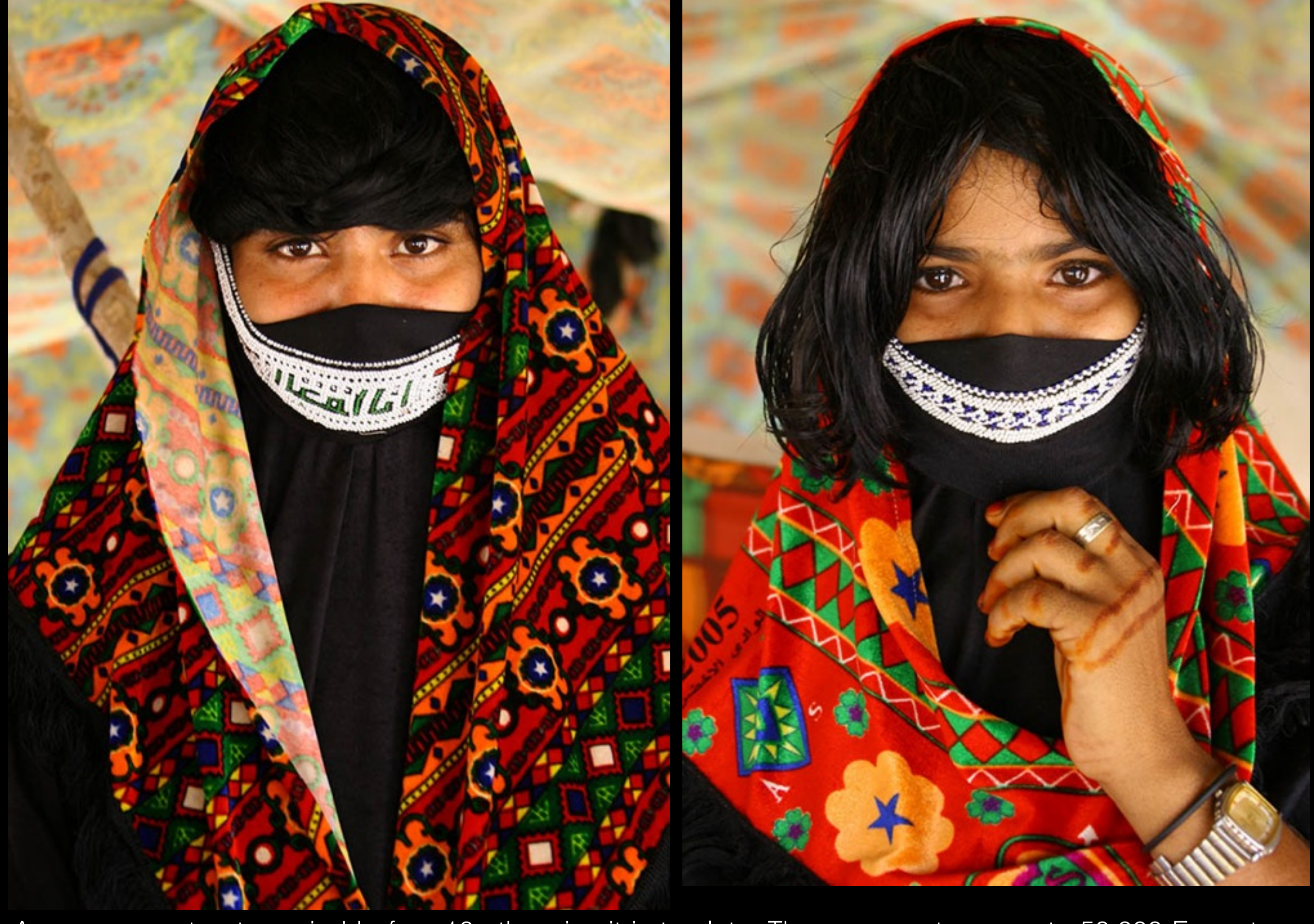
A woman must get married before 16 otherwise it is too late. The man must pay up to 50,000 Euros to the bride-to-be's mother.