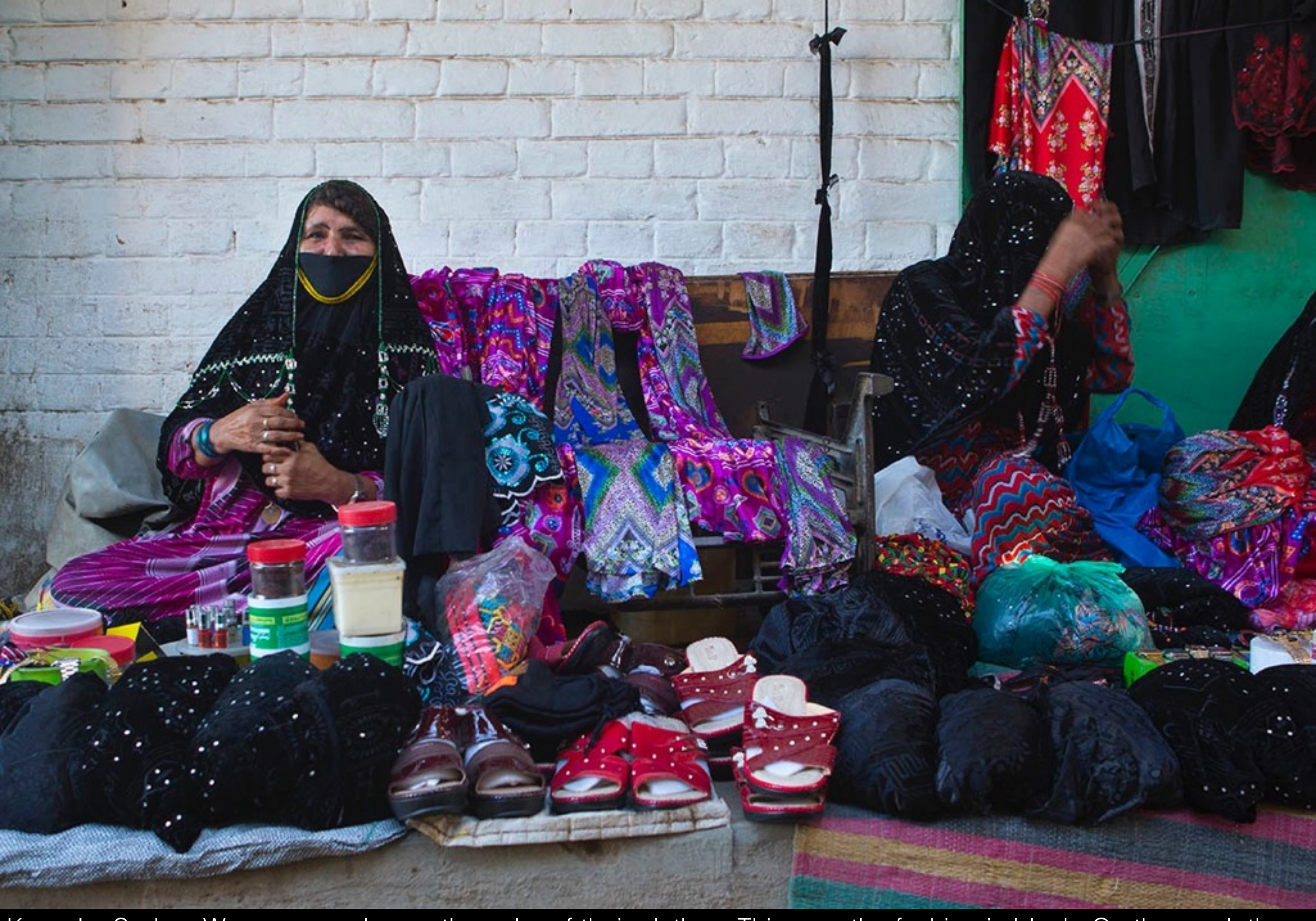
Kassala, Sudan. Women can choose the color of their clothes. This year the fashion is black. On the mask they wear, they like to write messages or name brands, like the name of the mobile phone company.