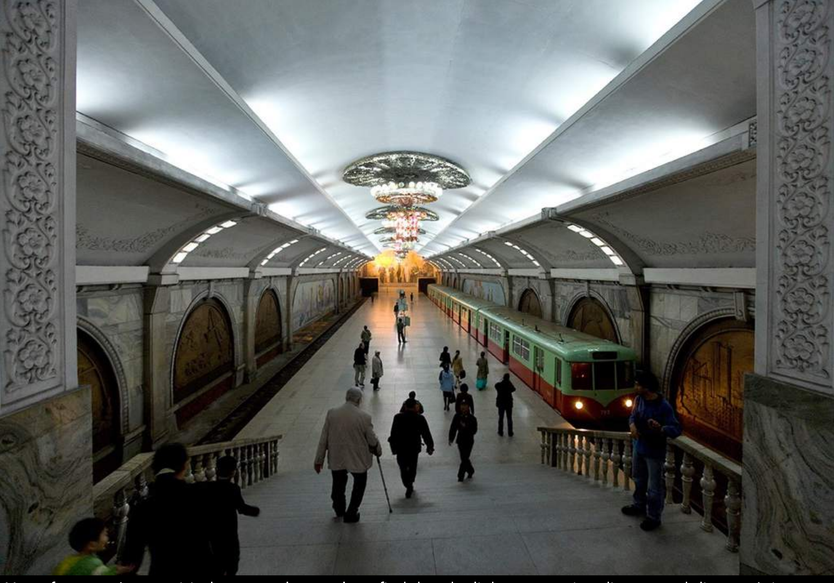
Year after year, I came visit the same place, only to find that the light was getting dimmer and dimmer. It is a way to save energy. Even in places in the underground like here in Puhung station, which means "Revitalization ».