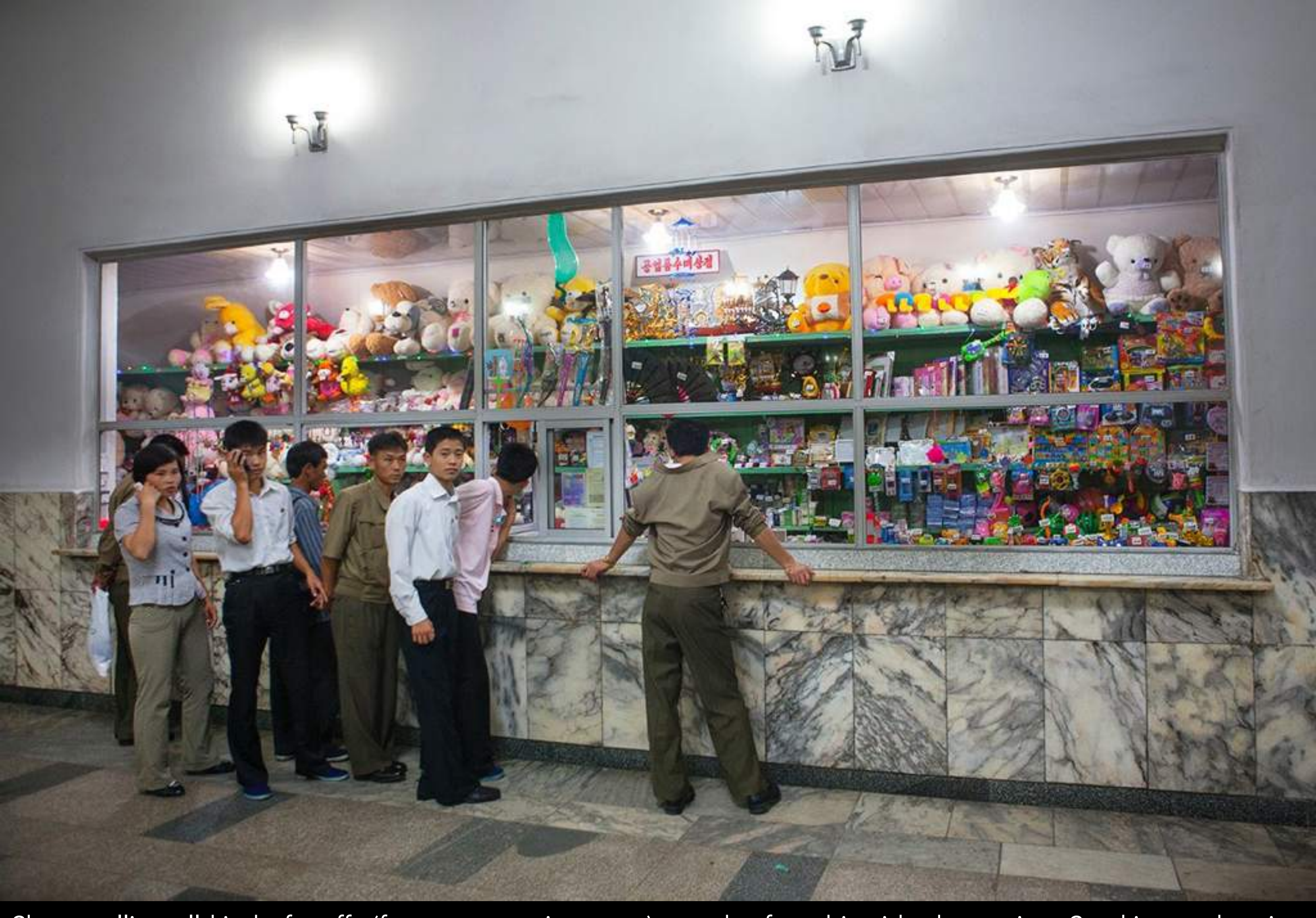
Shops selling all kind of stuffs (from toys to cigarettes) can be found in side the station. Smoking and eating inside the Metro system is prohibited. The walls are totally free of advertising billboards.