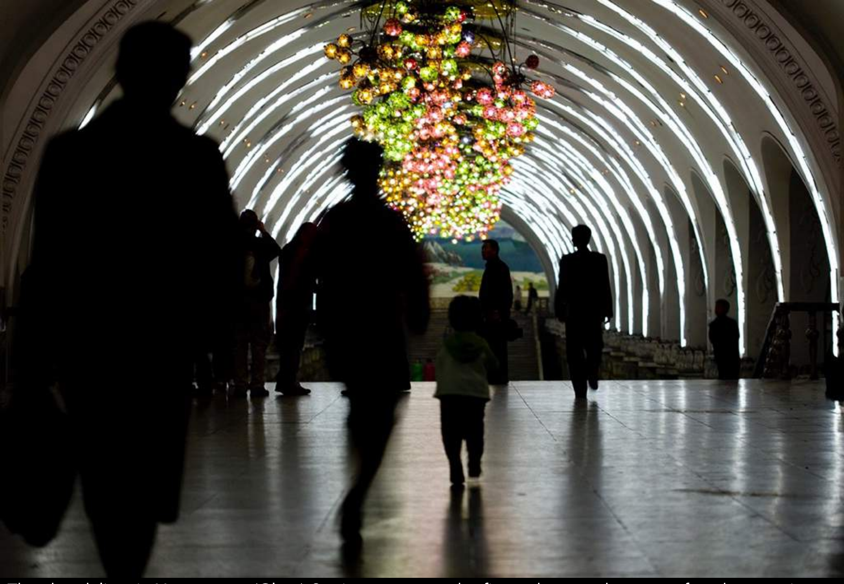
The chandeliers in Yonggwang (Glory) Station represent the fireworks over the town after the war victory. The pillars symbolize victory torches bursting into flame.