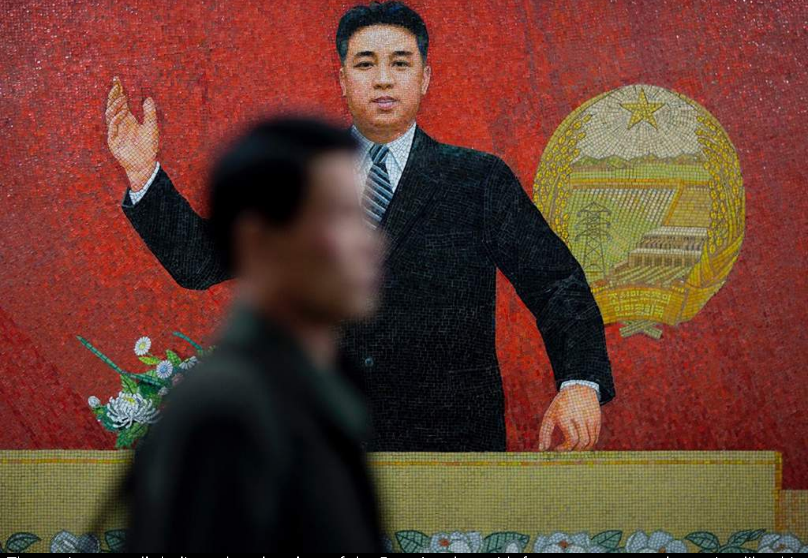
The stations are all dedicated to the glory of the Dear Leaders with frescos, statues and mosaics, like this art piece of Kim II Sung in Puhung Station. Sometimes you feel more like in a museum than in the metro.