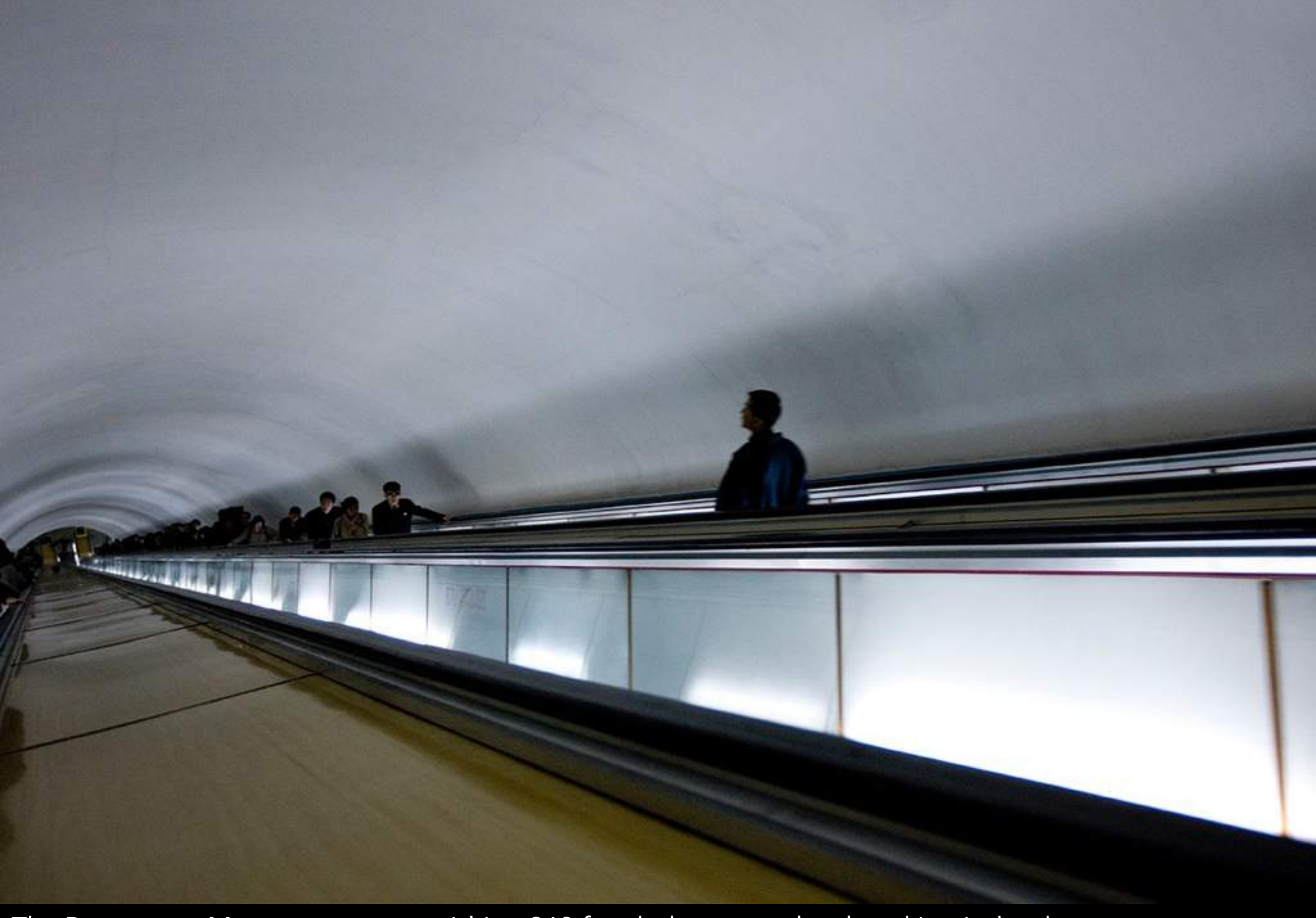
The Pyongyang Metro runs an astonishing 360 feet below street level, making it the deepest metro system in the world.