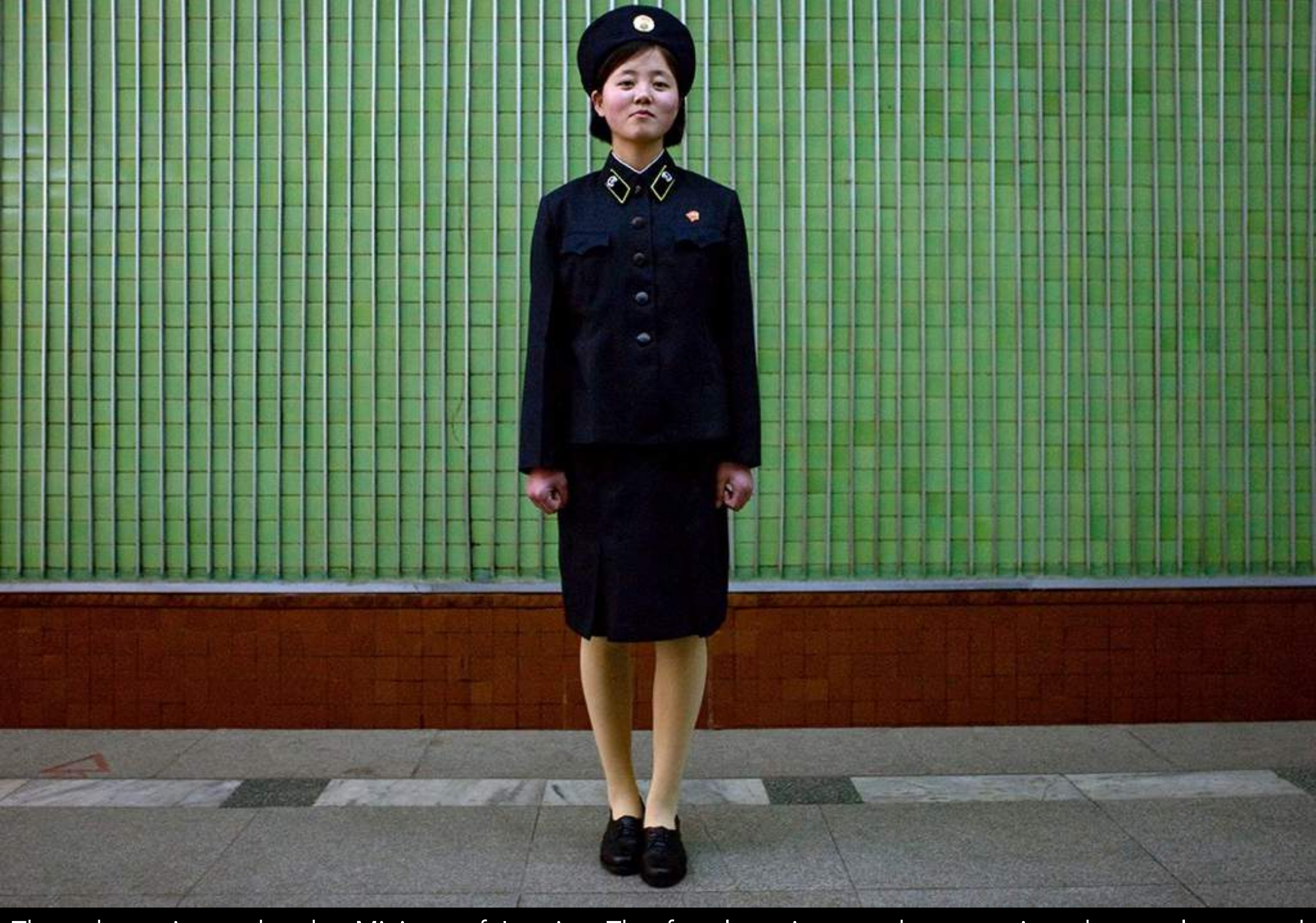
The subway is run by the Ministry of Interior. The female train attendants monitor the escalators and platforms. They are like soldiers on active duty. They wear black uniforms, and have different ranks.