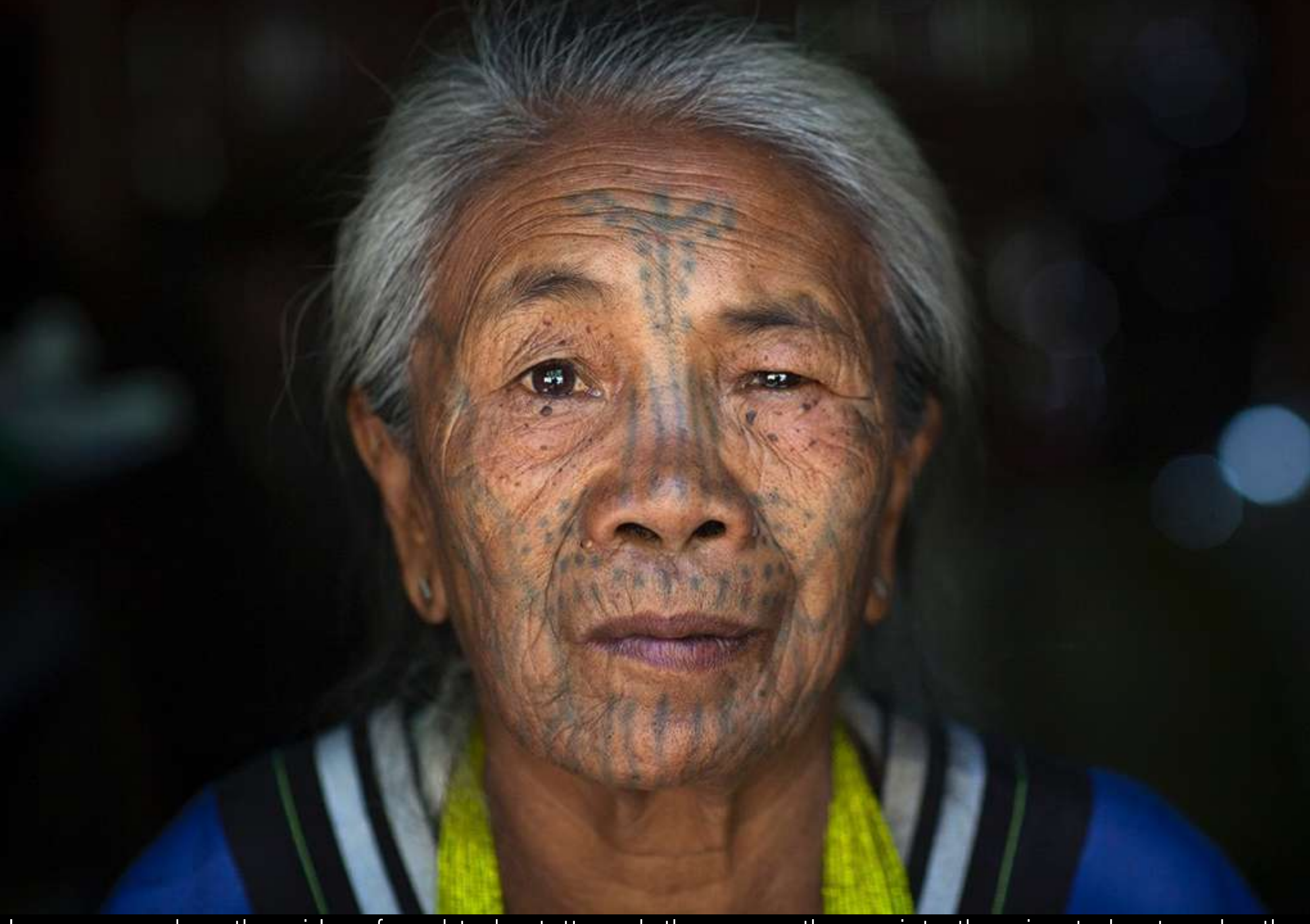
Long ago, when the girls refused to be tattooed, they were thrown into the pig sty kept under the family house until they changed their minds.