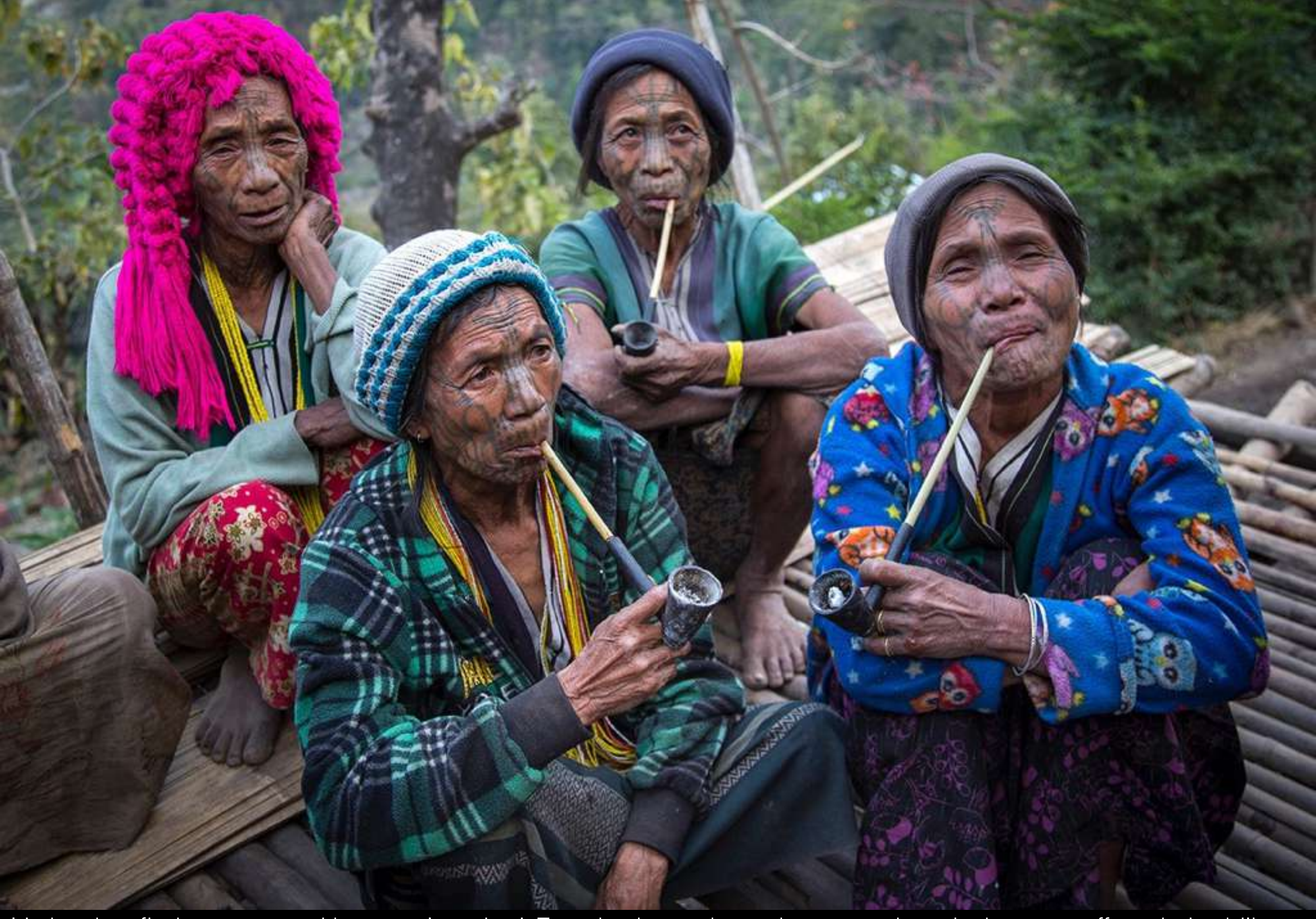
It's hard to find a woman without a clay pipe! Everybody smokes tobacco and yet it does not affect their ability to climb the steep mountain paths for hours while carrying wood or water. They are very strong, even if they look skinny!