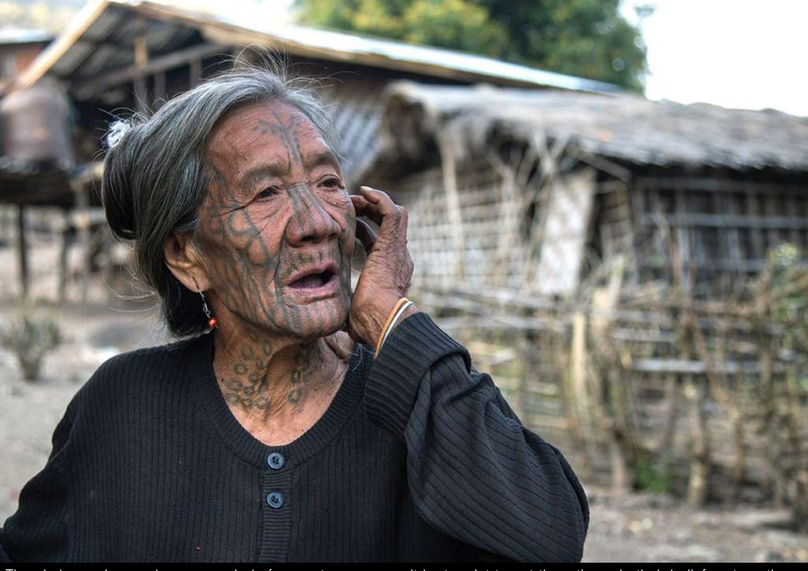
The circles on her neck are a symbol of a great courage as it hurts a lot to get them there. In their belief system, these also means that she will be welcomed with pure water once in the "Place of the Dead". Not all the women have the circles.