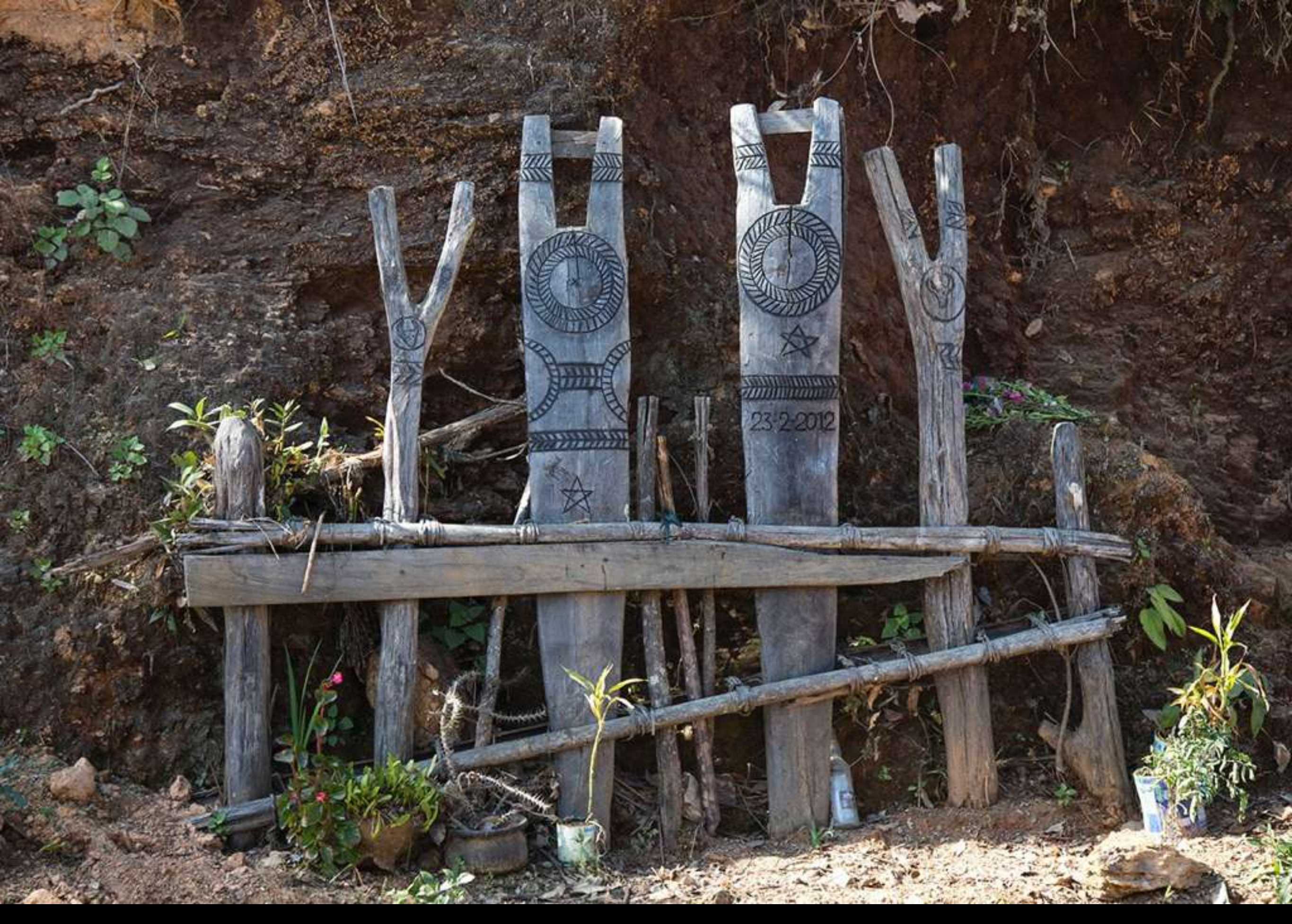
The Y shape of the totems are also represented in some women's forehead tattoos.