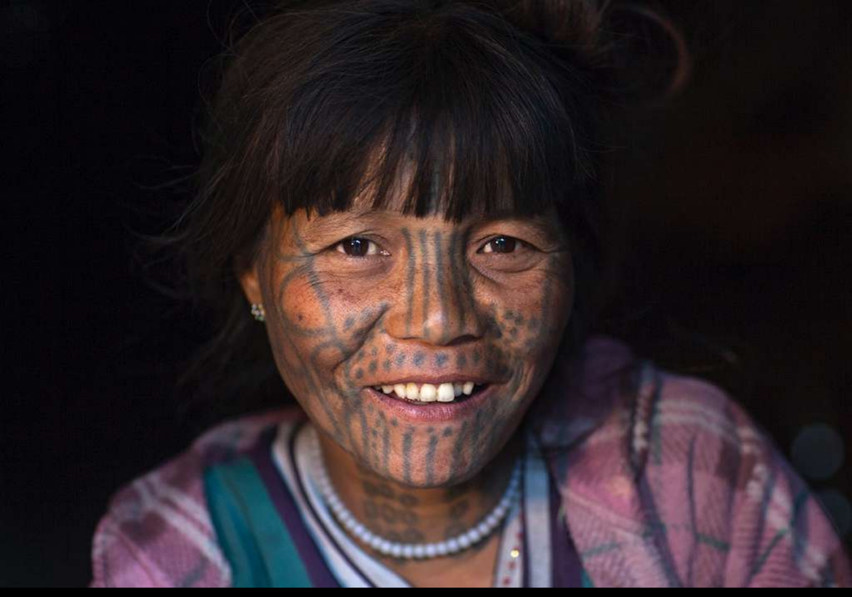
Malicious gossips are forbidden in the Chin culture. If a girl learns about a couple having sex, she must keep it a secret. If she tells the story, she'll have to pay a fine to the community and to the couple.