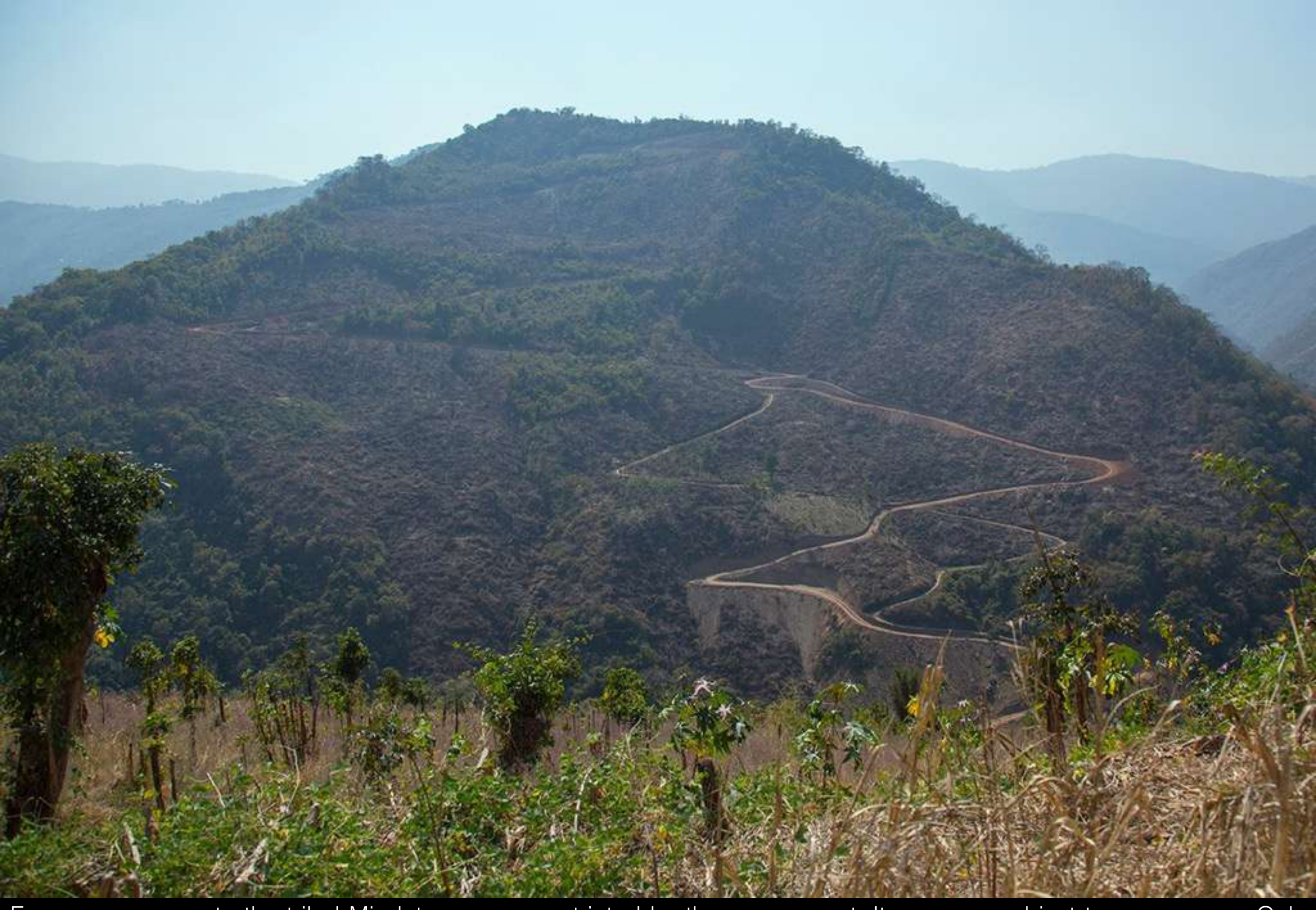
For years, access to the tribal Mindat area was restricted by the government. It was opened just two years ago. Only about 700 tourists visit per year. Most of them only visit the bucolic Mount Victoria by bus, never meeting the tattooed women who remain isolated, hours away by foot.