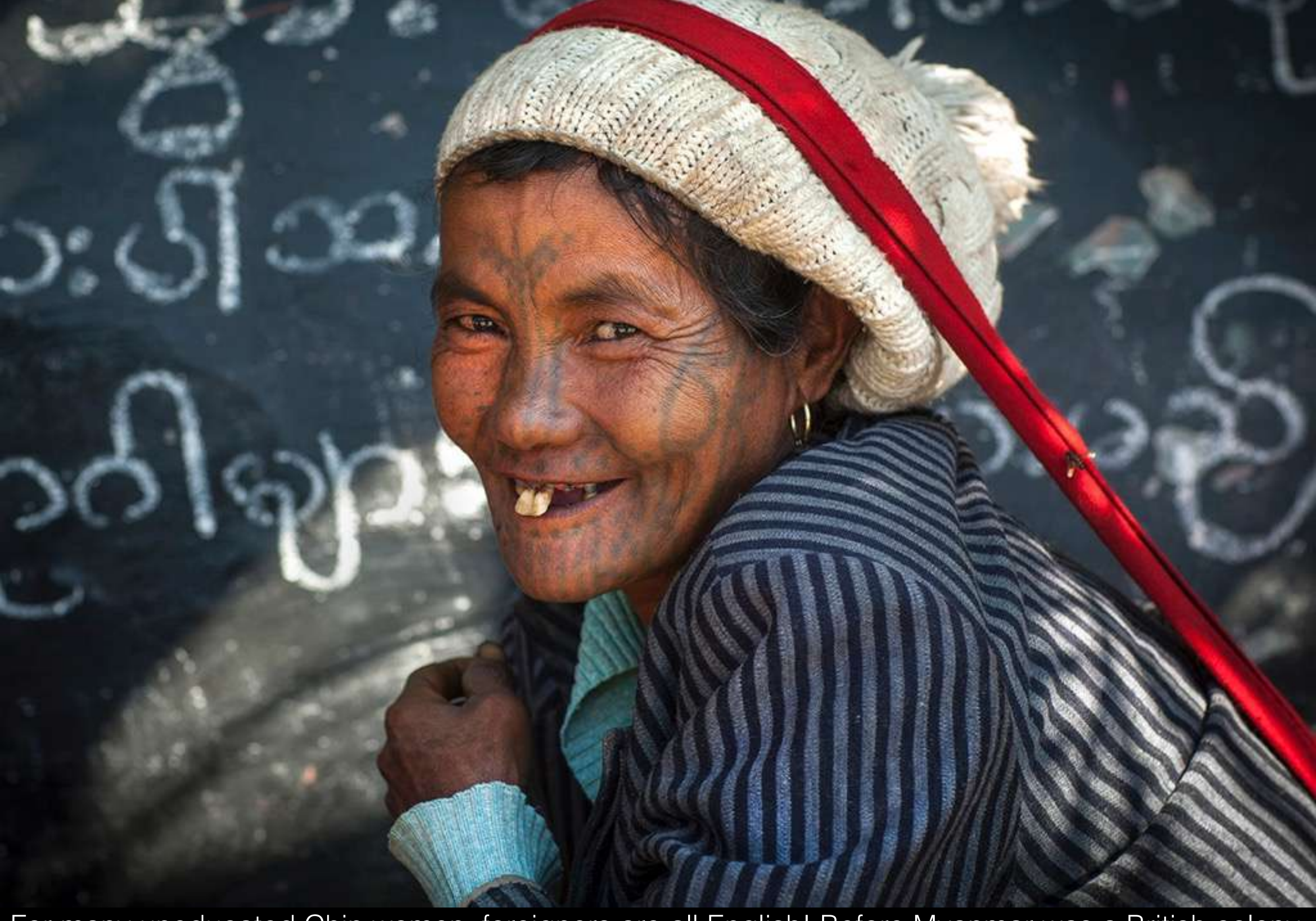
For many uneducated Chin women, foreigners are all English! Before Myanmar was a British colony, they thought white people had been boiled in water!