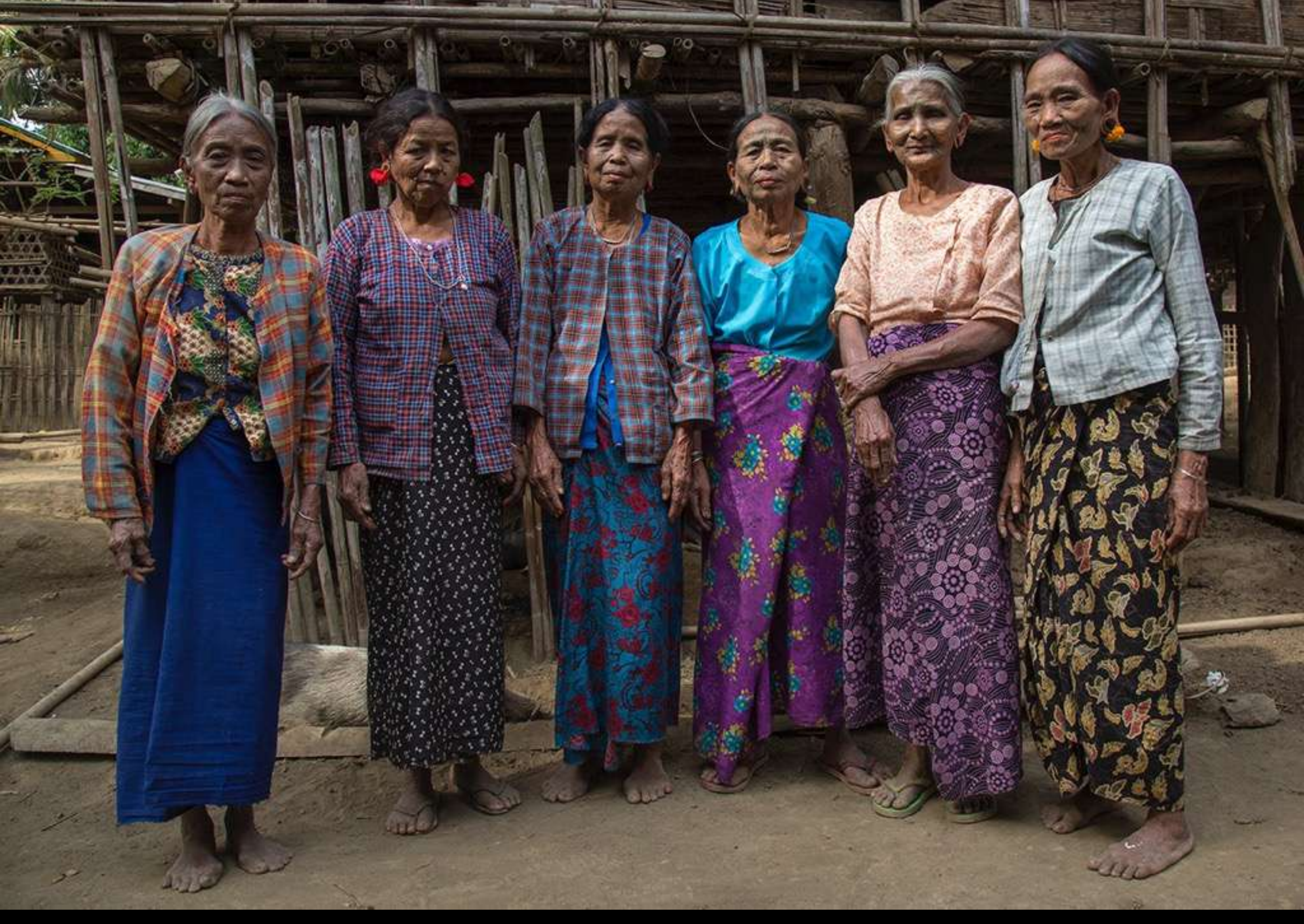
Only six tattooed women remain alive in Pan Baung village.