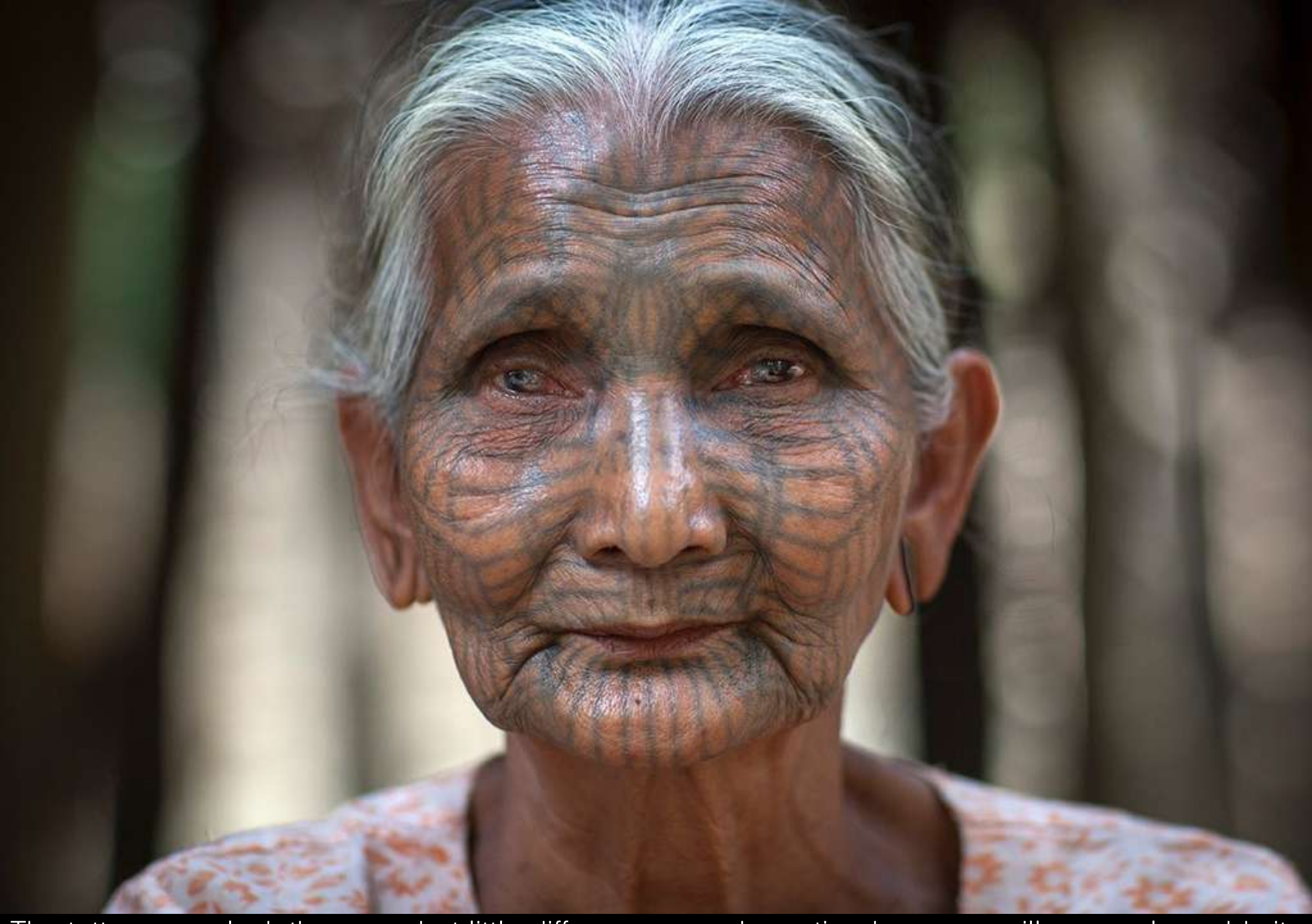
The tattoos may look the same but little differences can be noticed as every village or clan adds its own unique touches.