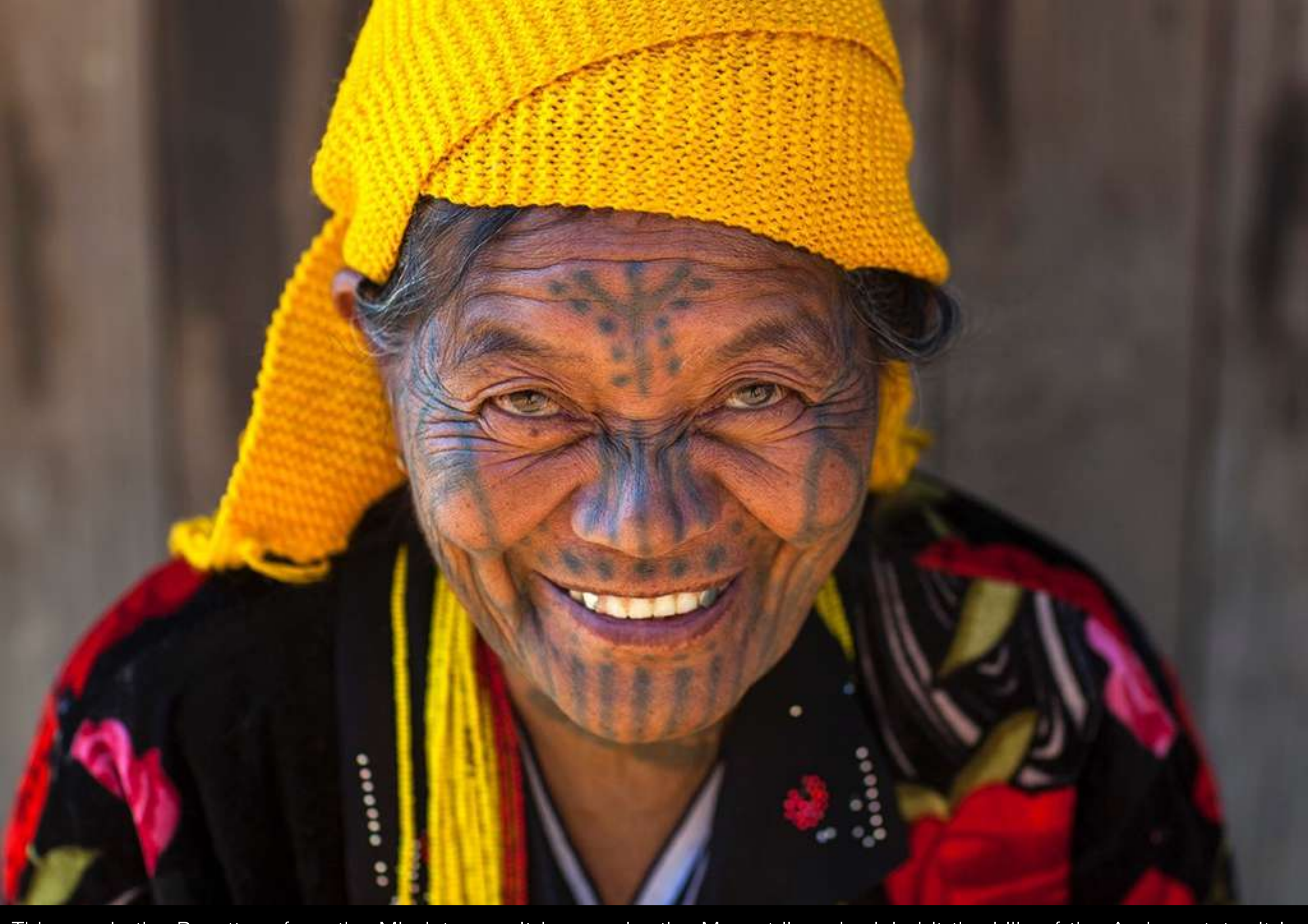
This one is the B pattern from the Mindat area. It is worn by the Muun tribe who inhabit the hills of the Arakan state. It is composed of dots, lines and occasionally circles. Women love to wear headdresses, which are sometimes simply a towel.