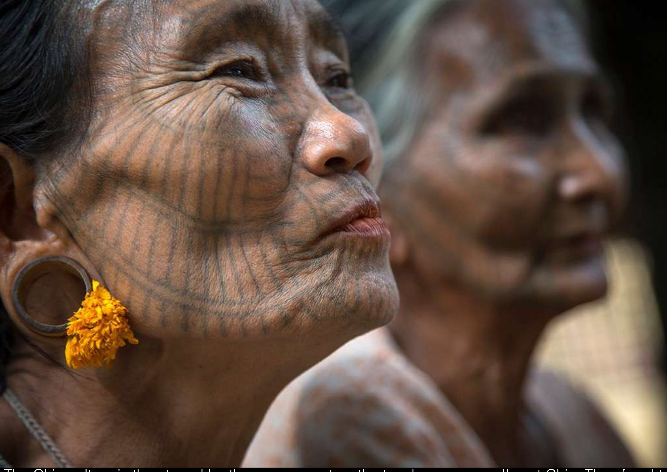
The Chin culture is threatened by the government as the teachers are usually not Chin. They fought for independence for a long time.