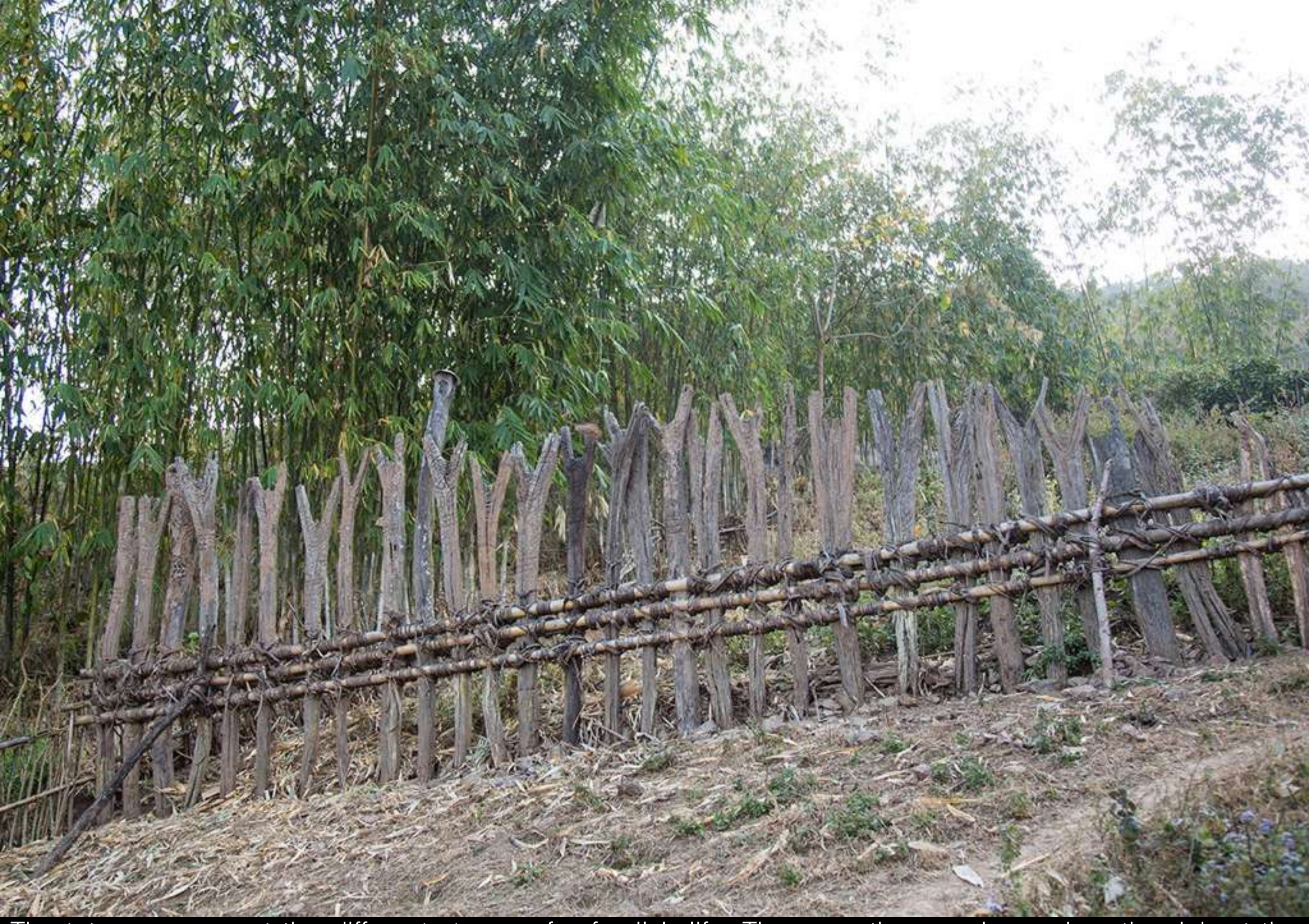
The totems represent the different stages of a family's life. The more they are in number, the richest the family. Each totem represents the sacrifice of buffaloes.