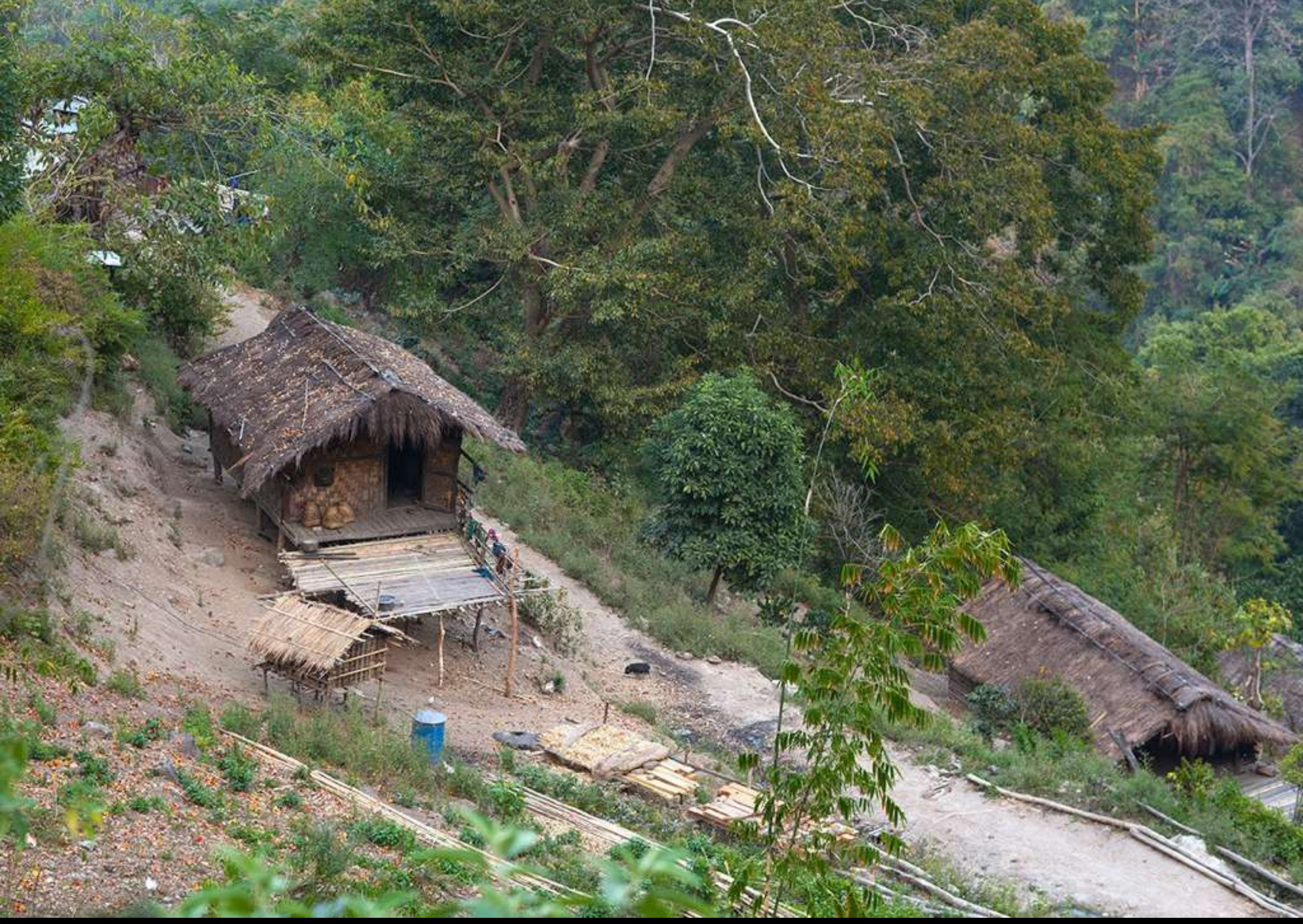
In these steep hills, it takes hours to go from one village to another.