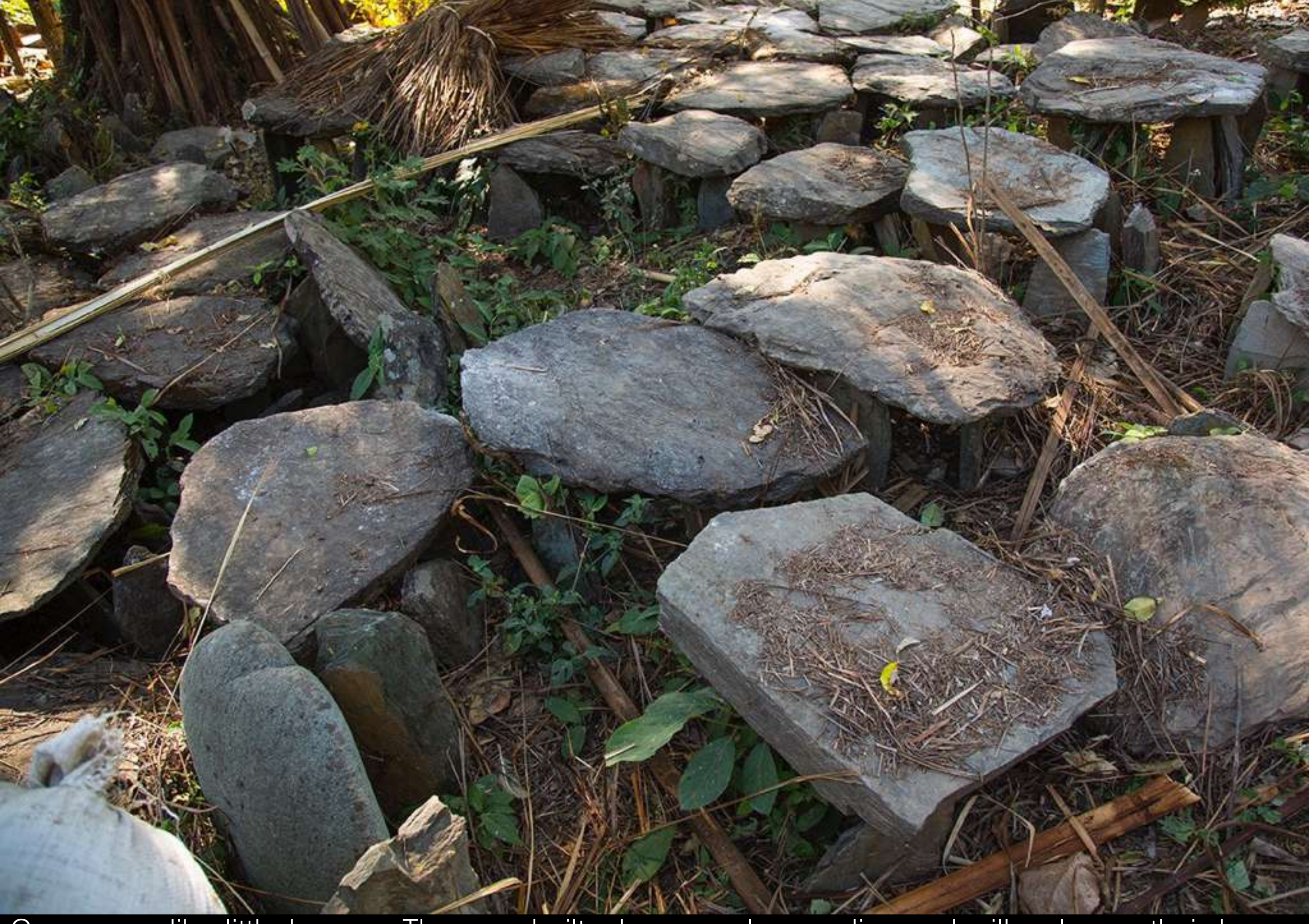
Graves are like little houses. They are built when people are alive and will welcome their bones once dead. Every Chin has one.