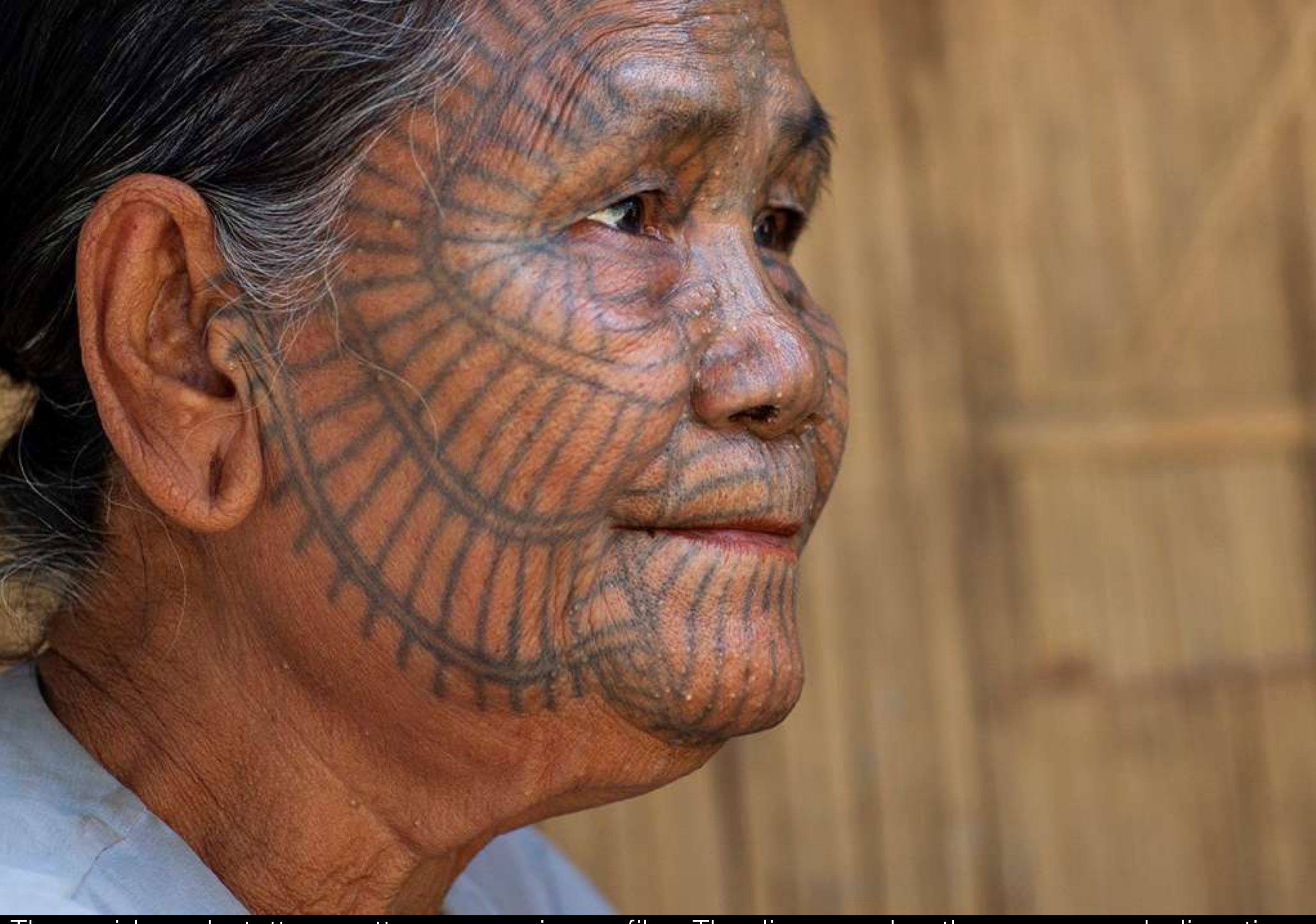
The spiderweb tattoo pattern seen in profile. The lines under the nose symbolize tiger whiskers.