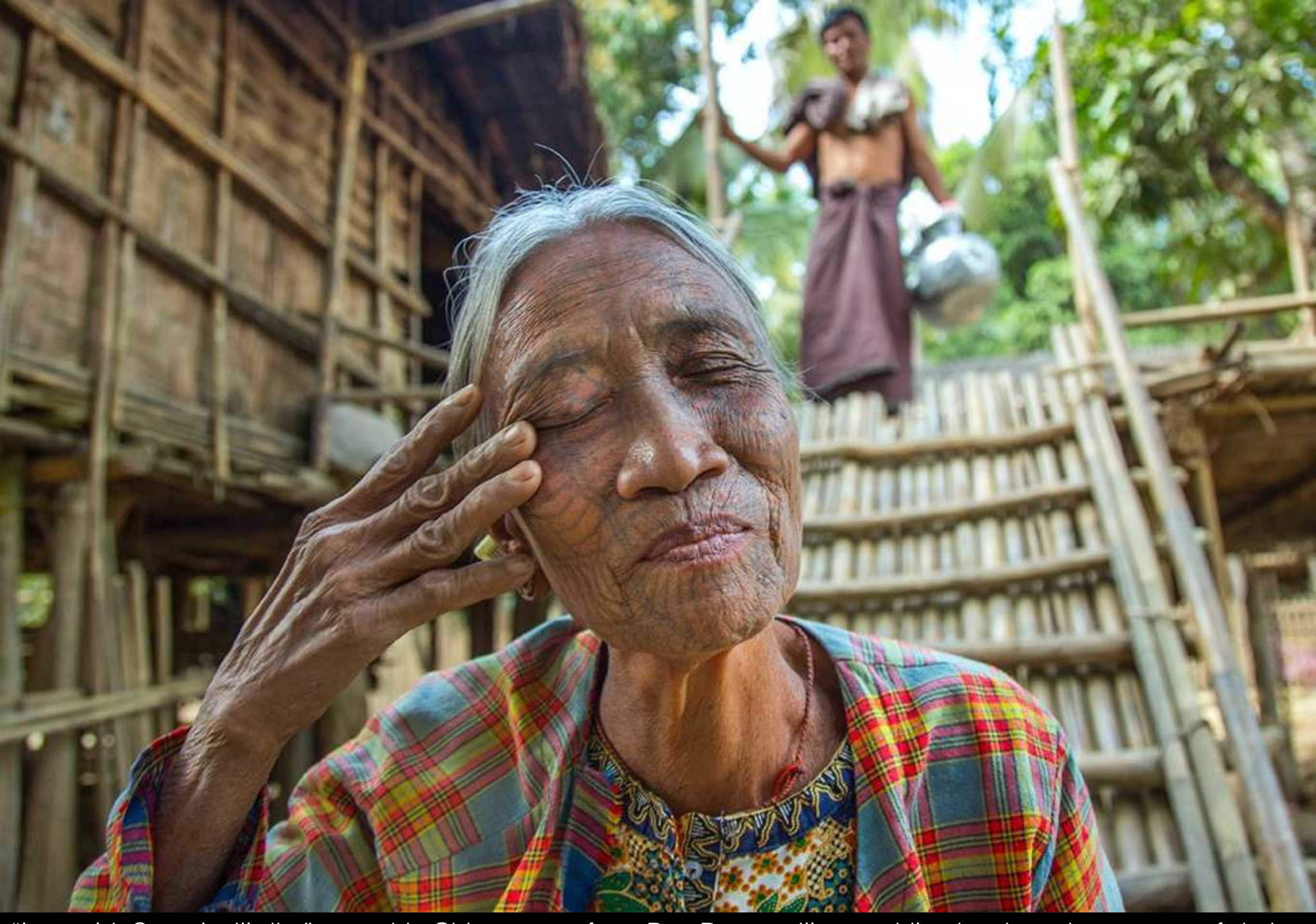
"I am old. Soon I will die," says this Chin woman from Pan Baung village, while she does the gesture of drying tears from her eyes. In her village, only 6 tattooed woman remain alive. Those women are the last of their kind.