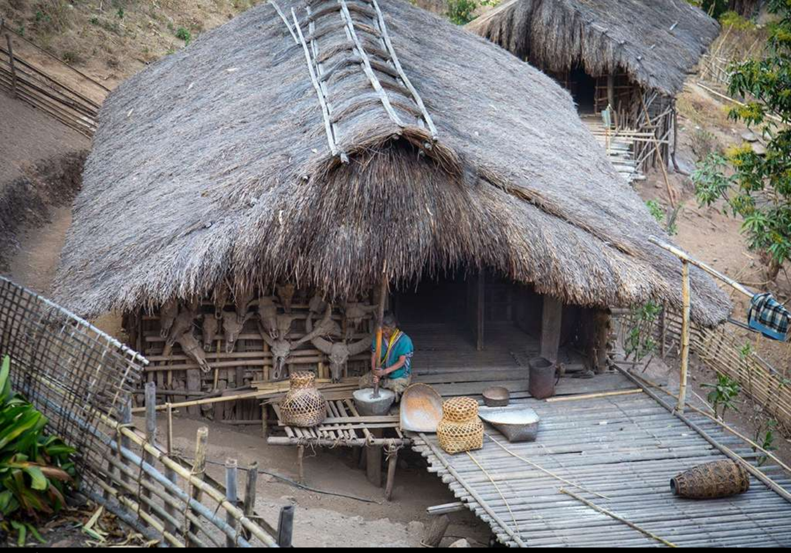
Far from the modern world, many tattooed women live in the hills, without running water, electricity or a mobile network. Most of the commerce is based on barter as there is not very much money in these remote areas.