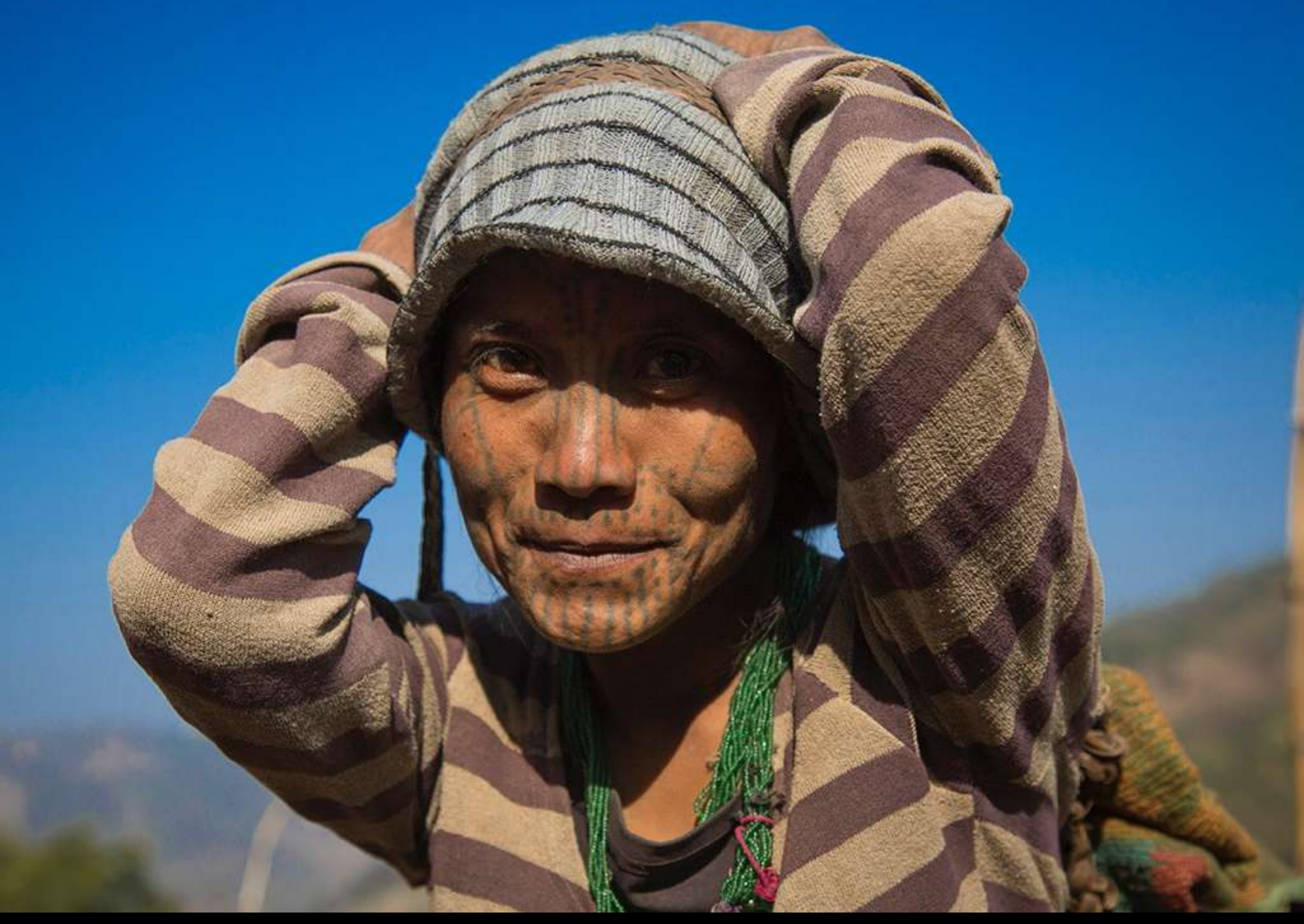
Many women say that they had no choice. They had to obey their parents and get the tattoos.