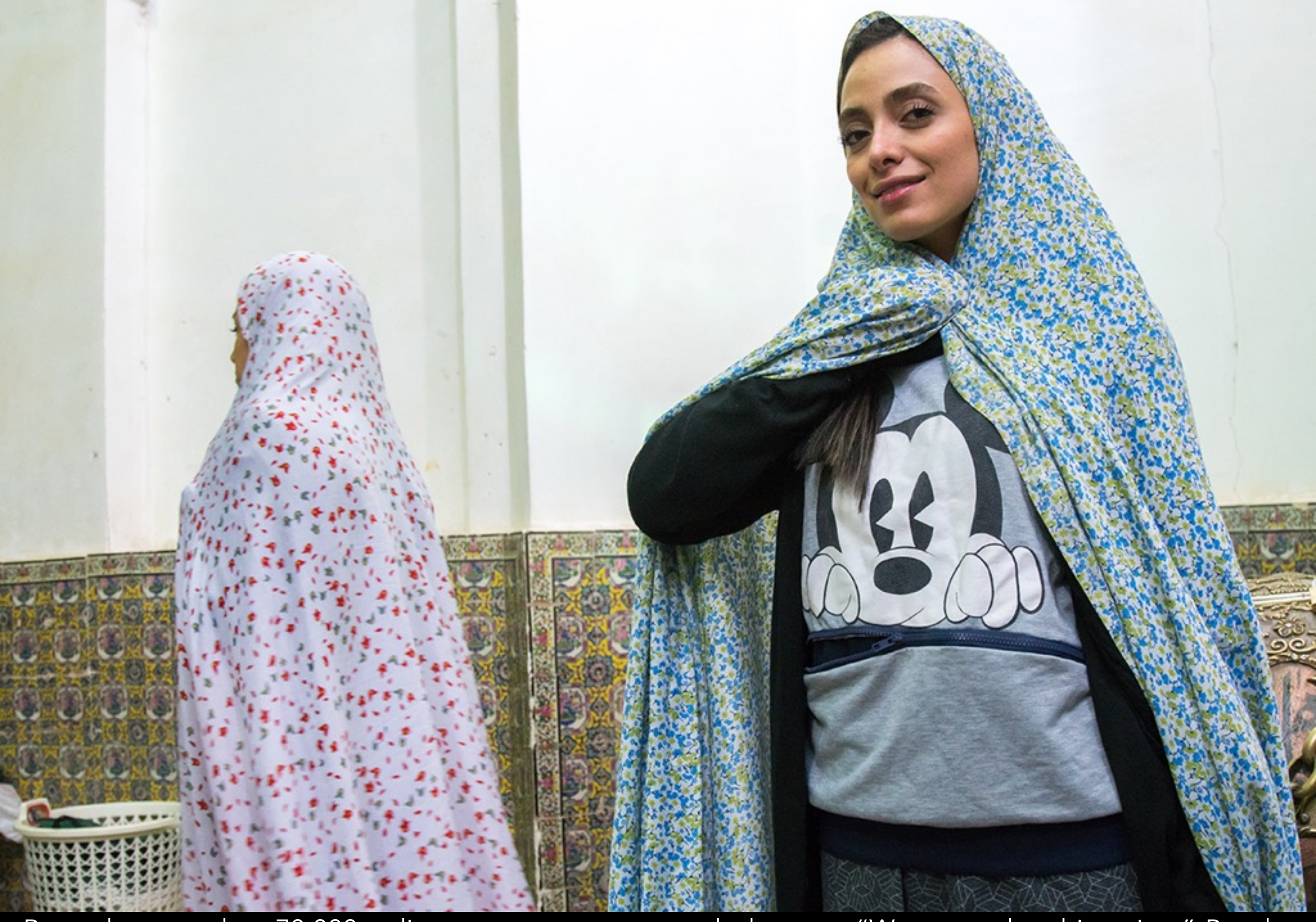
Recently, more than 70,000 policemen were sent to crack down on "Western cultural invasion." But they cannot look everywhere!