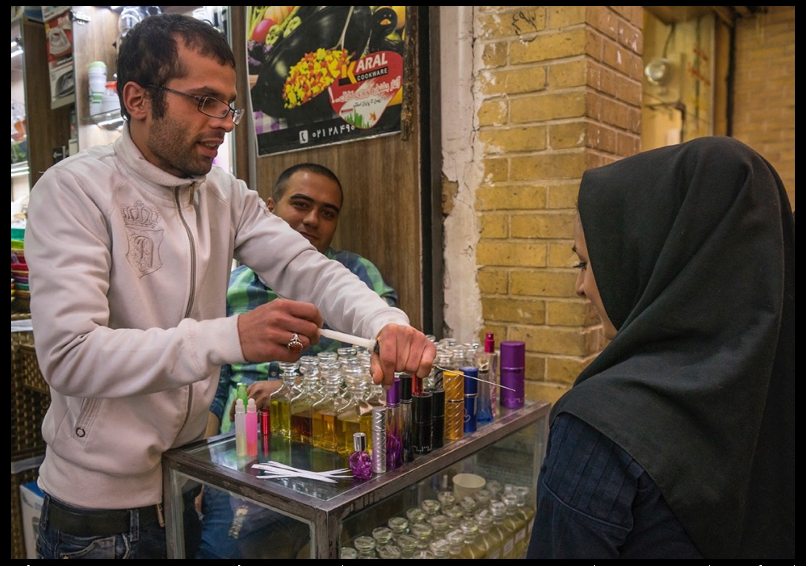
Perfumes are an intrinsic part of a woman's identity in Iran. Men must not touch women, so when a female customer wants to test a fragrance, the seller will use a long syringe to dispense it.