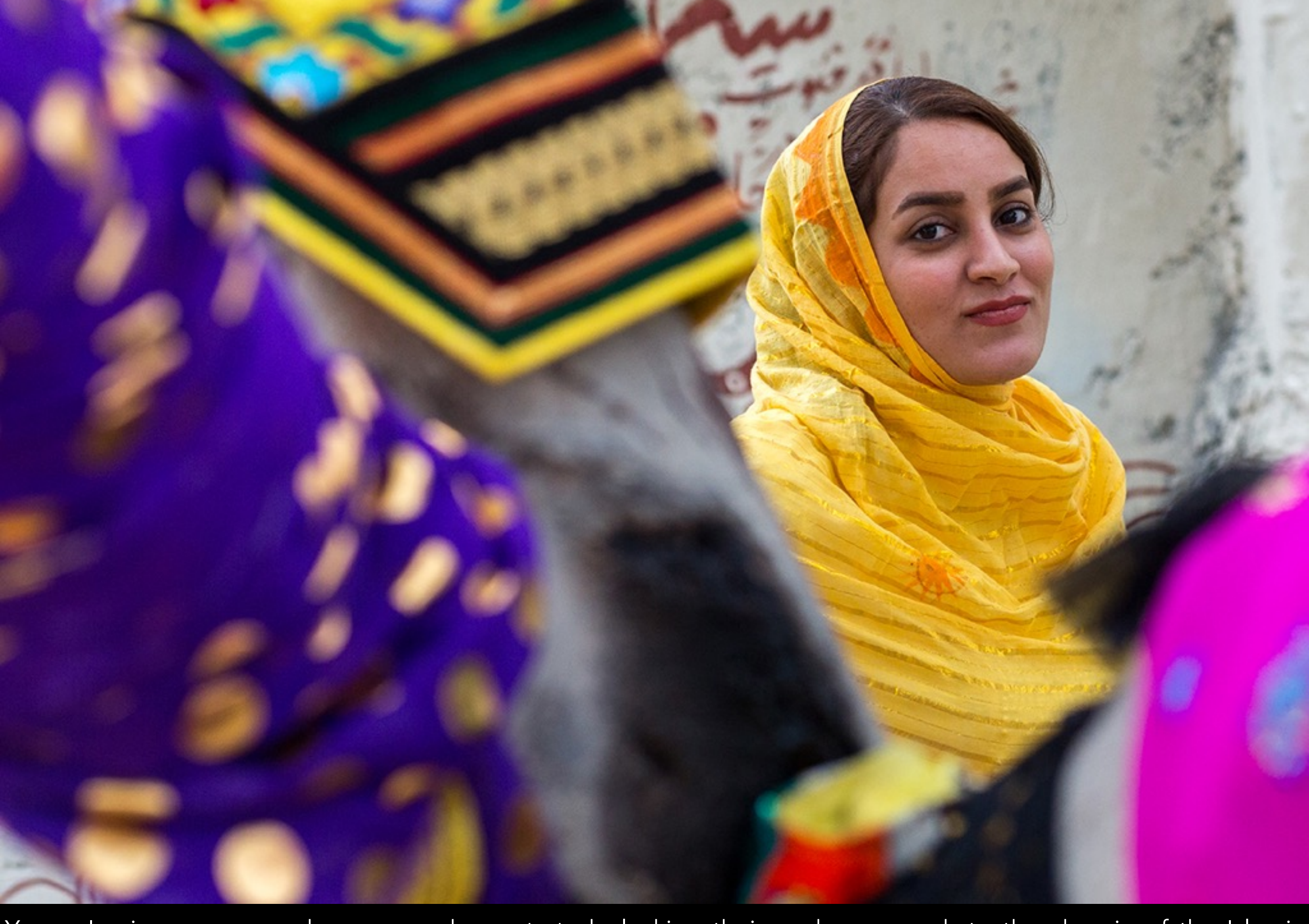
Young Iranian women and even men have started plucking their eyebrows much to the chagrin of the Islamic authorities.