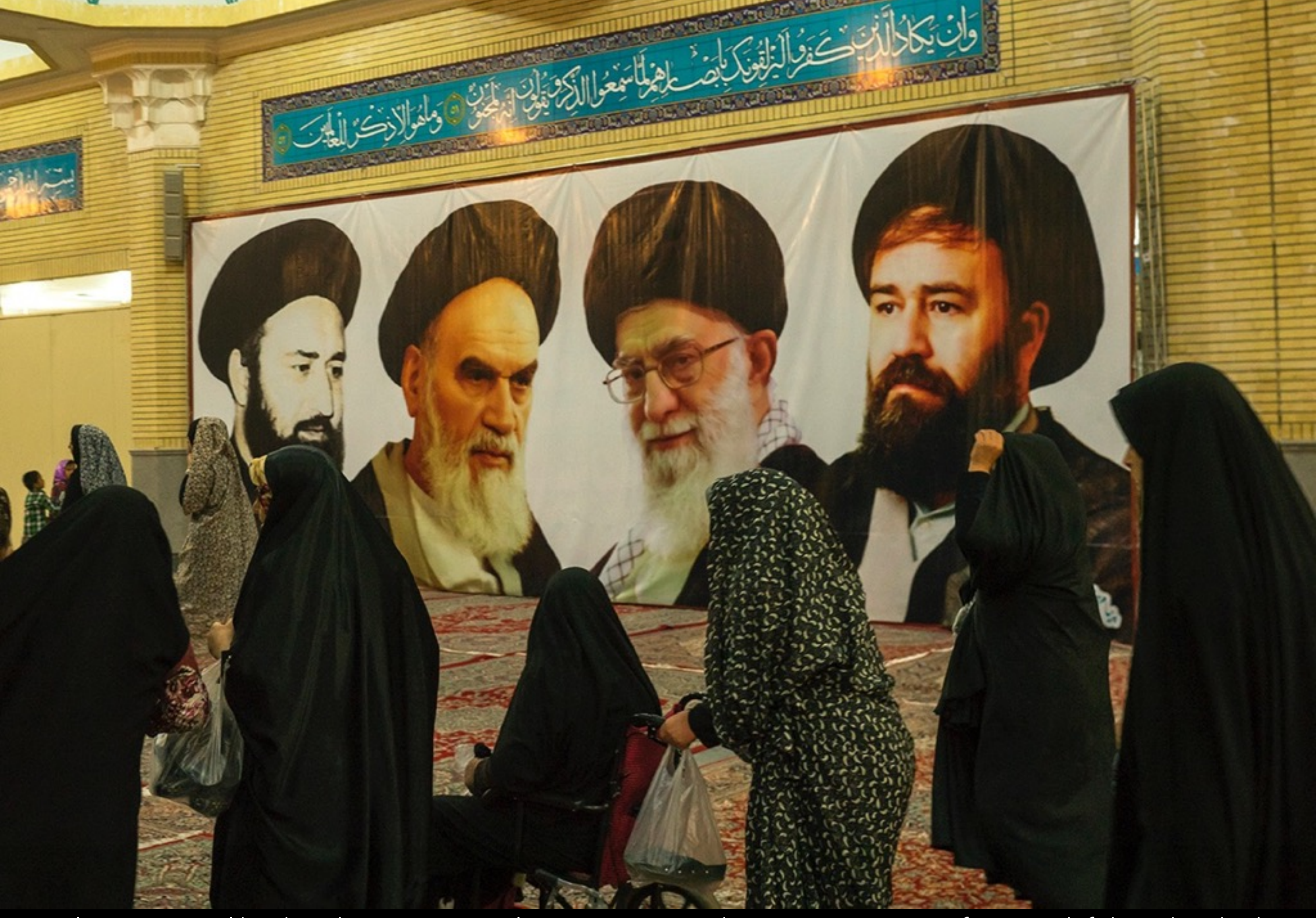
In religious areas like the Khomeini mausoleum, some guards examine women's faces and if they decide that they are wearing too much make-up, they do not allow them to enter the holy place.