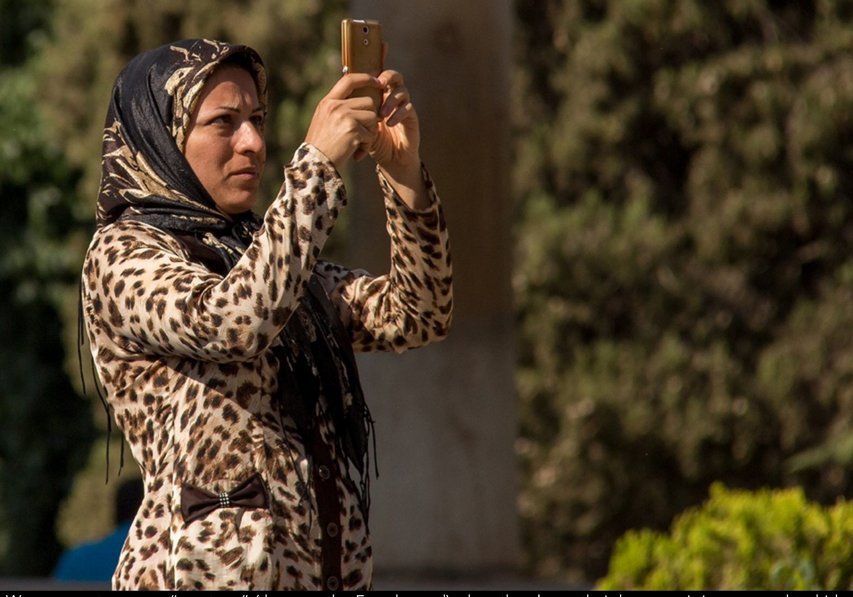
Women must wear a "manteau" (they use the French word) when they leave their home as it is supposed to hide their feminines curves. In the summer, when temperatures rise above 40°C, the layers of clothes are hardly bearable.