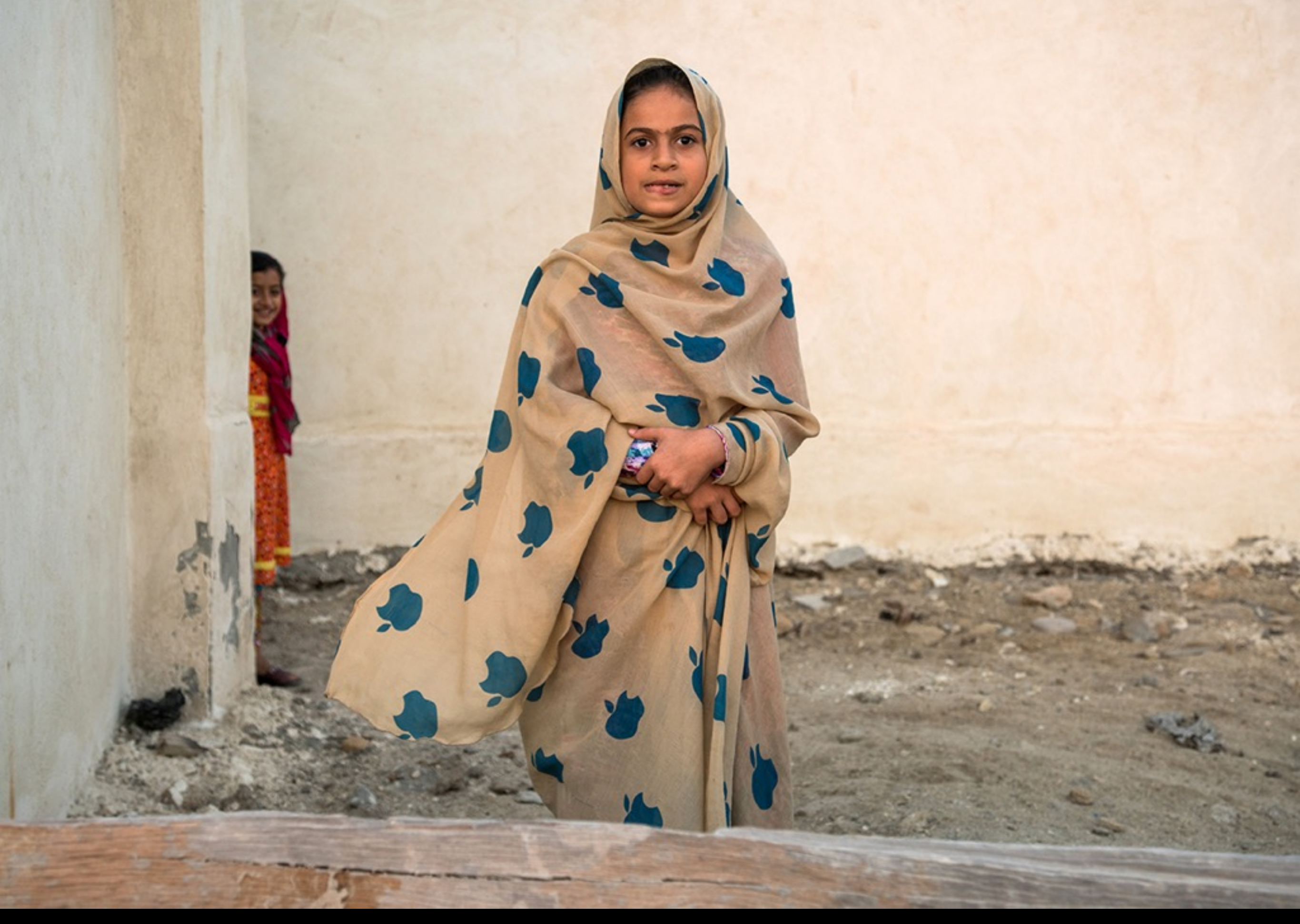
An increasing number of veils and chadors adorned with brand logos can be seen, like this Apple one.